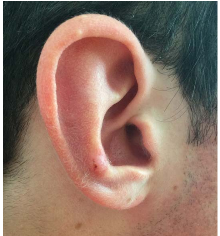
Figure 1. Right antihelix with pink, fibrotic papule with central overlying crust.

First described in the early 1900s, CNH is a benign, inflammatory condition of unknown etiology and likely develops when pressure on anatomically protuberant regions of the ear, such as the helix or