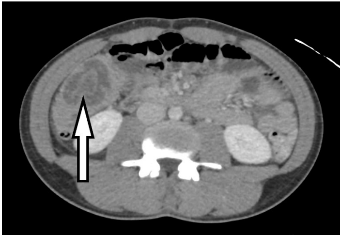
Image 3. Example of the “target” sign (arrow) of intussusception as seen on the patient’s computed tomography.

has traditionally been surgical because of the high proportion of pathologic lead points. Resection of the lead point and any ischemic area is the traditional surgical goal. There is, however, a more recent acknowledgment that with the development and increased use of better diagnostic imaging, more idiopathic or incidental intussusceptions are being diagnosed and that some adult patients may be treated non-surgically. 14 If adult intussusception patients display obstructive symptoms, GI bleeding, or have a palpable mass, surgical exploration may still be the most appropriate option. 15