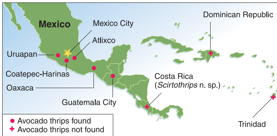
Fig. 1. Locations of foreign exploration for avocado thrips ( Scirtothrips perseae ) in Mexico and Central America.

In order to identify host-specific natural enemies that are climatically preadapted to California and successfully establish biological control of this pest, it is essential to determine the geographic distribution of avocado thrips in its native habitat. Our host-plant surveys in California indicate that avocado thrips feeds and reproduces only on avocados. We suspect that the natural range of this pest is closely correlated with the centers of origin of the host plant. Three distinguishable ecological races or subspecies of avocado ( Persea americana ) are recognized: (1) Mexican ( P. americana var. drymifolia ), (2) Guatemalan ( P. americana var. guatemalensis ) and (3) West Indian or Caribbean