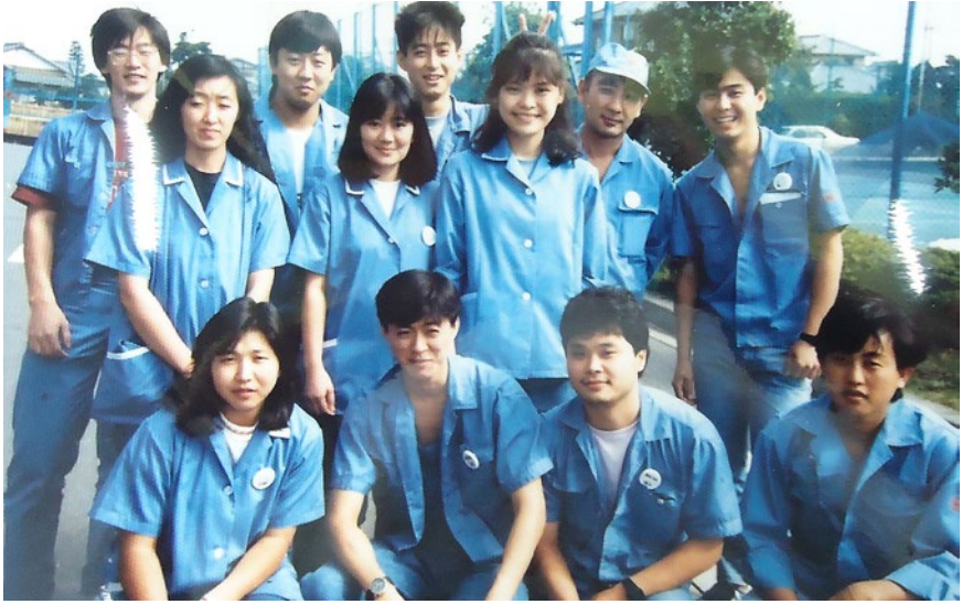
FIGURE 5.4. {to come}

about beautiful geishas with kimonos of the Edo period, only to realize that Ginza is now a commercial area; likewise, in “As rās” (The Frogs), he daydreams about encountering heroic samurai with katanas (swords) in the Chūbu region. 7 The two poems, included in his collection Poema para Você (Poem for You, 1996), underscore the contrast between an idealized ancestral Japan and his contemporary Japan. Although these negative feelings toward the host country may eventually improve, such an evolution is not generally mentioned in dekasegi cultural production.