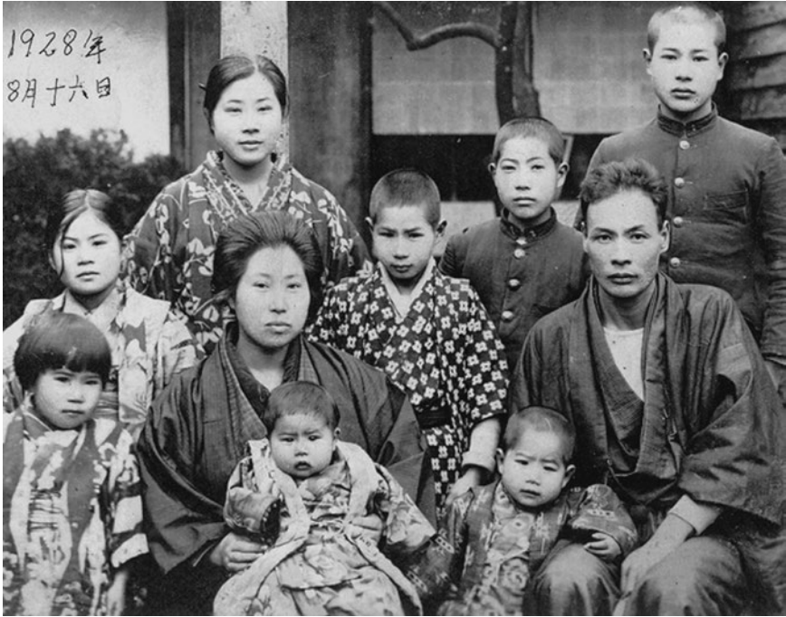
FIGURE 1.1. Japanese immigrant family in Japan (collection of the Historical Museum of Japanese Immigration in Brazil).