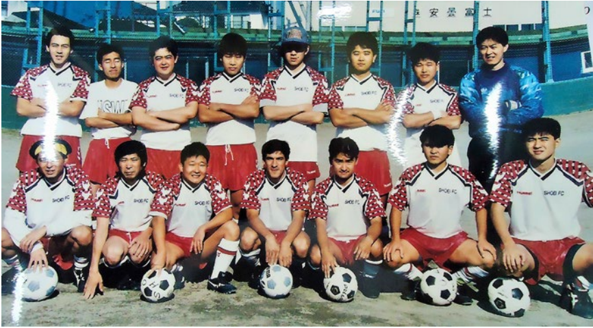
FIGURE 5.2. {to come}

simply an aspect of globalization and a term that refers to anyone working abroad.