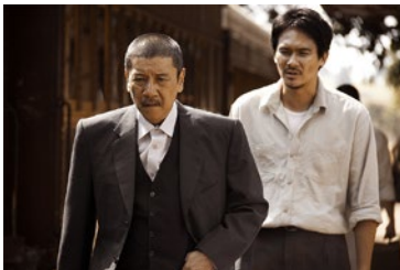
FIGURES 4.1–4.4. Scene from Corações Sujos (courtesy of Vicente Amorim, director of the 2011 Brazilian film Corações Sujos ).