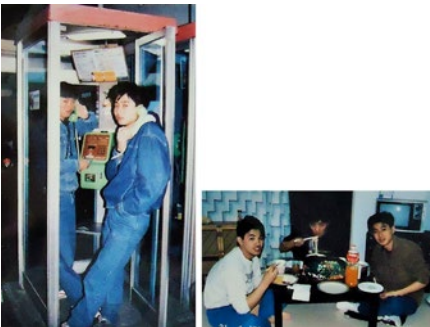
FIGURES 6.1–6.5. Brazilian dekasegi workers in Japan (courtesy of CIATE Centro de Informação e Apoio ao Trabalhador no Exterior Center for Information and Support to Overseas Workers).