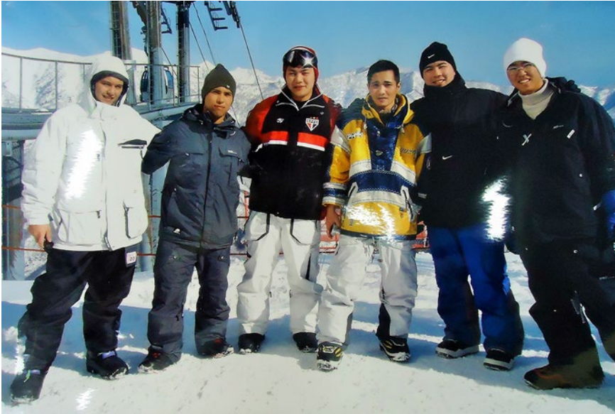
FIGURE 5.1. {to come}

immigrants” 42). The ethnic media’s explicit rhetoric of success assumes the common fate of these two diasporas separated only by time. In Cherrier’s view, however, the artificial convergence of a common imaginary dangerously blurs the very different sociopolitical and economic circumstances surrounding both migrations. I would add that the fact that 40 percent of the Brazilian dekasegi who moved to Japan have returned to Brazil, together with the shuttling back and forth between Japan and Brazil that has marked the experience of many of these transmigrants, further differentiates the two diasporas. Ironically, Cherrier herself inadvertently resorts to a similar mirroring approach in a different article: “Japanese politics has always been informed by a utilitarian logic that treats migrants as if they were objects: sending Brazilian Nikkeijin, who have become undesirable, back to their country followed their sending, a century earlier, their impoverished and unwanted Japanese ancestors abroad.” 3