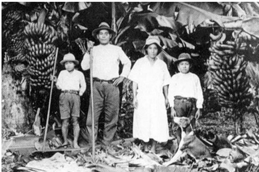
FIGURE 1.2. Japanese workers in the banana harvest in Brazil.

to be admitted as immigrant workers, they must have Japanese ancestry or be married to Nikkeijin, an inherently racist policy endorsed by both the Japanese and the Brazilian governments.