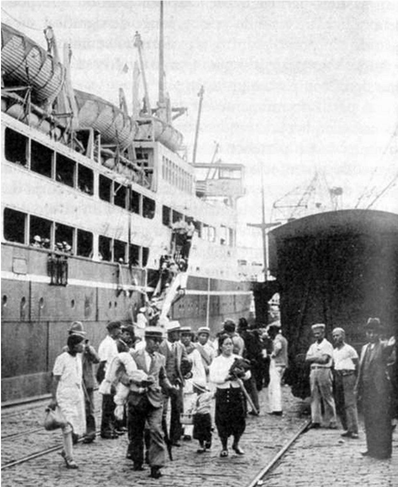
FIGURE 1.3. Japanese immigrants arriving in Brazil (collection of the Historical Museum of Japanese Immigration in Brazil).