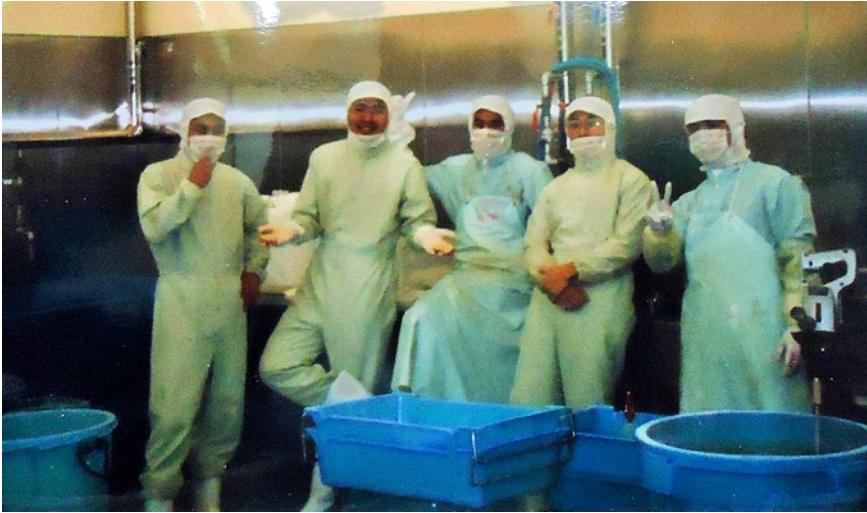
FIGURE 5.3. {to come}

immigrants were still familiar with Japanese culture and self-identified as ethnic Japanese in Brazil.