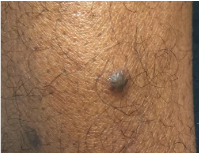
Figure 3. Dermatofibromas in an HIV-infected 60-year-old man. View of one of the patient's dermatofibromas located on the right arm.

of benign fibroblasts in the dermis, with collagen bundles located at the periphery of the lesion [1]. Immunohistochemistry may demonstrate positive staining for factor XIIIa [6]. Solitary dermatofibromas are often located on the lower extremities. The lesions may result from an arthropod assault [1]. Although solitary lesions are a routine finding, greater than five dermatofibromas is uncommon, and greater than fifteen is rare [7].