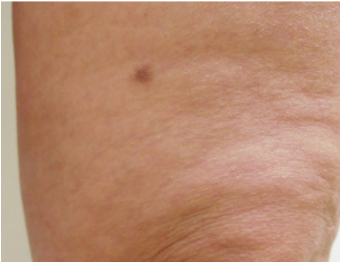
Figure 1. Dermatofibromas in a 48-year-old woman with a past medical history of hypothyroidism, optic neuritis, and Arnold Chiari I malformation. A hyperpigmented dermal nodule is shown on the left medial thigh above the knee.

A diagnosis of multiple dermatofibromas was made based on the morphologic features and positive dimple sign.