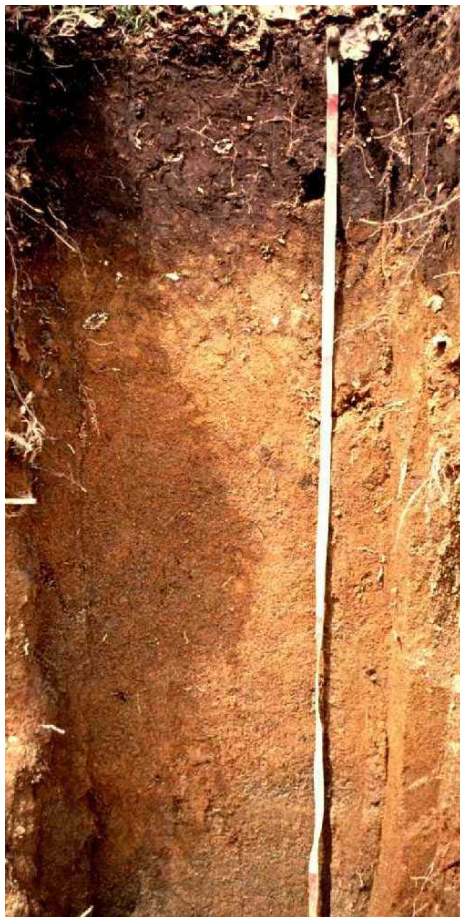
Umbri-Vitric Andosol, Italy