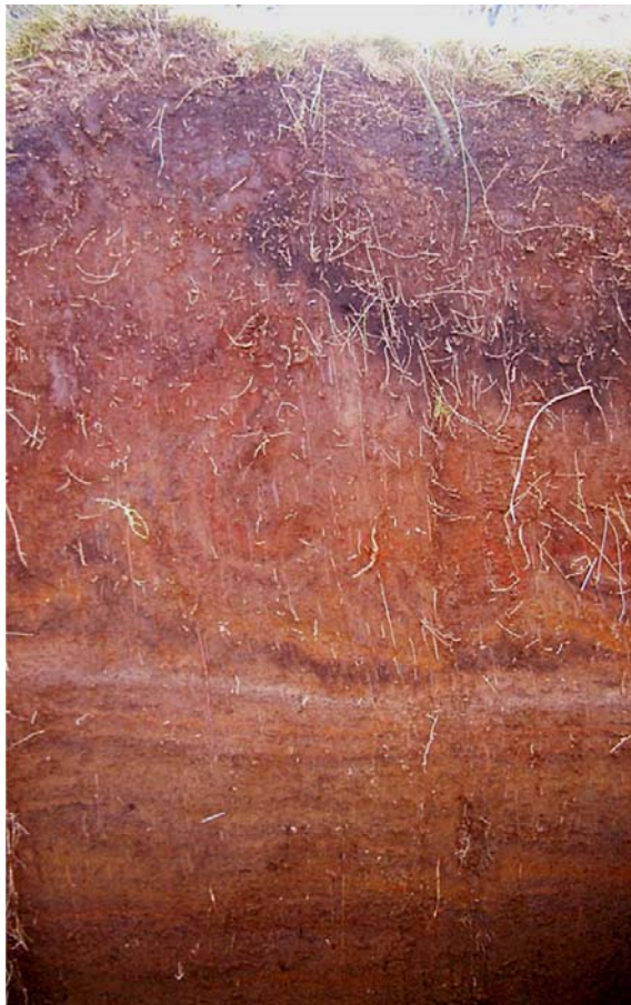
Molli-Silandic Andosol (" Turbic "), Iceland