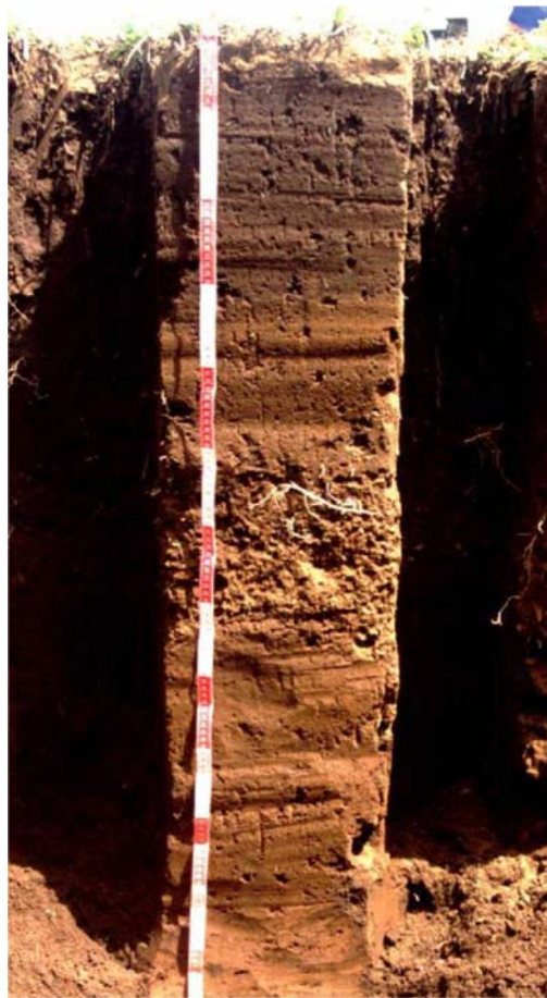
Molli-Silandic Andosol (Calcaric), Nicaragua