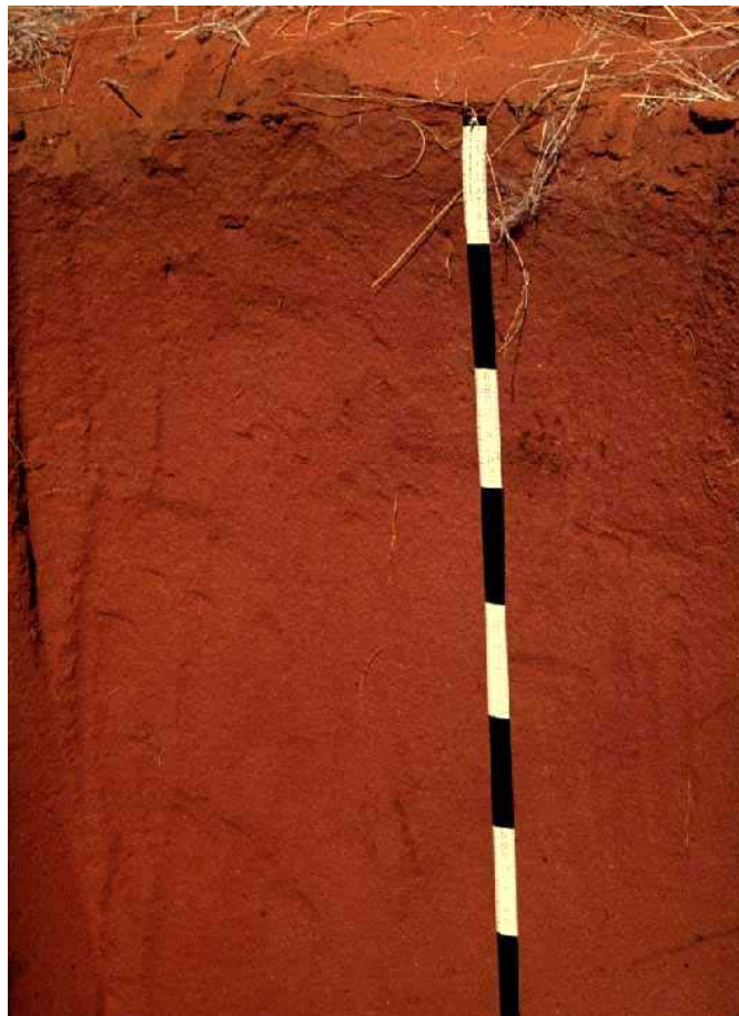
Eutri-Aridic Arenosol (Rubic), Namibia