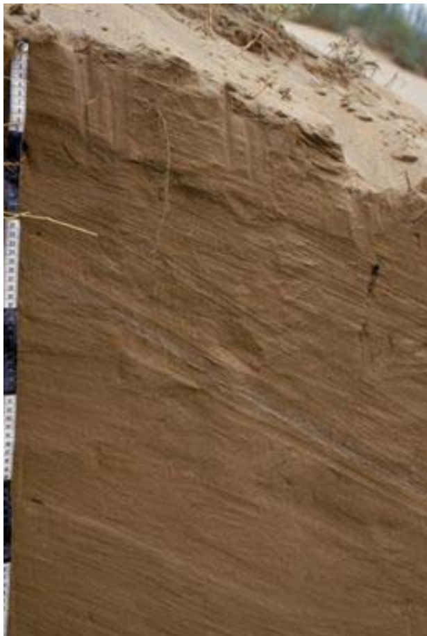
Protic-Aridic Arenosol (Eutric), China