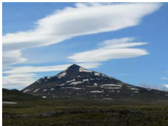
Fig. 3. Sútur.

The Empetrum-Dryas-Vaccinium uliginosum heaths occurring at Akureyri is similar to those of the Mývatn area as regards their contents of lichens with comparatively great abundance of species such as Alectoria ochroleuca and Flavocetraria nivalis . Cetrariella delisei , Cladonia ecemocyna , Pertusaria oculata and Solorina crocea are restricted to Salix herbacea snowbeds and north-facing slopes rich in grasses and sedges. The saxicolous lichen flora on Sútur (Fig. 3) is fairly rich and consists of species such as, for example, Lecanora intricata , L. polytropa , Lecidea lapicida (both varieties), Melanelia hepatizon , Parmelia saxatilis , Pseudephebe minuscula , Sphaerophorus fragilis , Umbilicaria cylindrica ,