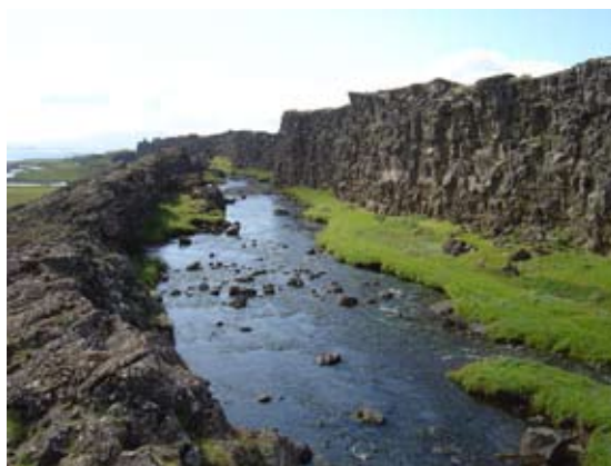
Fig. 2. Thingvellir with the investigated cleft.

A very conspicuous rift valley cuts through the lava and basaltic rocks at the historical locality, Thingvellir (Fig. 2). The lichen vegetation covering the west-exposed, vertical rock faces differs essentially from that occurring on the south (to southeast)-exposed faces in the valley. The first-mentioned is composed of Lecanora polytropa , Placopsis gelida , Rhizocarpon geographicum and other crustaceous lichens. In some places species with a conspicuous white and pale grey thallus such as Ochrolechia parella , O. tartarea , Pertusaria dactylina and P. lactea cover up to 50 % of the rock face, which generally is moist and shady. The east and southeast-exposed faces hold lichens with a distinct preference for nutritious matters. Caloplaca castellana , C. crenularia , Candelariella vitellina , Lecanora argopholis , Placynthium