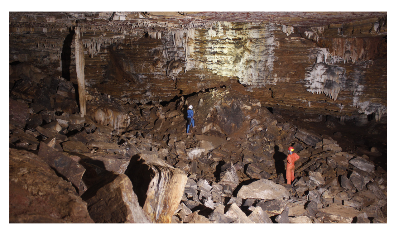
Figure 2: The main chamber of Tchivinguiro Cave, with a column on the left.

many chimneys and narrow sinkholes give access to the subterranean chambers. These chimneys are frequently obscured by thick thorn bushes and the channels are choked by pink-red muds and bedrock debris. Inside the cave, the environment is warm with temperatures ranging 25-28°C, with relative humidity over 90%. The chambers are covered with the boulders of roof spall. Many stalagmites cover the upper surface of these blocks. A few speleothem columns are also present, some exceeding 4 m in height (Figure 2). The underground network surveyed at Tchivinguiro extends for about 1 km but it is likely to be longer, with a few shafts connecting to the outside. The freshwater reservoir emerges at Nandimba spring along the western foothills of the escarpment where it is used to irrigate crops. Crabs and catfish are commonly observed inside the cave pools but the aquatic fauna of Tchivinguiro cannot be regarded as stygobiotic because the pools are connected to surface pools. Areas of suction were detected and indicate pipes and chimneys to other lower bodies of water which suggest that different microenvironments and biota may be present at deeper levels.