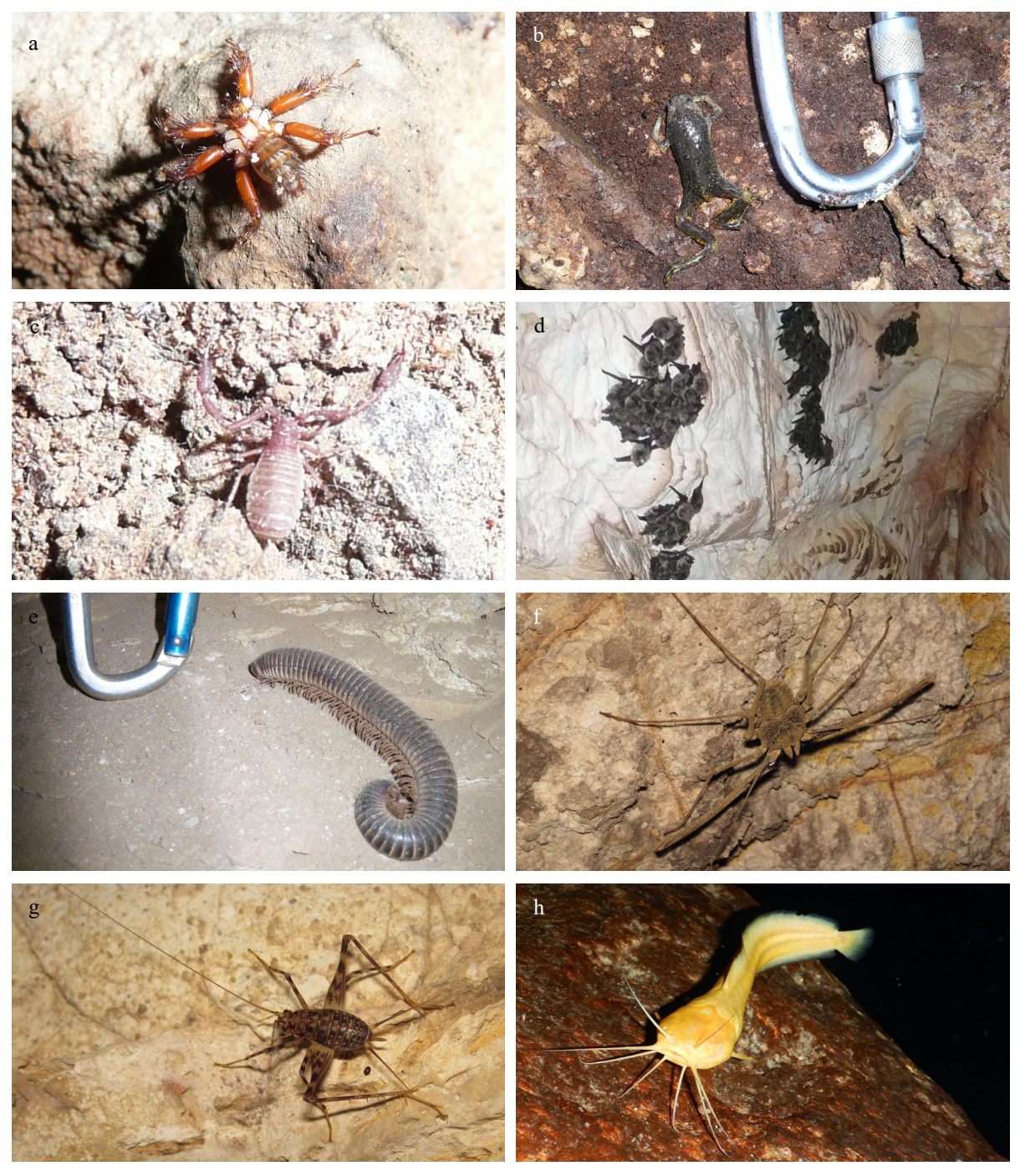
Figure 3: A selection of animals found in caves in Namibia and Angola. a) Nycteribiidae sp., bat fly found near horseshoe bat roosting deep in the caves of Senhora do Monte (photo: Renato Serôdio, 2010); b) Amietia angolensis observed at Algar do Tchivinguiro (photo: Renato Serôdio, 2010); c) Chernetid pseudoscorpions found at the Humpata caves (photo: Renato Serôdio, 2010); d) Groups of horseshoe bats roosting in the pseudo-karst fissures Senhora do Monte (photo: Renato Serôdio, 2010); e) Giant African millipede, Cangalongue Cave (photo: Rui Francisco, 2010); f) Amblypigi at Sumidouro Candimba Cocufima, Tchivinguiro (photo: Rui Francisco, 2010); g) Cricket (Grillidae) at Sumidouro Nandimba Cocufima (photo: Rui Francisco, 2010); h) Clarias cavernicola cave catfish in Aigamas cave, Namibia (photo: Francois Jacobs).

REPTILIA: Testudines, Pelomedusidae: Pelusios spp. (turtles) have been observed in caves near water bodies or associated springs. Colubridae: Boaedon angolensis , the Angolan house snake, has been observed inside and in the vicinity of the caves. Agamidae: Agama planiceps is found in rocky areas and cliffs in the vicinity of caves. Scincidae: