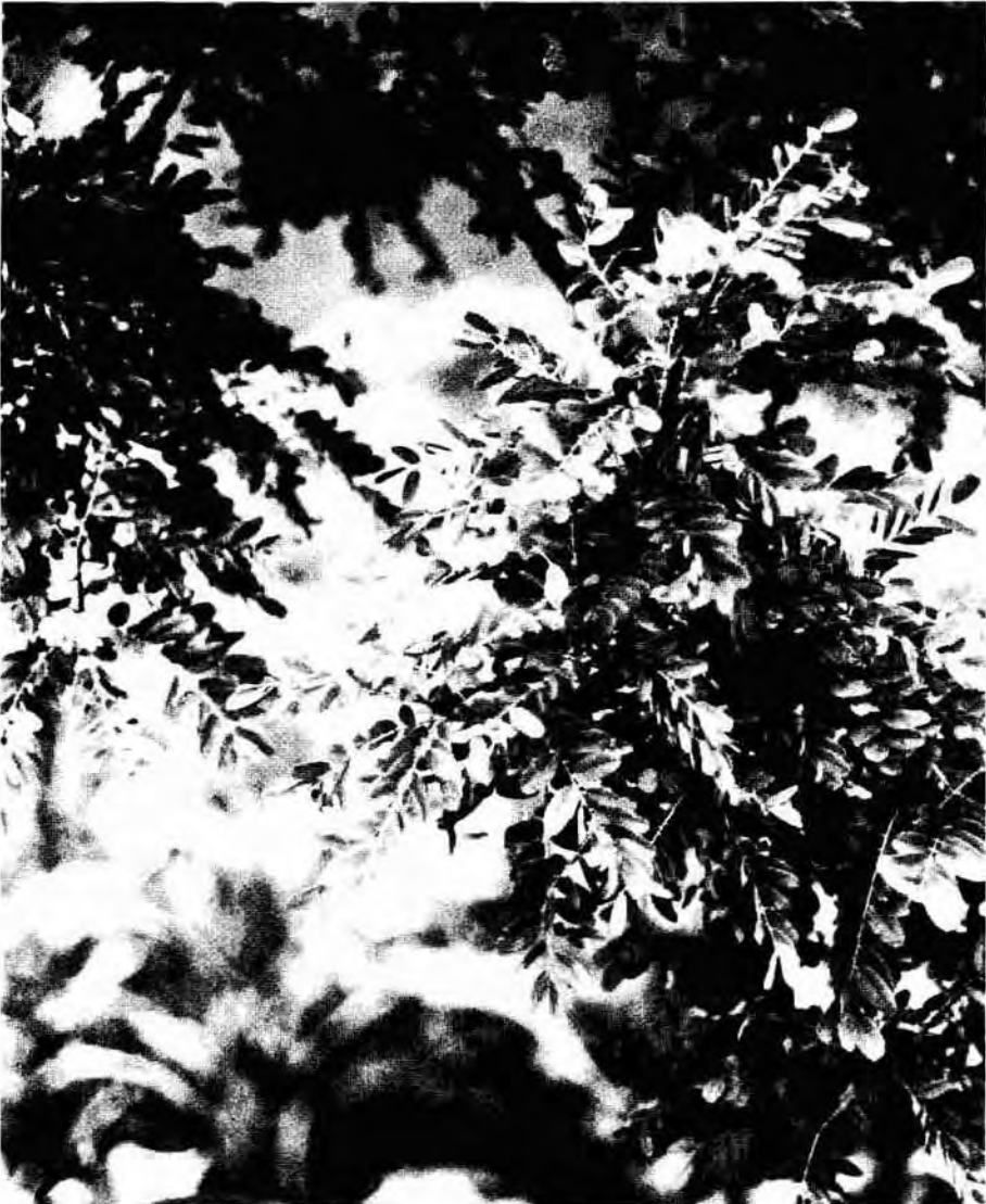
FIGURE 3.— Guachipilin leaves.

Guachipilin trees found in milpas and fallow patches range from 6-10 m in height (Figure 2 and 3). Their branches form an umbrelliform crown. The tree's yellowish, fibrous heartwood is cloaked by 2-3 cm thick grayish-brown bark that is marked by an anastomosing network of deep fissures. Its heartwood yields a yellow dye. Guachipilin's leaflets are borne on 12-14 cm stems in an odd-pinnate arrangement. Stems carry 10-17 small leaflets, 1 - 1.2 X 2.5 - 3 cm, that are oblong, pointed at the base and rounded at the top (Paquet 1981). Guachipilin produces short, up to 2 cm long, clusters of yellow flowers and inflated, flattened, oblong seed pods that are 8-10 cm long (Record and Hess 1943).