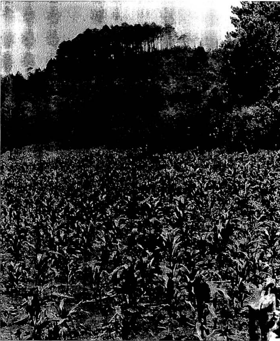
FIGURE 5.— Milpa, guamil , and pine forest cloak a gentle grade in tierra arriba.

The Lenca rotate their arable land through up to three vegetative stages, milpa, guamil , and forest, for periods of varying duration (Figure 5). Traditionally, the duration of each stage depends on factors including slope angle, soil quality, and a family's caloric demand. To determine the timing of guamil or forest clearance the Lenca also consider the mix of plants present. For example, a guamil patch in which frijolillo plants ( Acacia angustissima , Fam. Leguminosae, Subfamily Caesalpinioideae) are dominant is considered suitable for clearance. A guamil patch where blackberries, Rubus are dominant is not yet ready for clearance.