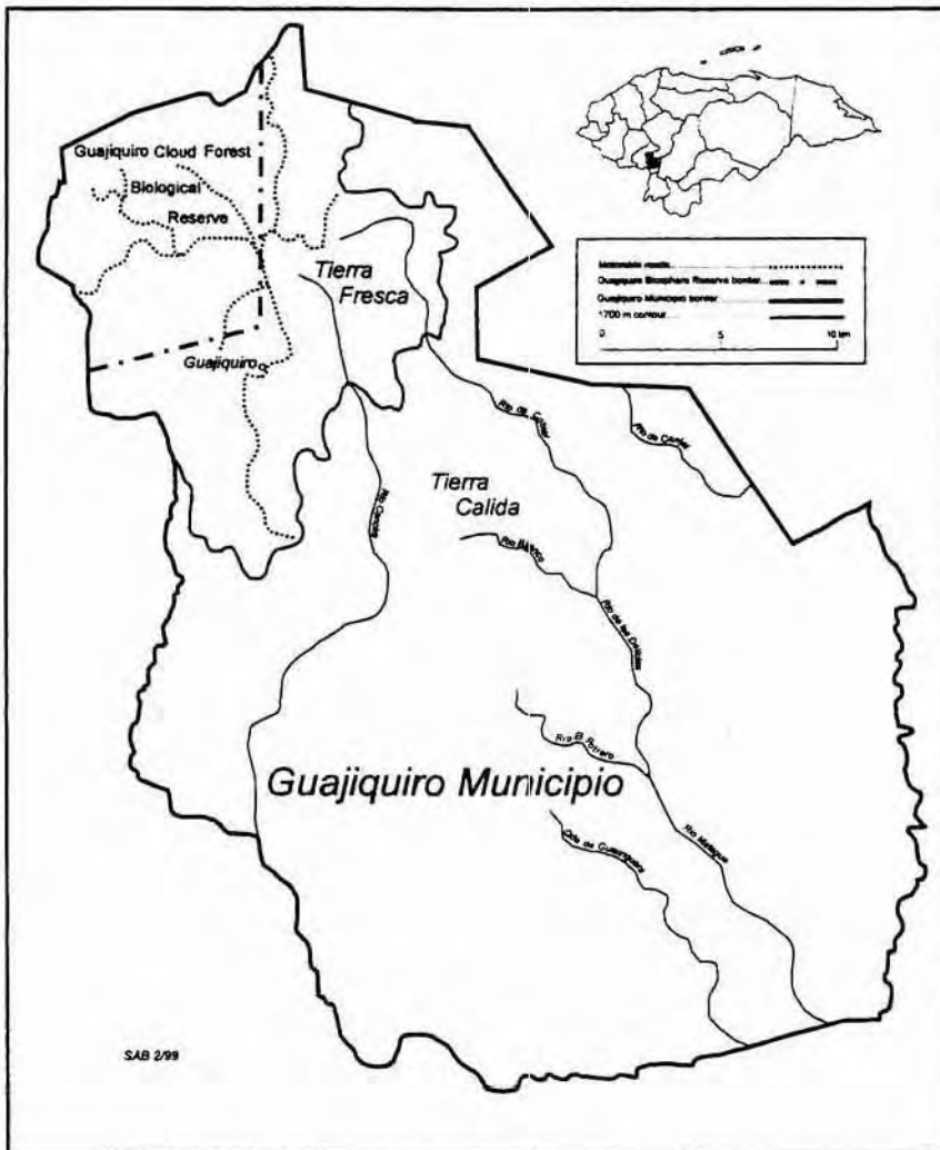
FIGURE 1.— Guajiquiro Municipio, Honduras.

d'argent comptant, la sylviculture commerciale locale, et les remises d'émigrant. La désignation récente presque de 20% du municipio comme réserve biologique de forêt de nuage a engendré des conflits d'utilisation de la terre. La recherche de zone des caractères changeants de l'utilisation de la terre de Lenca a démontré l'ubiquité des arbres dans l'horizontal de règlement de Lenca. Un arbre fabaceus particulier, guachipilin , Diphysa robinoides , Fam. Leguminosae, Subfamily Papilionoideae, est un dispositif en avant d'horizontal. L'arbre atteint trois objectifs pour le Lenca qui se manifestent dans l'horizontal de Lenca. L'intercrop de Lenca l'arbre dans leurs milpas pour l'azote-fixation. Ils la moissonnent pour construire les poteaux faisant le coin pour leurs maisons de bajareque. Le Lenca ouvrent également des crucifixes de guachipilin pour des gravesites parce qu'ils croient que le bois durable est un approprié, et durant, le symbole d'un perdu a aimé son esprit durable.