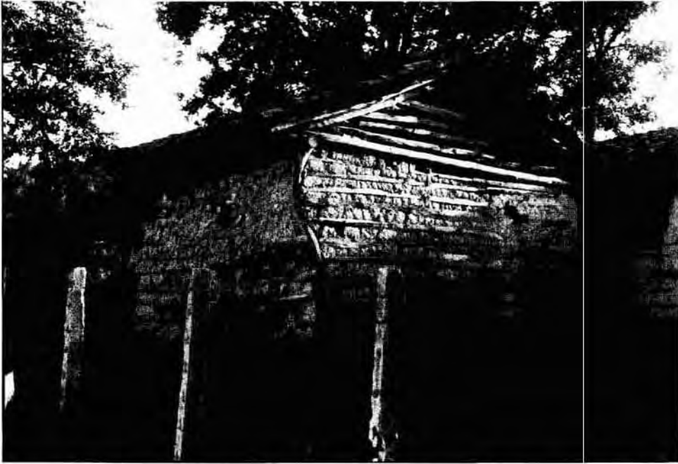
FIGURE 6.— Twisted guachipilin horcones support a bahareque dwelling.

Lenca primarily construct two different types of houses: the indigenous bahareque and white-washed Spanish adobe . Bahareques are the more traditional house type (Figure 6), although the Lenca have adopted Spanish architectural components. Bahareques have wattle and daub walls framed by corner posts, horcones . Prior to the Lenca's adoption of clay tiles and hipped roofs, their bahareques were covered with steep thatch roofs.