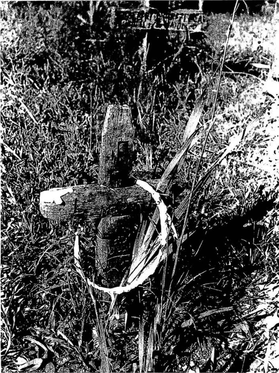
FIGURE 7.— Guachipilin crucifixes in Guajiquiro's cemetery.

edible fruit. Silviculturalists ignore them because they cannot be managed as a forest crop. Honduras' national forestry school omitted guachipilin from its list of one hundred useful tree species (Benitez Ramos and Montesinos Lagos 1988). Should the guachipilin's utility remain unnoticed by outsiders working in Guajiquiro Municipio, the tree will persist in the Lenca landscape because of the interrelated purposes it serves.