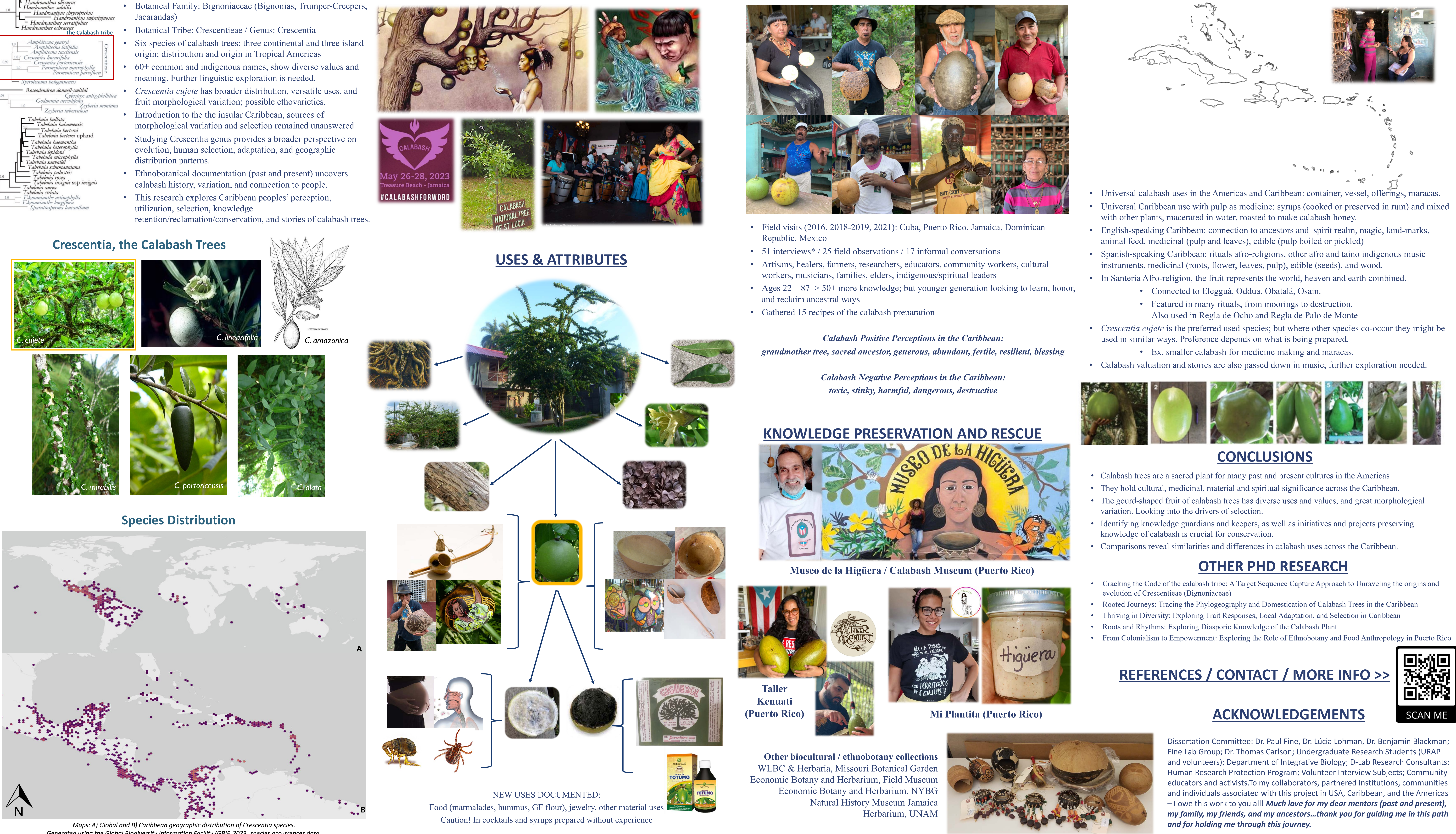
Generated using the Global Biodiversity Information Facility (GBIF, 2023) species occurrences data.