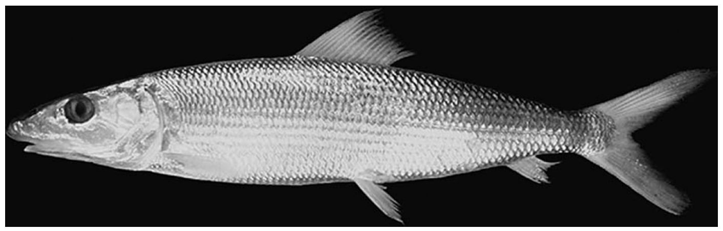
Albula oligolepis, paratype, 230 mm SL. From: Hidaka, K., Y. Iwatsuki and J. E. Randall. 2008. A review of the Indo-Pacific bonefishes of the Albula argentea complex, with a description of a new species. Ichthyological Research 55 (1): 53–64.