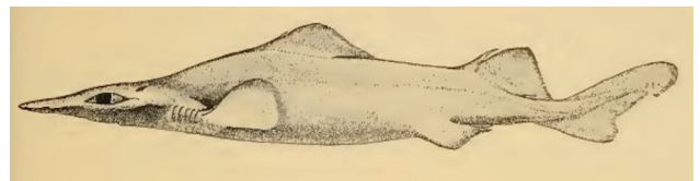
Deania profundorum . From: Smith, H. M. 1912. The squaloid sharks of the Philippine Archipelago, with descriptions of new genera and species. Proceedings of the United States National Museum 41 (1877): 677–685, Pls. 50–54.

Deania quadrispinosa (McCulloch 1915) quadri- , from quattuor (L.), four; spinosa (L.), thorny, referring to four-spined dermal denticles