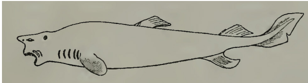
Scymnodon ringens . From: Barbosa du Bocage, J. V. and F. de Brito Capello. 1864. Sur quelques espèces inédites de Squalidae de la tribu Acanthiana, Gray, qui fréquentent les côtes du Portugal. Proceedings of the Zoological Society of London 1864 (pt 2): 260–263.