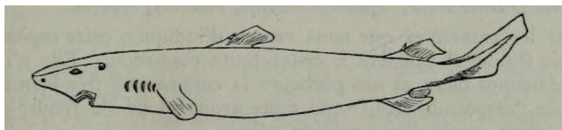
Centroselachus crepidater . From: Barbosa du Bocage, J. V. and F. de Brito Capello. 1864. Sur quelques espèces inédites de Squalidae de la tribu Acanthiana, Gray, qui fréquentent les côtes du Portugal. Proceedings of the Zoological Society of London 1864 (pt 2): 260–263.

scymno- , referring to previous placement in Scymnodon ; dalatias , referring to lack of dorsal spines like most sharks in the family Dalatiidae (sometimes included within Somniosidae)