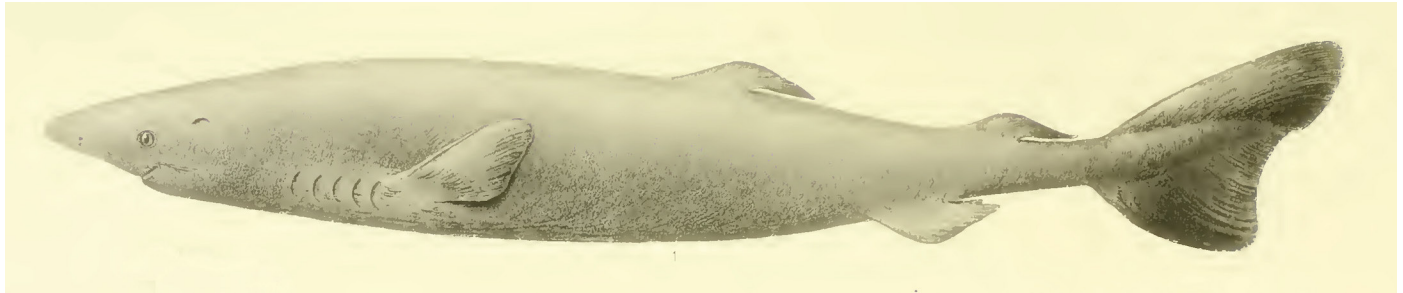
First-published image of Somniosus pacificus , then identified as S. brevipinna (= microcephalus ). From: Garman, S. 1913. The Plagiostomia (sharks, skates, and rays). Memoirs of the Museum of Comparative Zoology 36: i-xiii + 1–515 + Atlas (1–77 pls.).