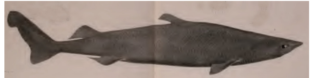
Probably first-published image of Zameus squamulosus . From: Günther, A. 1887. Report on the deep-sea fishes collected by H. M. S. Challenger during the years 1873–76. Report on the Scientific Results of the Voyage of H. M. S. Challenger 22 (57): i–lxv + 1–268, Pls. 1–66.

Zameus squamulosus (Günther 1877) Günther's Neo-Latin for covered or beset with small scales ( squamosus in classical Latin), "so minute as to give a velvety appearance to the skin"