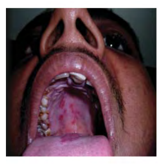
Fig. 2: Erythmatous lesions over the posterior part of the hard palate.

(Fig.3 & Fig.4) Capsule Canditral (Itraconazole 100 mg) once daily for 15 days with topical application of lotion Candid —B (Clotrimazole 1%, Beclomethasone dipropionate 0.025%) for 15 days was prescribed. The patient was advised to maintain proper oral hygiene. After two week follow up patient got relive in symptoms.