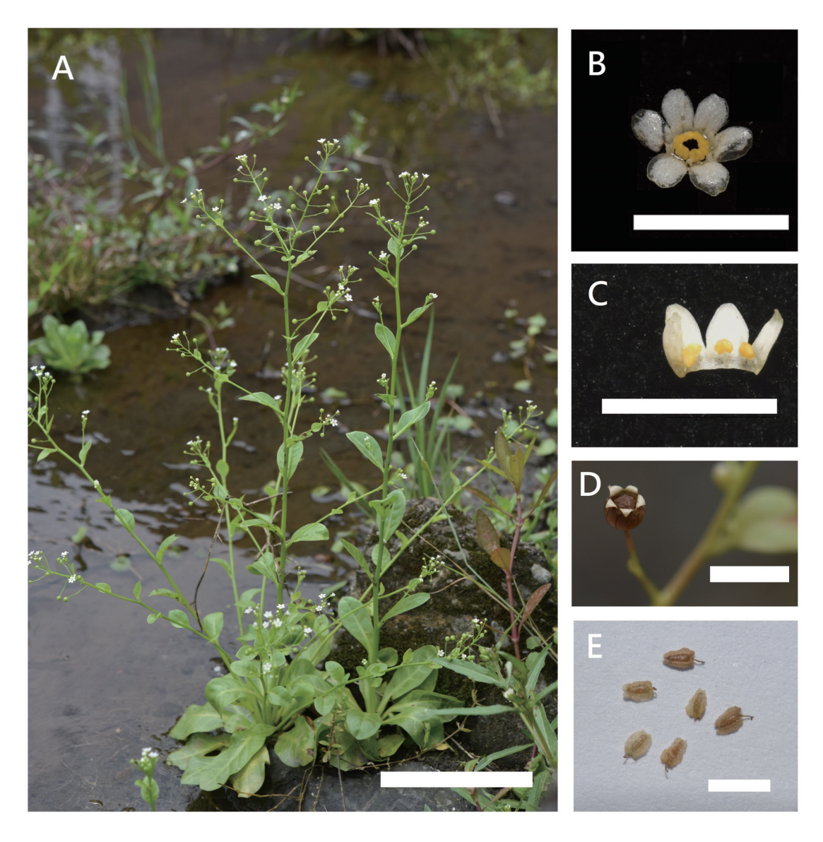
Figure 2. Samolus valerandi L. A. habitat B. flower C. corolla D. mature capsule E. seeds. Scale bars: 10 cm in A, 5 mm in B–D, 1 mm in E.

10–22-flowered, terminate or axillary, 6–22 cm long; pedicel 3–11 mm long, with a 1.5–2.5 mm long bract on it. Calyx campanulate, 1–2 mm long, with shallow lobes. Corolla white, 5–6 oblong lobes, each lobe 1.5 mm long and 1 mm wide; tube short, 1/3 long of the lobe. Capsule globose, 2–3 mm, split into 5 teeth on top in mature. Seeds