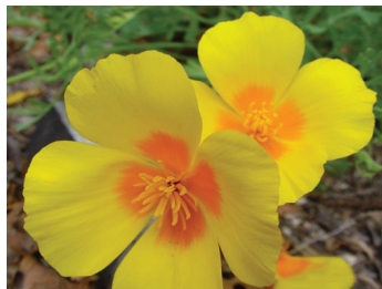
Mexican Gold Poppy

found in the Sonoran desert. The Mexican gold poppy is more yellow in color and is two toned with the center being a darker orange and has no rim or an inconspicuous rim under the flower. California poppies are more orange and are more uniform color and have a prominent ring or rim underneath the flower.