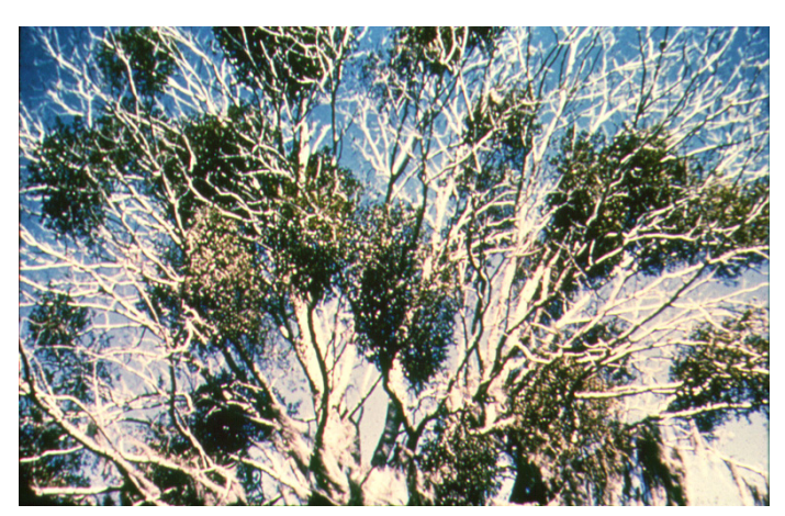
Multiple infections of true mistletoe.

Control of true mistletoe depends on physical removal of the aerial shoots from the host plant by pruning infected branches or by periodic removal of the shoots. Breaking