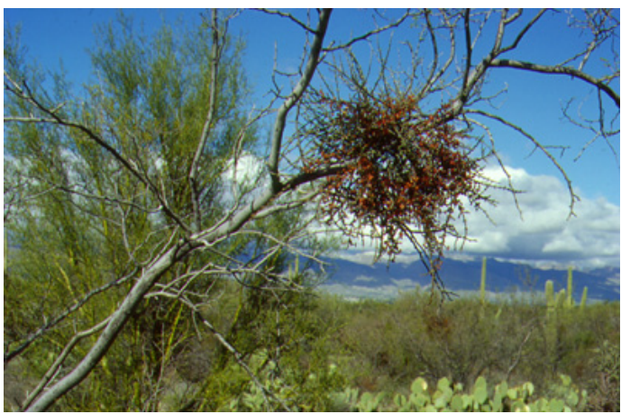
True mistletoe aerial shoots with berries.