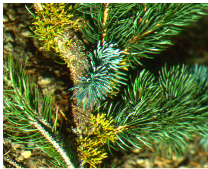
Leafless aerial shoots of dwarf mistletoe on spruce.