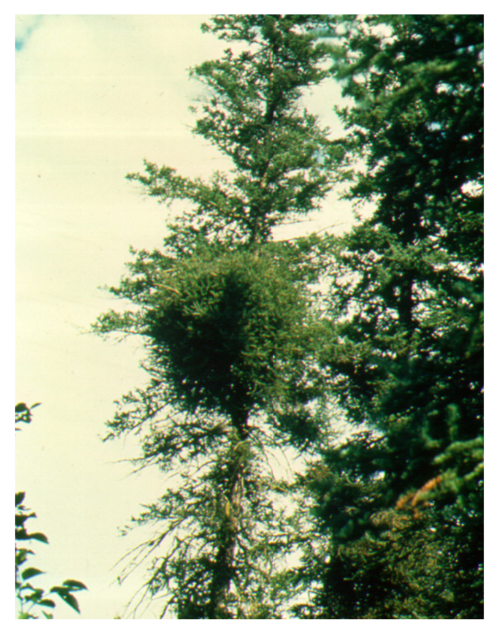
Multiple infections of true mistletoe.

For removal in lightly infested trees, infected limbs should be pruned at the nearest crotch. Heavily infested trees should be removed and replaced with trees that are not hosts. Completely removing dwarf mistletoe from a stand of trees results in control for many years since new introductions will spread very slowly. Lightly to moderately infested mature trees in which less than 50% of the limbs are infected may survive for decades. However, it is important not to plant susceptible trees under infected trees.