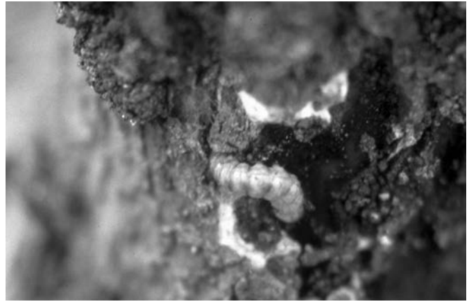
Figure 5. Larva of dogwood borer.

For large acreages, well-timed insecticide sprays during the season will provide the most effective control. Growers should place sex pheromone traps in the trees by petal fall, and keep a weekly record of the adult flight periods. If there