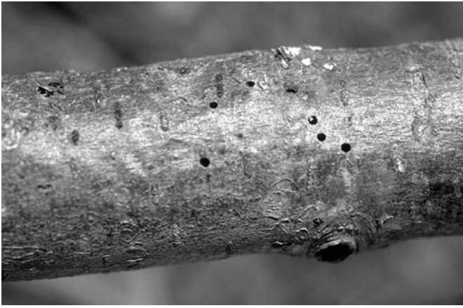
Figure 3. Emergence, or exit, holes of adult shothole borers.

distances. There are usually two or more generations each year.