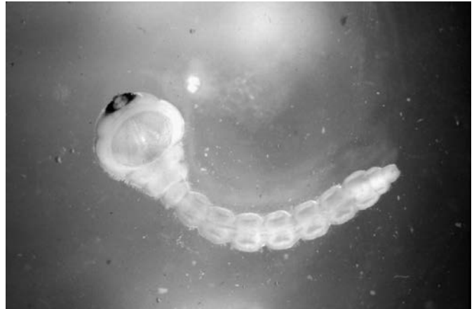
Figure 1. Larva of a flatheaded appletree borer.

Adults typically begin emerging in May and egg-laying can continue from June to September. Hence, larvae of varying sizes may be found throughout the summer. Adults are sun-loving insects and can be found in greatest numbers on the sunny sides of trees or logs. Eggs typically are deposited under bark scales or in bark crevices on the south and west sides of the main trunk and larger branches.