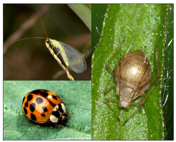
Figure 4. Some natural enemies of large raspberry aphid. Clockwise, from top left: green lacewing; aphid mummy, parasitized by Aphidius; Asian lady beetle.

Systemic insecticides may provide long-lasting control of aphids while also limiting the spread of the most common Rubus viruses. Virus spread among fields occurs during peak flights, so control is especially important during these times. For current recommendations, consult the Pacific Northwest Insect Management Handbook (http:// uspest.org/pnw/insects) or contact your local Extension