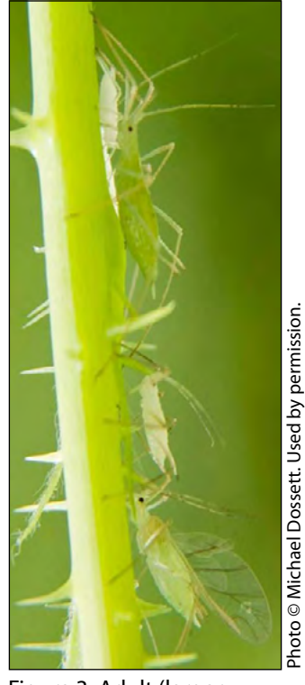
Figure 3. Adult (larger, green; near top) and nymphs (smaller, light green) of the large raspberry aphid.