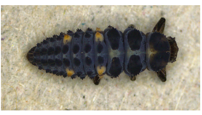
Figure 14. Parenthesis lady beetle larve.