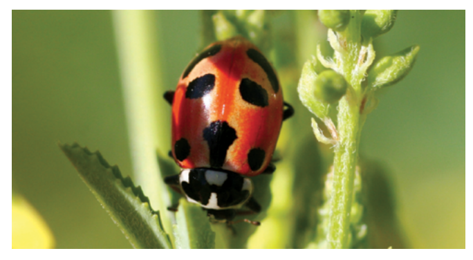
Figure 13. Adult parenthesis lady beetle with pronounced parenthesis shape on back of each wing.