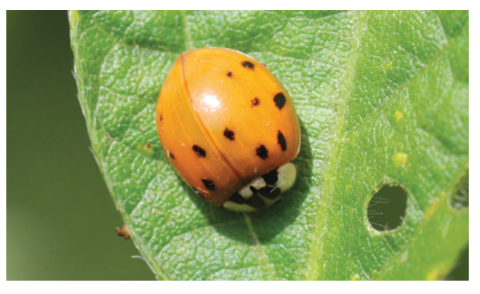
Figure 4. The adult stage of the lady beetle.

The final and fourth stage of the lady beetle is its adult form (Figure 4). The adults are the most commonly recognized life stage. Most lady beetles overwinter as adults. For example, the multicolored Asian lady beetle (Figure 5), can be a nuisance as they prefer to overwinter within buildings in large groups, while most other species overwinter near the soil surface in leaf litter and other plant debris. During spring, lady beetles will emerge in correlation with increased day length<sup>11</sup>.