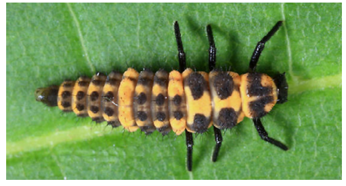
Figure 12. Spotted lady beetle larva.