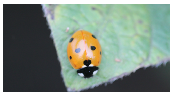
Figure 9. Adult sevenspotted lady beetle with seven total spots on wings and white spots on each side of pronotum.