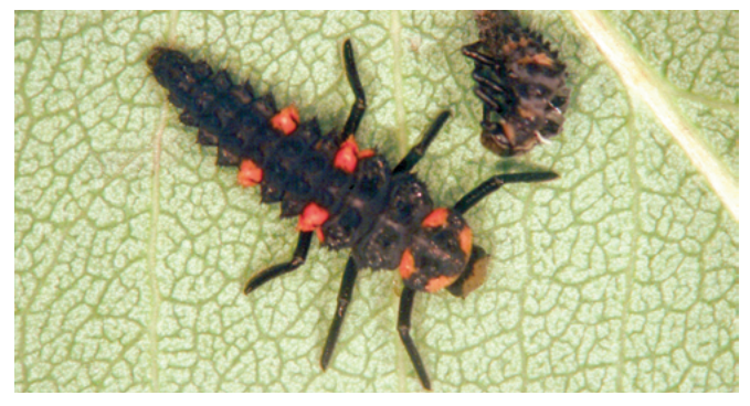
Figure 20. Transverse lady beetle larva.