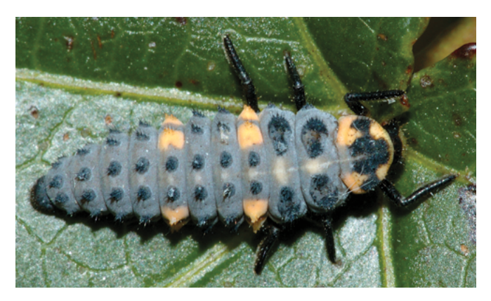
Figure 8. Convergent lady beetle larva.