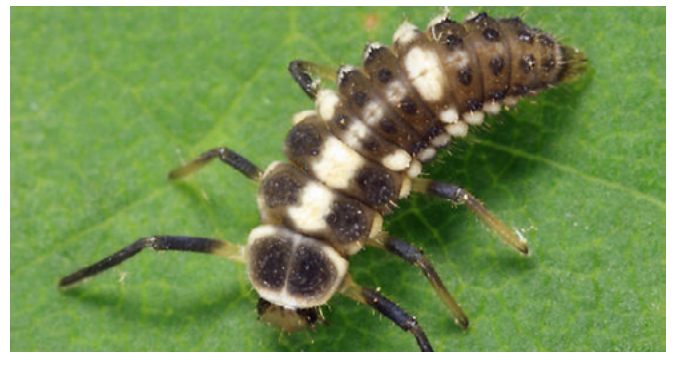
Figure 16. Black, polished lady beetle larva with white markings throughout.