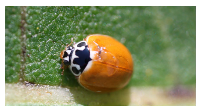
Figure 15. Adult polished lady beetle with no spots present on elytra and white "W or M" on black pronotum.