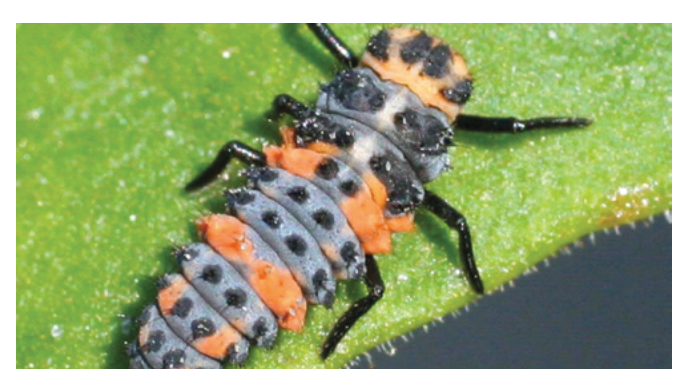
Figure 10. Sevenspotted lady beetle larva.