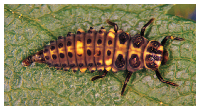
Figure 18. Two-spotted lady beetle larva.