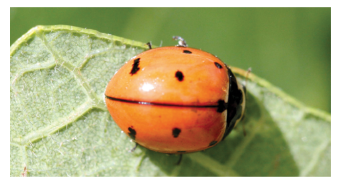
Figure 21. Adult nine-spotted lady beetle with nine, black spots covering its elytra.