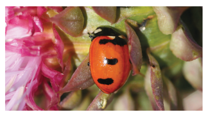
Figure 19. Adult transverse lady beetle with long, black line that transverses across both elytra.