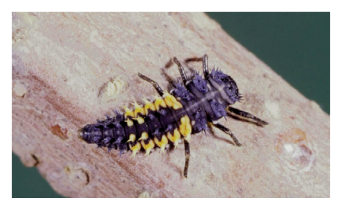
Figure 6. Asian lady beetle larva with prominent, orange spikes on its back.