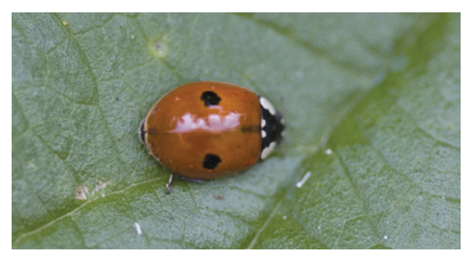
Figure 17. Adult two-spotted lady beetle with two, black spots across its elytra.