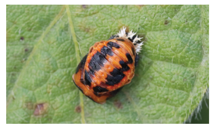
Figure 3. The pupal stage of the lady beetle.

The third life stage of the lady beetle is its pupal form (Figure 3). This stage is stationary, with the pupa typically being attached to plant surfaces, near pest populations. During the pupal stage, the lady beetle will undergo transformation into an adult beetle. The pupa is often orange with black markings. When the adult is fully formed within the pupal casing, it will emerge, leaving the empty pupal case behind, still attached to the plant surface.