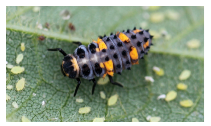
Figure 2. The 4th instar of the lady beetle larval stage.

The second life stage of the lady beetle is its larval form (Figure 2). This stage is broken into multiple instars<sup>e</sup> where the larva continues to grow and increase in size over time. The size for each instar progression is dependent on the species. Also, the color and patterns that are present on the larva are species dependent. Most agriculturally important species in South Dakota are black or grey with orange and/or yellow spots. Lady beetle larvae have been found to consume more prey than the adults<sup>10</sup>.