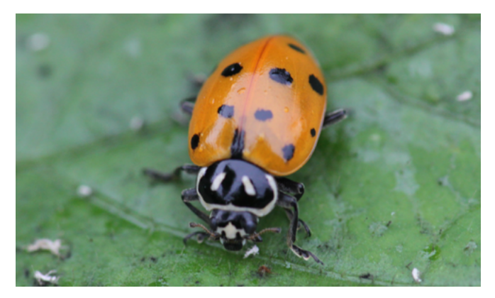
Figure 7. Adult convergent lady beetle with 13 total spots on wings and two white, converging lines on pronotum.