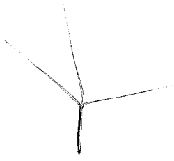
Red threeawn floret with awns. Actual length of seed and upright awn is 1¾ inches.