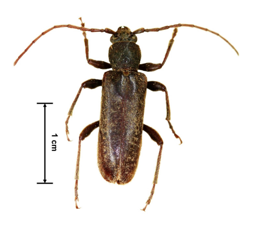
Figure 1. Trichoferus campestris (Faldermann).

Interestingly, four Chinese longhorned beetles, Trichoferus campestris (Faldermann) (Fig. 1; Coleoptera: Cerambycidae) were found at traps placed in an industrial area in Salt Lake County (Table 2; Fig. 2). This species is included on the CAPS Priority Pest List. However, a visual survey is advised for T. campestris , and its presence in our funnel traps was unexpected. The identity of these specimens was confirmed by both James LaBonte and by USDA-APHIS-PPQ in Riverdale, MD.