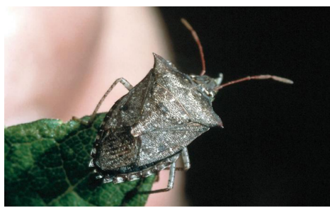
Fig. 2 The spined

destructive and invasive brown marmorated stink bug ( Halyomorpha halys ). Similarly, the six-spotted tiger beetle ( Cicindela sexguttata ) is a predatory ground beetle (Fig. 3) that can be misidentified by some as the invasive Japanese beetle ( Popillia japonica ).