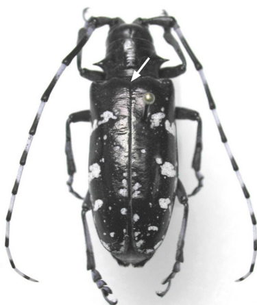
Fig. 18 Adults are large (3/4 – 1 1/2-inches long) conspicuous beetles that have a glossy-smooth black body with irregular white spots, and a black scutellum (the region between the tops of the wings - note white arrow in figure).