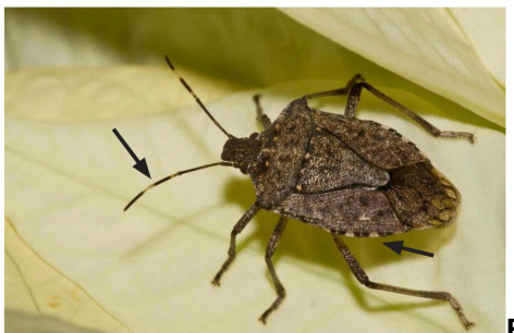
Fig. 4 BMSB

adults are shield-shaped, 5/8-inch long, mottled brown, and have alternating dark and light bands on their antennae and along their abdominal edges (arrows in figure point to some of these features). The term "marmorated" means having a veined or streaked-like marble appearance.