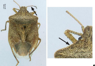
Fig. 8 Brown stink

Common Brown Stink Bugs (Euschistus spp.) (Fig. 8) are pests of fruit, seeds, grains, and nut crops. They are very common in Utah, and can be easily mistaken for BMSB.