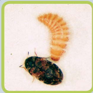
Above Right: Figure 5. Warehouse beetle larva and adult.