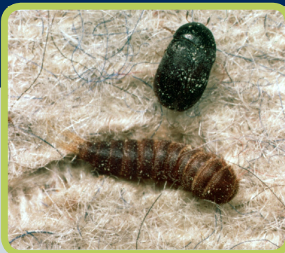
Above Left: Figure 4. Black carpet beetle larva and adult.