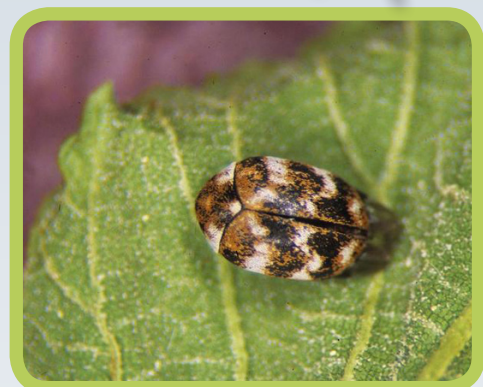
Above: Figure 1. Adult varied carpet beetle.