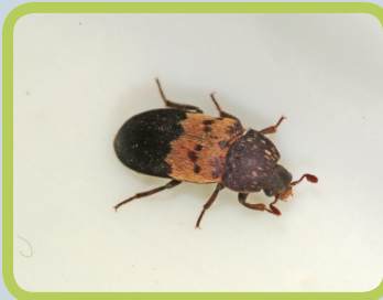
Left: Figure 6. Larder beetle adult.