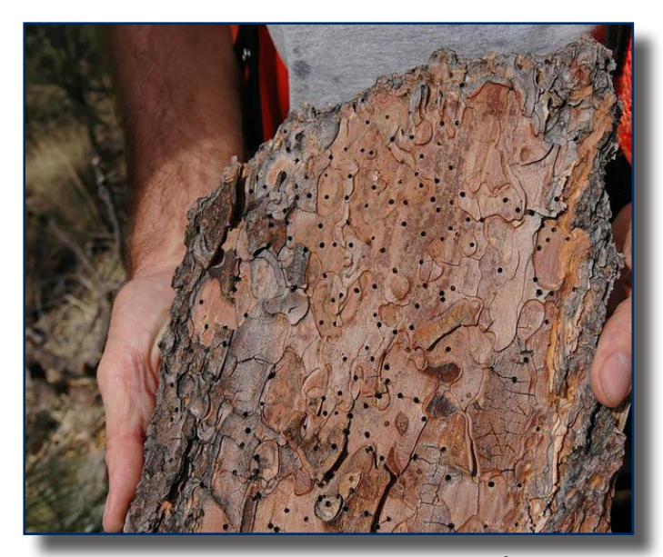
Fig. 9. Exit holes created from emerging adult bark beetles<sup>8</sup>.