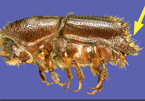
Figs. 12.-14. (Left) lps bark beetle have obvious spines on the rear of their outer wings and a (Center) concave depression <sup>11-12</sup>. lps galleries can be identified by a central nuptual chamber (Right) with parental galleries radiating outward giving an "octopus" shape <sup>13</sup>.

Ips beetles are the most commonly encountered bark beetles in landscape pines. Adult beetles (top left and right) have spines along their outer wings. Ips galleries resemble the shape of an octopus but with fewer arms. There is a center chamber giving rise to multiple parental galleries where eggs are laid. Upon hatching, larvae radiate outward from the parental gallery. Larval galleries become progressively wider as the larvae grow, terminating in a circular to oval pupal chamber. Ideally, adults and immature beetles will be present in your sample, indicating they are still in the tree. If empty galleries and pupal chambers are present then it is likely the beetles have emerged to attack another host.