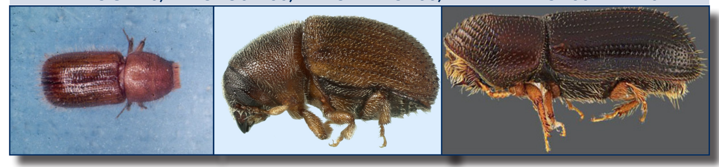
Figs. 21-23. (Left) Adult western balsam bark beetle<sup>15</sup>. (Middle) Adult Phloeosinus beetle<sup>18</sup>. (Right) Adult walnut twig beetle<sup>19</sup>.

The beetles in Figures 24 - 27 are mostly minor pests in Utah. The western balsam bark beetle mostly attack diseased or stressed fir trees at high elevations, but could affect white and other ornamental firs in the landscape. All records of Phloeosinus beetles in Utah are from ornamental Arizona cypress trees in Washington County.