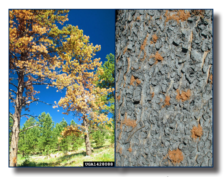
Figs. 4-5. (Left) Fading crown of bark beetle infested trees<sup>2</sup>. (Right) Frass, or sawdust-like material on the trunk is in indication of bark beetle infestation<sup>4</sup>.