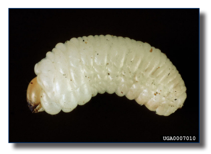
Fig. 12. Bark beetle larvae are legless white grubs with a brown head capsule 10.

enter the outer bark layers in later larval stages. If the condition of the phloem layer (soft, white, thin layer between the bark and wood layers) is brown to black, or completely dried-up, then the tree may be dead. Check the rest of the circumference of the tree for live phloem. If no living phloem is found, the tree should be removed and treated to kill the beetles; see the "Sanitation" section for techniques.