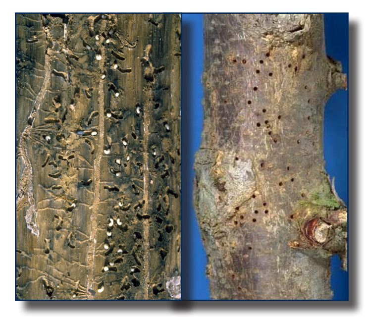
Figs. 10-11. (Left) Bark beetle parental and larval galleries; larvae can be seen in newly constructed pupal chambers where they will transform into adults<sup>9</sup>. (Right) Shotgun pattern of exit holes from shothole borers<sup>6</sup>.