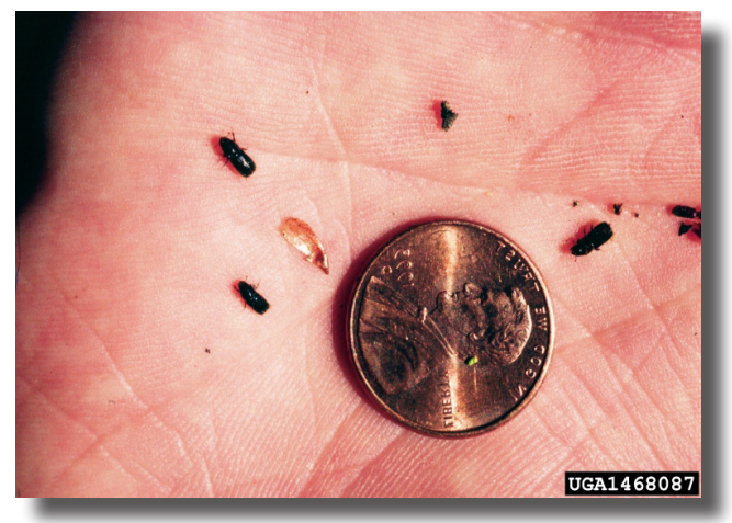
Fig. 1. Average size of an adult bark beetle compared to a penny 1.

Bark beetles are one of the most destructive forest pests in the world. They are different than the larger longhorned and roundheaded/metallic woodboring beetles commonly infesting the inner wood of trees. The largest bark beetle, the red turpentine beetle (Dendroctonus valens), reaches only 8.3 mm in length. Because of their tiny size (Fig. 1), bark beetles are not effective tree killers as individuals. Instead, primary bark beetles work together, sending pioneer beetles to search for stressed or dying trees. When pioneer beetles find a weakened tree, they bore into and feed