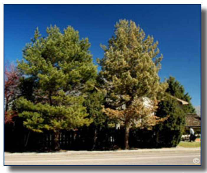
Fig. 3. Recently infested trees may not show obvious signs of fading<sup>3</sup>.

Look for signs of current or past beetle infestations such as galleries (Fig. 10), eggs, larvae (Fig. 12), pupae, and adult beetles. If galleries and larvae are present, this indicates a current attack. If the galleries are empty and no larvae, pupae or adult beetles are present, then the infestation is likely old. Note that some beetles, such as the western pine beetle, will