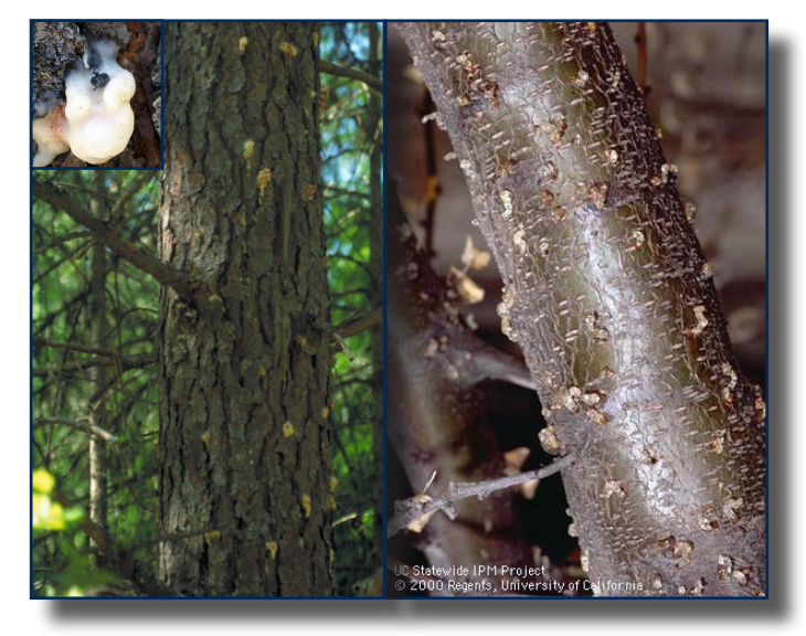
Figs. 6-8. (Left and Right) Pitch tubes are defensive chemical compounds exuded from the tree that may indicate bark beetle attack<sup>5,6</sup>. (Upper left corner) Bark beetle caught by a tree's defensive resin<sup>7</sup>.