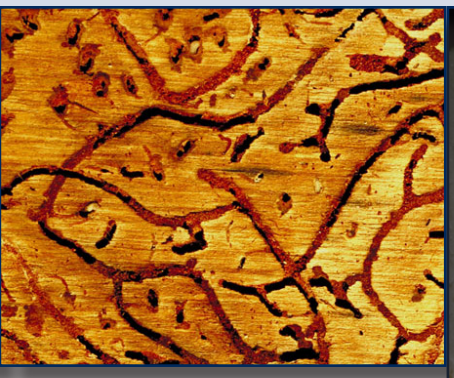
Figs. 15.-17. (Left) Adult mountain pine is similar in appearance to other Dendroctonus bark beetles<sup>14</sup>. Dendroctonus beetle galleries vary from spaghetti-plate patterns of parental and larval galleries (Center) to long and straight parental galleries with outward radiating larval galleries (Right)<sup>8-15</sup>.

Bark beetles in the genus Dendroctonus are some of the most devastating forest insect pests in the world. The most notable species in the west is the mountain pine beetle (MPB), responsible for the destruction of millions of acres of timber every year. Mountain pine beetle less frequently attacks pine trees in the non-forested urban landscape. MPB galleies are recognized as long, straight, vertical galleries with a "j" crook at the bottom. The galleries usually extend from 1 to 3 feet up the tree. Other Dendroctonus species affect a narrower range of host trees. These will be most commonly seen in high elevation lodgepole and spruce forests in Utah.