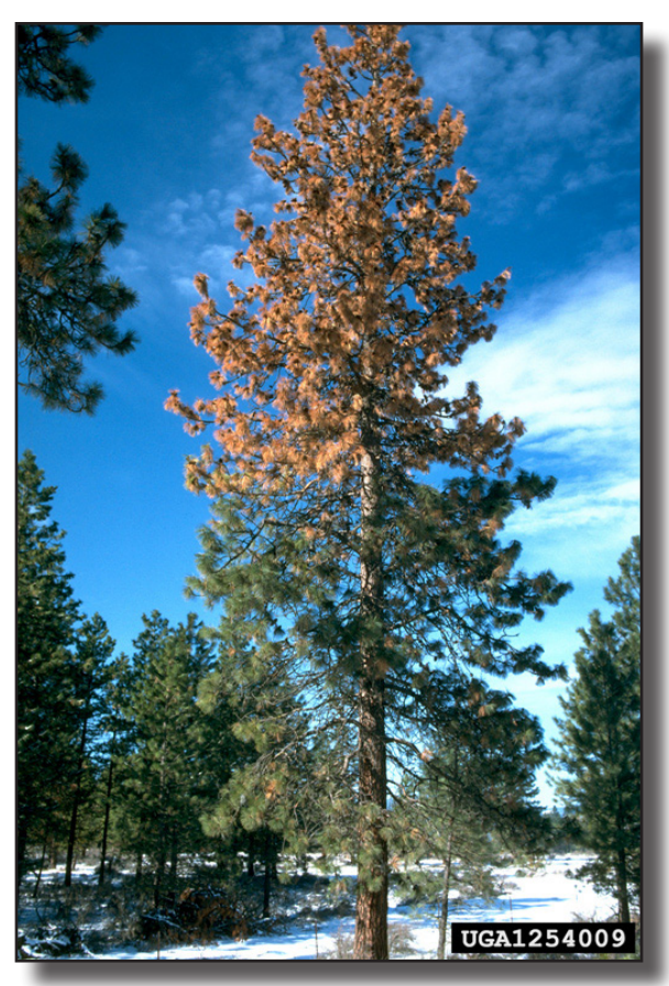
Fig. 2. Typical top-down dieback pattern on pines infested by Ips beetles<sup>2</sup>.

on the thin phloem layer just under the bark. As they feed, chemicals from their food are converted into attractive chemicals, signaling to other beetles of the same species that a suitable host was found.