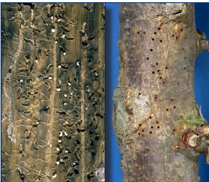
Figs. 10-11. (Left) Bark beetle parental and larval galleries; larvae can be seen in newly constructed pupal chambers where they will transform into adults 9 . (Right) Shotgun pattern of exit holes from shothole borers 6 .