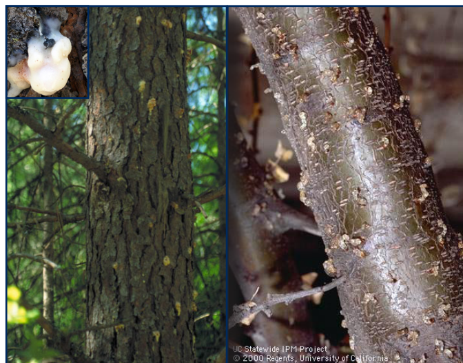
Figs. 6-8. (Left and Right) Pitch tubes are defensive chemical compounds exuded from the tree that may indicate bark beetle attack 5,6 . (Upper left corner) Bark beetle caught by a tree's defensive resin 7 .