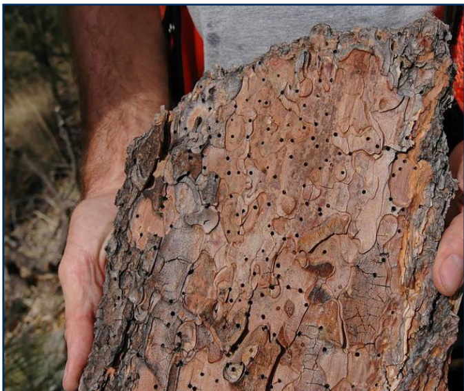
Fig. 9. Exit holes created from emerging adult bark beetles 8 .