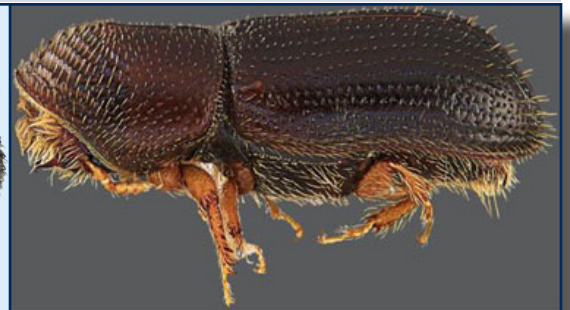
Figs. 21-23. (Left) Adult western balsam bark beetle 15 . (Middle) Adult Phloeosinus beetle 18 . (Right) Adult walnut twig beetle 19 .

The beetles in Figures 24 - 27 are mostly minor pests in Utah. The western balsam bark beetle mostly attack diseased or stressed fir trees at high elevations, but could affect white and other ornamental firs in the landscape. All records of Phloeosinus beetles in Utah are from ornamental Arizona cypress trees in Washington County.