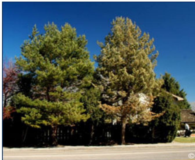
Fig. 3. Recently infested trees may not show obvious signs of fading 3 .

Look for signs of current or past beetle infestations such as galleries (Fig. 10), eggs, larvae (Fig. 12), pupae, and adult beetles. If galleries and larvae are present, this indicates a current attack. If the galleries are empty and no larvae, pupae or adult beetles are present, then the infestation is likely old. Note that some beetles, such as the western pine beetle, will