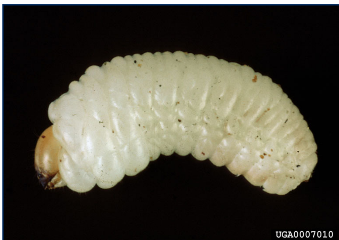
Fig. 12. Bark beetle larvae are legless white grubs with a brown head capsule 10 .

enter the outer bark layers in later larval stages. If the condition of the phloem layer (soft, white, thin layer between the bark and wood layers) is brown to black, or completely dried-up, then the tree may be dead. Check the rest of the circumference of the tree for live phloem. If no living phloem is found, the tree should be removed and treated to kill the beetles; see the "Sanitation" section for techniques.