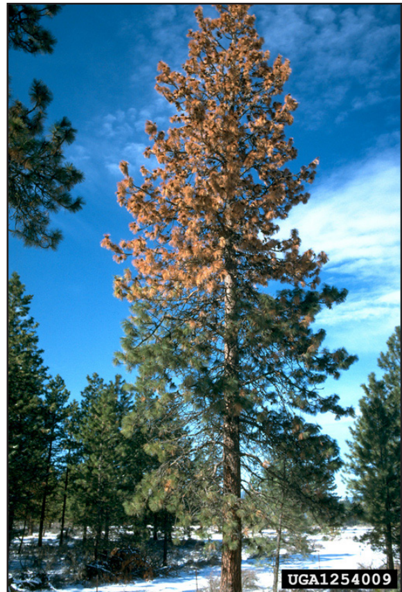
Fig. 2. Typical top-down dieback pattern on pines infested by Ips beetles 2 .

on the thin phloem layer just under the bark. As they feed, chemicals from their food are converted into attractive chemicals, signaling to other beetles of the same species that a suitable host was found.