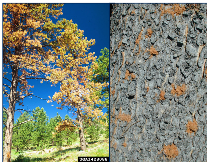
Figs. 4-5. (Left) Fading crown of bark beetle infested trees 2 . (Right) Frass, or sawdust-like material on the trunk is in indication of bark beetle infestation 4 .