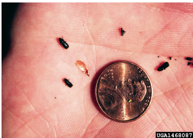
Fig. 1. Average size of an adult bark beetle compared to a penny 1 .

Bark beetles are one of the most destructive forest pests in the world. They are different than the larger longhorned and roundheaded/metallic woodboring beetles commonly infesting the inner wood of trees. The largest bark beetle, the red turpentine beetle ( Dendroctonus valens ), reaches only 8.3 mm in length. Because of their tiny size (Fig. 1), bark beetles are not effective tree killers as individuals. Instead, primary bark beetles work together, sending pioneer beetles to search for stressed or dying trees. When pioneer beetles find a weakened tree, they bore into and feed