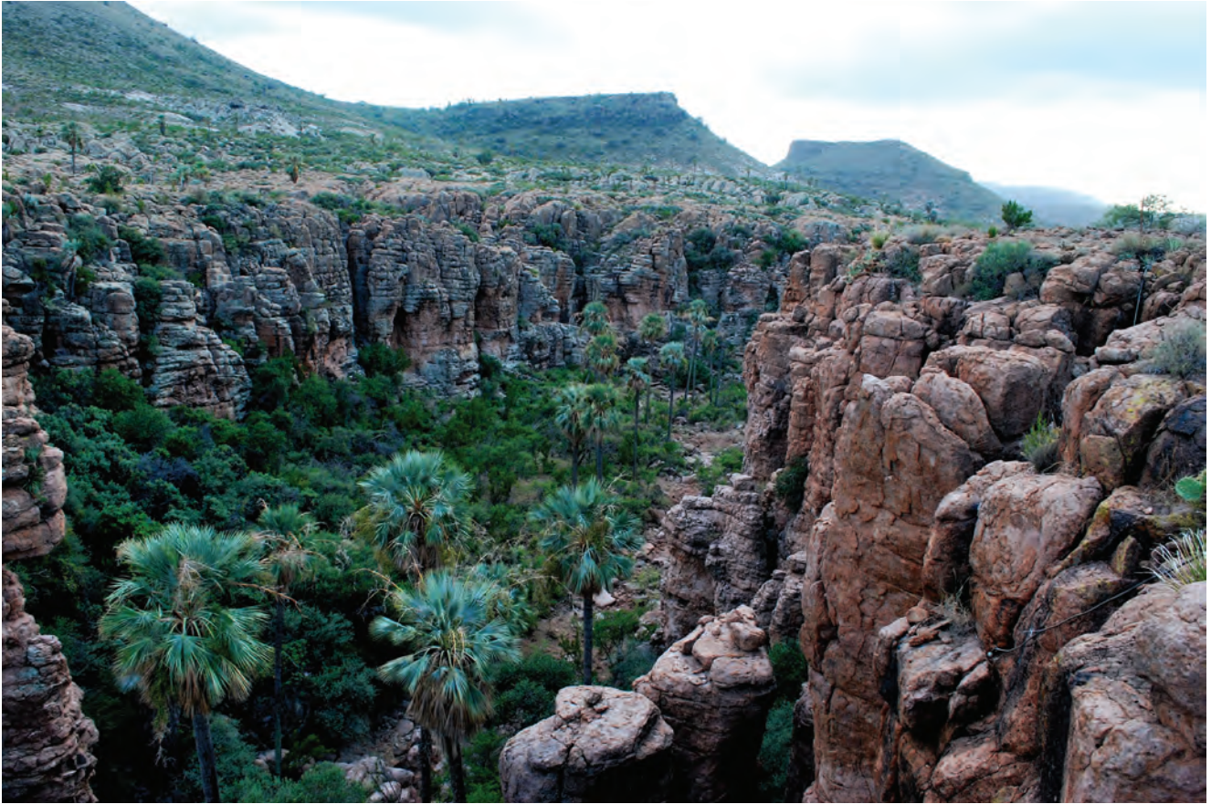
Figure 8. Community of oaks, Celtis pallida , Dodonaea viscosa , and Prosopis articulata , around blue fan palm population in El Rodeo canyon and adjacent areas located up in the mesas.

specimen collections, these expeditions identified particular and unknown plant communities associated with blue fan palm populations, the dominant vegetation of desert oases at these latitudes. Thus, orchids, ferns, and climbing vines growing with palms close to water holes form a different type of tropical forest; small-sized palms growing within a matrix of diverse species of grasses that sway in the breeze of the high mesas; and the ocotillos interspersed with the palms covering the rocky landscape of whitish volcanic tuffs are some of the most noteworthy and unique communities registered in the area.