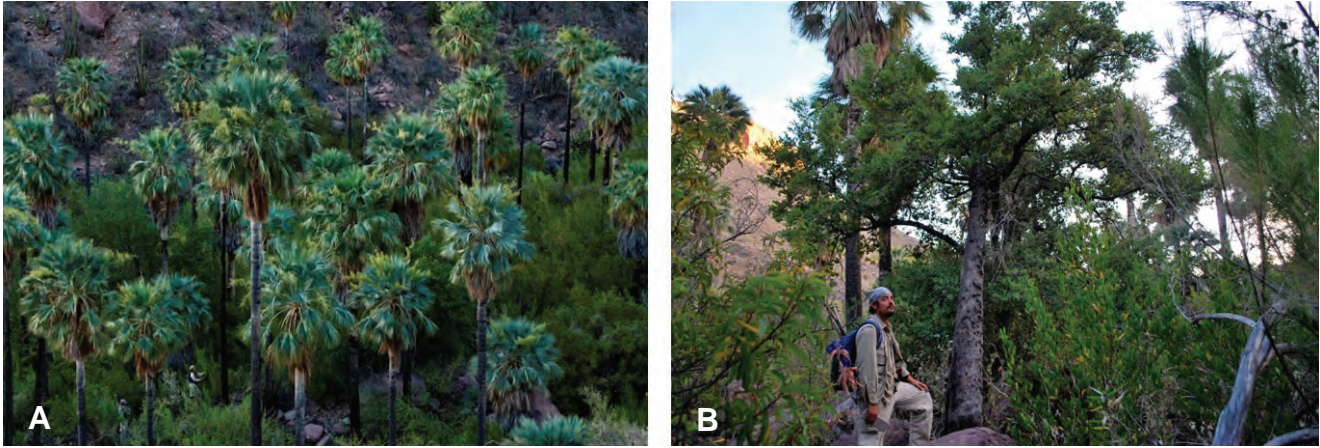
Figure 6. Community of Ambrosia ambrosioides , Baccharis salicifolia , Chloracantha spinosa , Dodonaea viscosa , Prosopis articulata , and Quercus oblongifolia around blue fan palm population of El Descanso canyon one of the most remote tributaries of El Paraíso canyon view from outside the canyon, (A); view from inside the canyon, (B).

densities of blue fan palms (Figure 4B). Compared with the populations growing along the El Paraíso tributaries, these palms were lower in size (from 1.5 to 6 m tall, average 3.5 \pm 1.3 m, n = 20 ). In April, these populations were flowering (average 6.9 \pm 2.4 inflorescence per palm, n = 20 ).