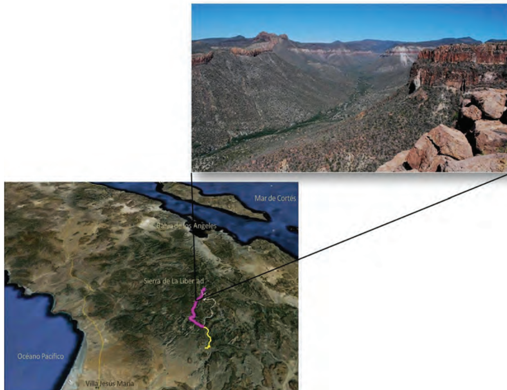
Figure 1. Google-Earth map showing the location of Sierra de La Libertad, Baja California, the routes followed during the expeditions, and a northeast view of El Paraíso canyon from the cliff border.

Based on this partial and incomplete information we explored these mountain ranges by air in 2006. From the air, we identified the main El Paraíso Canyon, its tributaries, and many remote blue fan palm oases, but we could not see any roads to reach them. In April and October of 2009, we