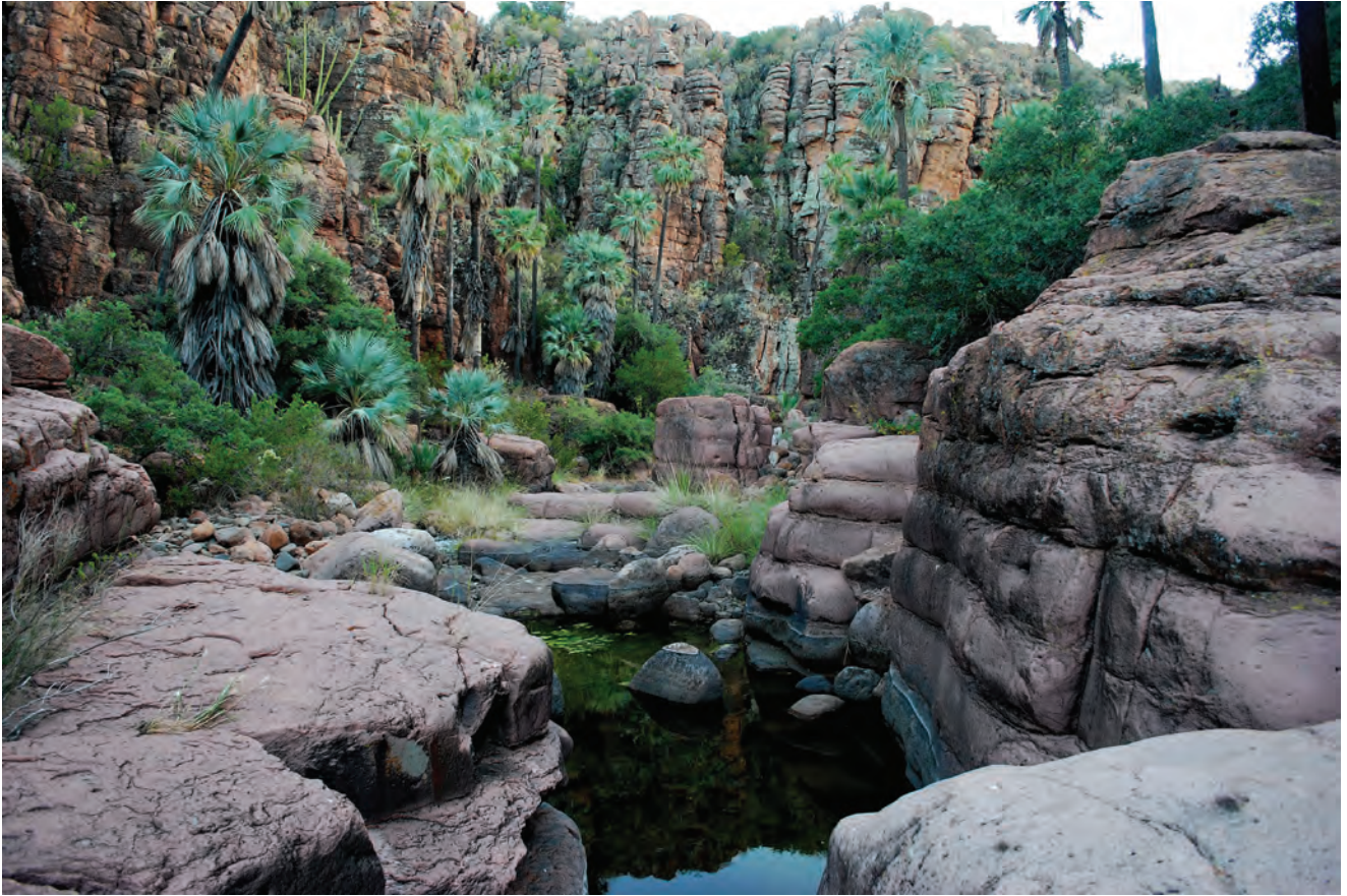
Figure 7. Blue fan palm population between red volcanic foldings in Las Cuevitas canyon located up in the mesas.

many explorers and researchers starting with Jesuit missionaries like Consag in 1773, Longinos 1792, and subsequently Eisen 1893, Nelson 1921, Shreve 1951, Wiggins 1980, etc. (see Garcillán et al. , 2010, for a thorough historical review), and more recently by Turner et al. 1995, González-Abraham et al. , 2010. However, it was Brandegee who between 1889 and 1902 provided the first botanical data and suggested the marked change in the flora that occurs at about latitude 28° N. Later on, Shreve's (1951) observations of the Sonoran Desert suggested that life forms are distributed according to their strategies in order to survive the aridity of the desert and to conserve humidity. The combined latitudinal effects of the northern and southern climates (summer tropical rains with occasional hurricanes, and cold temperatures combined with winter rains), as well as the altitudinal effects that determine the western and eastern oceanic influences in the local weather of SLL (Reyes-Coca et al. , 1990; Cavazos-Pérez, 2008) create a melting pot area of ca. 2,500 km 2 with numerous ecological niches where species with more northern and southern affinities coexist. This region has consecutive years with little rainfall interrupted by the sporadic passing of a hurricane and two to three winter storms. Seventy-nine percent of the annual rainfall almost