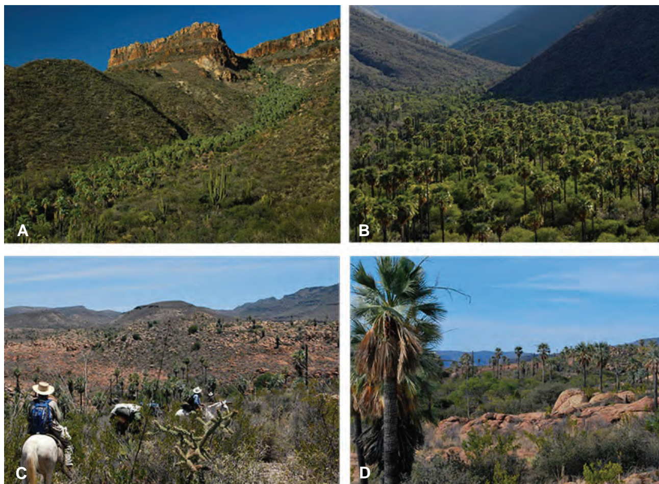
Figure 4. The most remote blue fan palm population inhabiting the lower parts of El Paraíso canyon and tributaries (A, B); community around blue fan palm population inhabiting the top of mesas in Sierra de La Libertad (C, D).

senhardtia by J. M. Lang (1972). Wiggins (1980) briefly describes E. peninsularis illustrating and comparing it with E. polystachya , a species from Durango and Tamaulipas to Oaxaca. All these descriptions were based on the only specimen collected by Brandegee in 1889. During our 2009 expeditions, we discovered four populations of E. peninsularis along a range of approximately 9.3 km. Two were small populations distributed along the canyon drainages between 720–870 m. The other two populations were found over the mesas at nearly 1,200 m, and constitute the largest populations known of this rare endemic species. These populations were found on a whitish volcanic tuff substrate with other species like Bernardia myricifolia , Calliandra californica , Croton magdalanae , Cylindropuntia alcahes , Dalea bicolor var. orcuttiana , Dodonaea viscosa , Fouquieria splendens , Krameria erecta , Prosopis articulata , Senegalia greggii , Solanum hindsonianum , and in many cases with Brahea armata as well. Even though E. peninsularis had been rediscovered in 1992, large populations such as the ones found during our expeditions had not been documented. The high grazing pres-