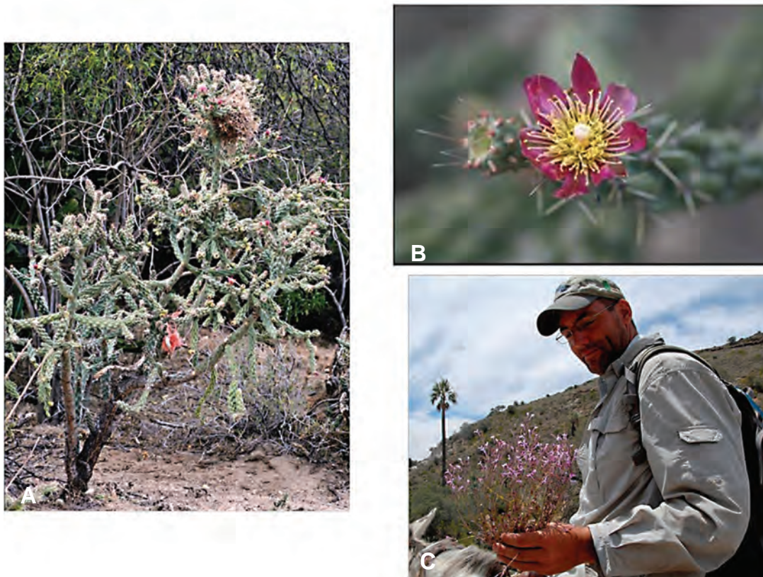
Figure 3. Shrub of 2.5 m height of the new Cylindropuntia (Cactaceae) species (A, B); a sample of the new Stephanomeria species (C), found in El Paraíso canyon adjacent areas, Sierra de La Libertad.

be a morphological type between C. cholla and C. alcahes . The other new taxon is Stephanomeria sp. nov. (Asteraceae), which was found on a single population along a tributary of El Paraíso Canyon at 870 m. Even though seeds are needed to properly describe the new species, Dr. Les Gottlieb, a taxonomic expert in the genus Stephanomeria , corroborated that it is a new species. This new Stephanomeria is a very rare perennial herb, up to 1 meter tall, with blue green leaves, lavender petals and purple stigmata (Figure 3C).