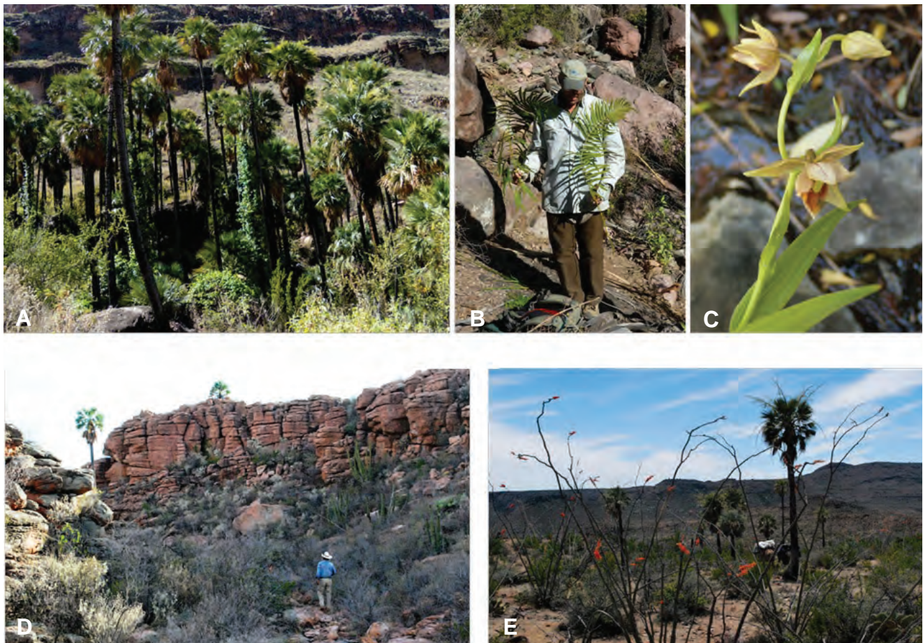
Figure 5. Particular communities around blue fan palm populations identified in El Paraíso adjacent areas, Sierra de La Libertad: blue fan palms, vines ( Toxicodendron diversilobum ), orchids ( Epipactis gigantea ), and ferns ( Thelypteris puberula ) (A-C); community of grasses on the mesas (D); and community of ocotillos (E).