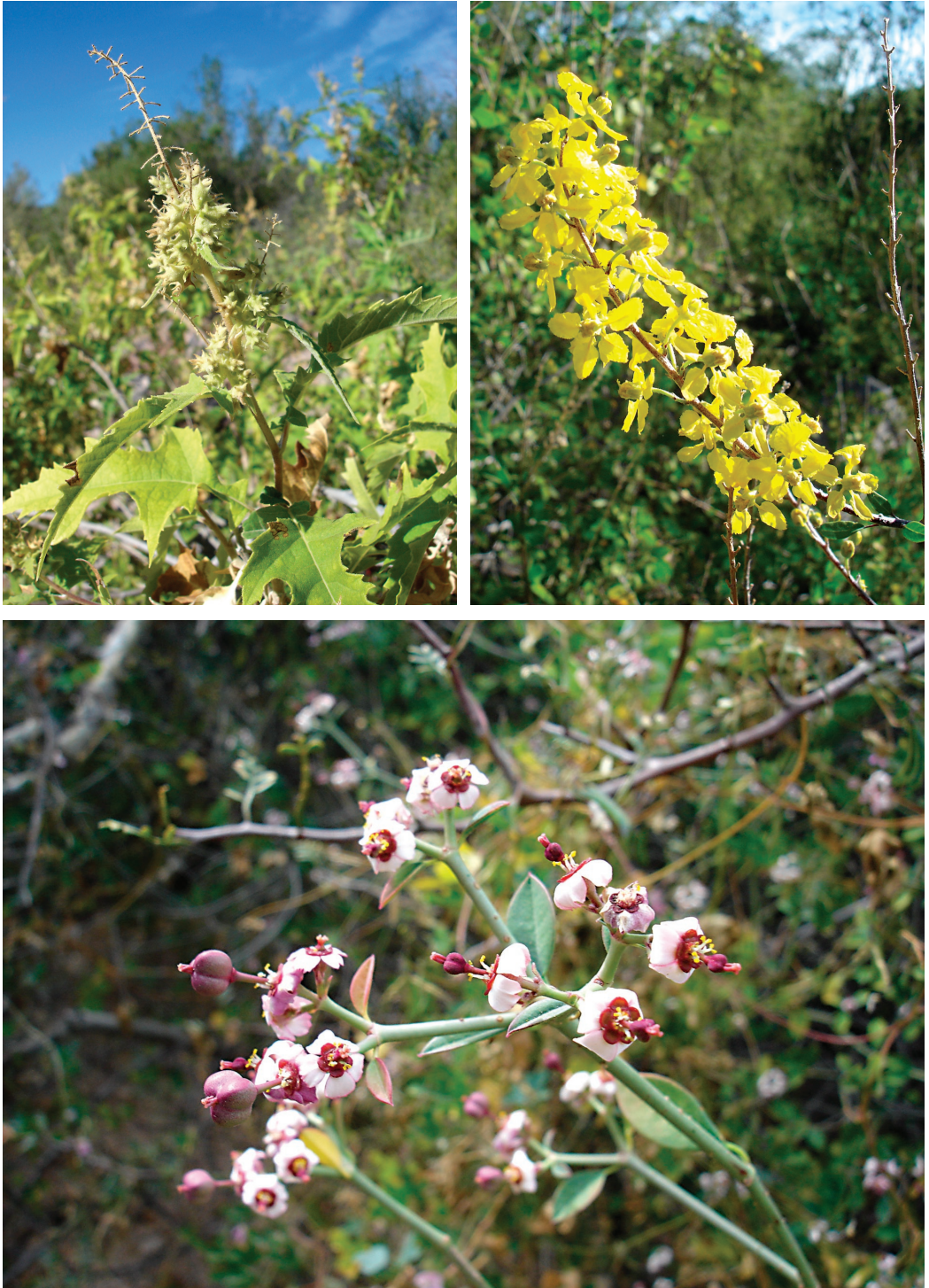
FIG. 4. New records from Sierra Kunkaak. (A, top left) Ambrasia carduacea (Wilder 06-383). (B, bottom) Euphorbia xanti (Wilder 06-453). (C, top right) Echinopterys eglandulosa (Wilder 06-377).