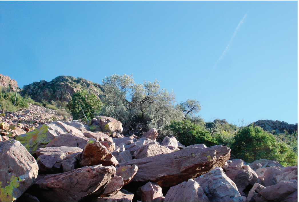
FIG. 3. Sierra Kunkaak. (A, top) Sheltered, interior canyon, ca 0.5 km up canyon from Siimen Hax waterhole. (B, bottom) Sideroxylon leucophyllum on talus slope on north side of Cerro San Miguel. Photos by Benjamin Wilder, 25 Nov 2006.