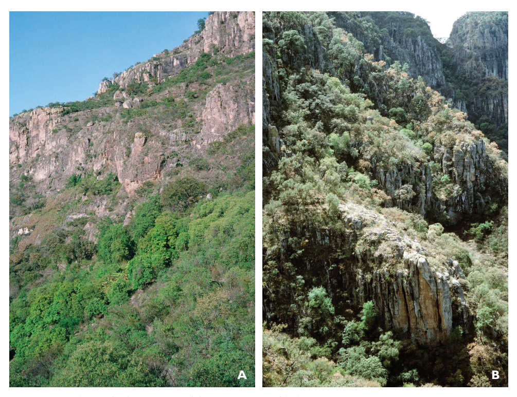
Figure 5. Habitat of Chiococca grandiflora in vicinity of holotype location near Tepopa, Sonora, at ecotone of upper tropical deciduous forest including riparian evergreen forest, and lower edge of pine-oak forest. 5a showing abandoned orchard with fruit trees including bananas near center.

dents from the University of Arizona revisited this famous Gentry collection locale in 1992–93 (Martin et al. 1998) and found growing in the abandoned orchard avocado, banana, grapefruit, mango, orange, peach and pomegranate trees, and cultivars of native Casimiroa edulis La Llave and Tecoma stans (L.) Juss. ex Kunth.