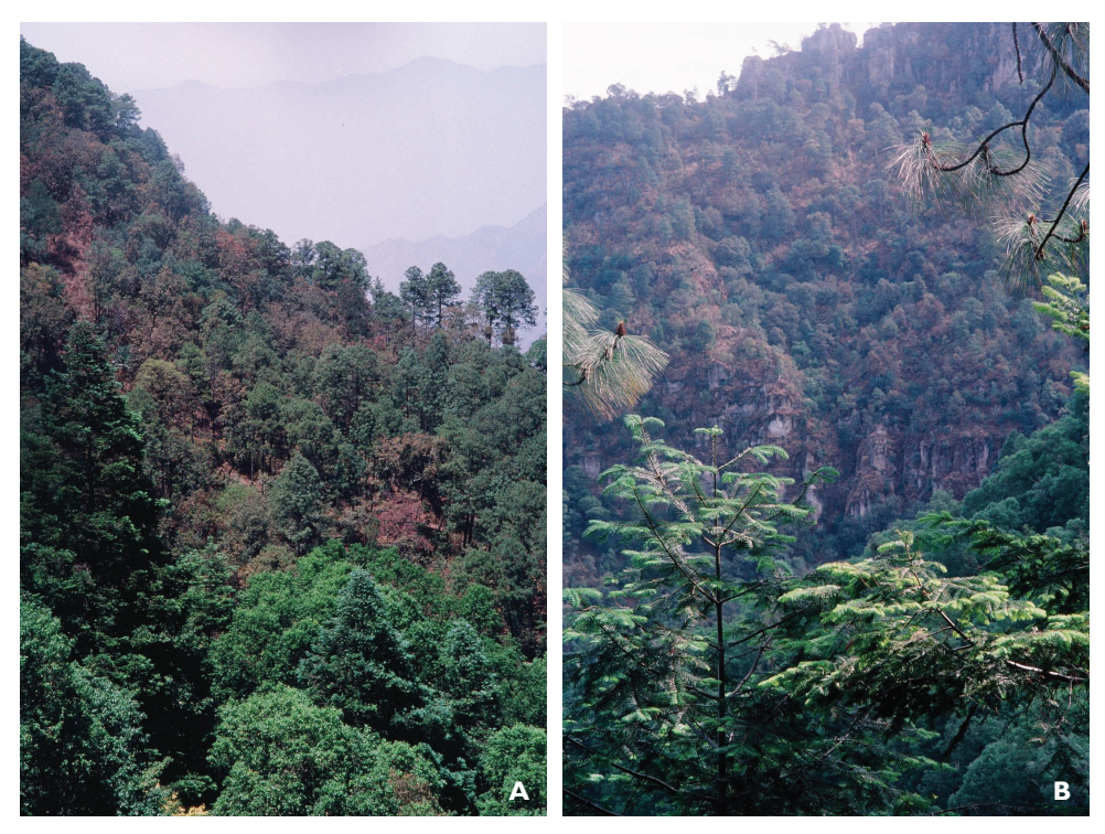
Figure 4. Habitat of Chiococca grandiflora near paratype location ca. 2 miles NW of El Palmito, Sinaloa, Mexico showing deep barrancas with pine-oak forest transitional to tropical deciduous forest.

and Rosa Tourn. ex L. At the most southern paratype locality 19 km west of El Palmito, which is near the Tropic of Cancer at 1890 m along Mexico Highway 40, the vegetation here (23.466, -105.831) is lower pine-oak forest with Pinus oocarpa Schiede ex Schltdl. and Pinus yecorensis as the dominant pines and near the lower limit of Pinus herrerae with an abundance of oaks including Quercus macvaughii, Q. obtusata Bonpl., and Q. tarahumara Spellenb., J.D.Bacon & Breedlove, with Arbutus xalapensis , and Arctostaphylos pungens Kunth.