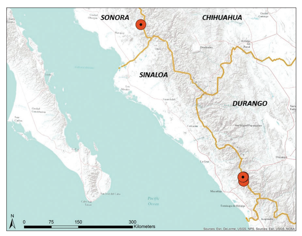
Figure 3. Distribution of Chiococca grandiflora in western Mexico.