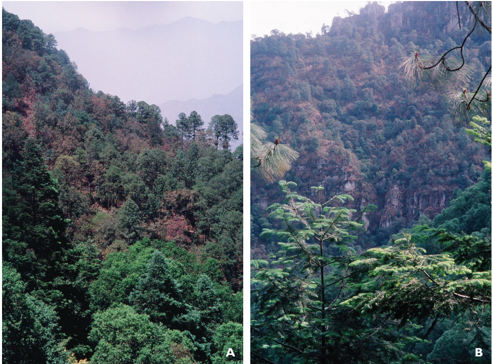
Figure 4. Habitat of Chicoccca grandiflora near paratype location ca. 2 miles NW of El Palmito, Sinaloa, Mexico showing deep barrancas with pine-oak forest transitional to tropical deciduous forest.

and Rosa Tourn. ex L. At the most southern paratype locality 19 km west of El Palmito, which is near the Tropic of Cancer at 1890 m along Mexico Highway 40, the vegetation here (23.466, -105.831) is lower pine-oak forest with Pinus oocarpa Schiede ex Schltdl. and Pinus yecorensis as the dominant pines and near the lower limit of Pinus herrerae with an abundance of oaks including Quercus macvaughii , Q. obtusata Bonpl., and Q. tarahumara Spellenb., J.D.Bacon & Breedlove, with Arbutus xalapensis , and Arctostaphylos pungens Kunth.