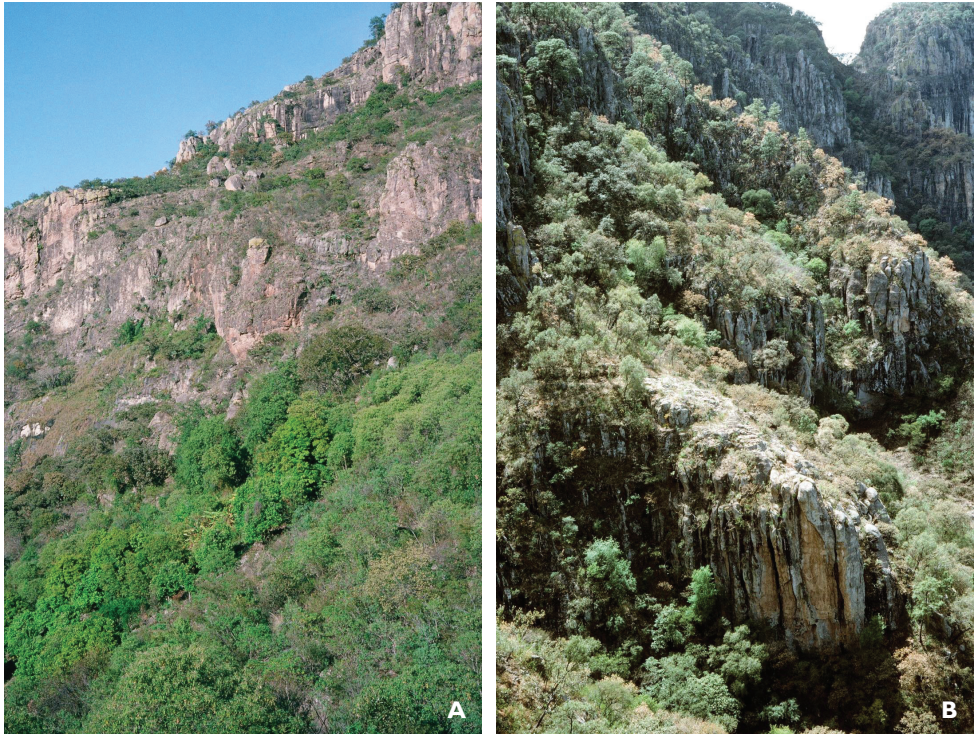
Figure 5. Habitat of Chiococca grandiflora in vicinity of holotype location near Tepopa, Sonora, at ecotone of upper tropical deciduous forest including riparian evergreen forest, and lower edge of pine-oak forest. 5a showing abandoned orchard with fruit trees including bananas near center.

dents from the University of Arizona revisited this famous Gentry collection locale in 1992–93 (Martin et al. 1998) and found growing in the abandoned orchard avocado, banana, grapefruit, mango, orange, peach and pomegranate trees, and cultivars of native Casimiroa edulis La Llave and Tecoma stans (L.) Juss. ex Kunth.