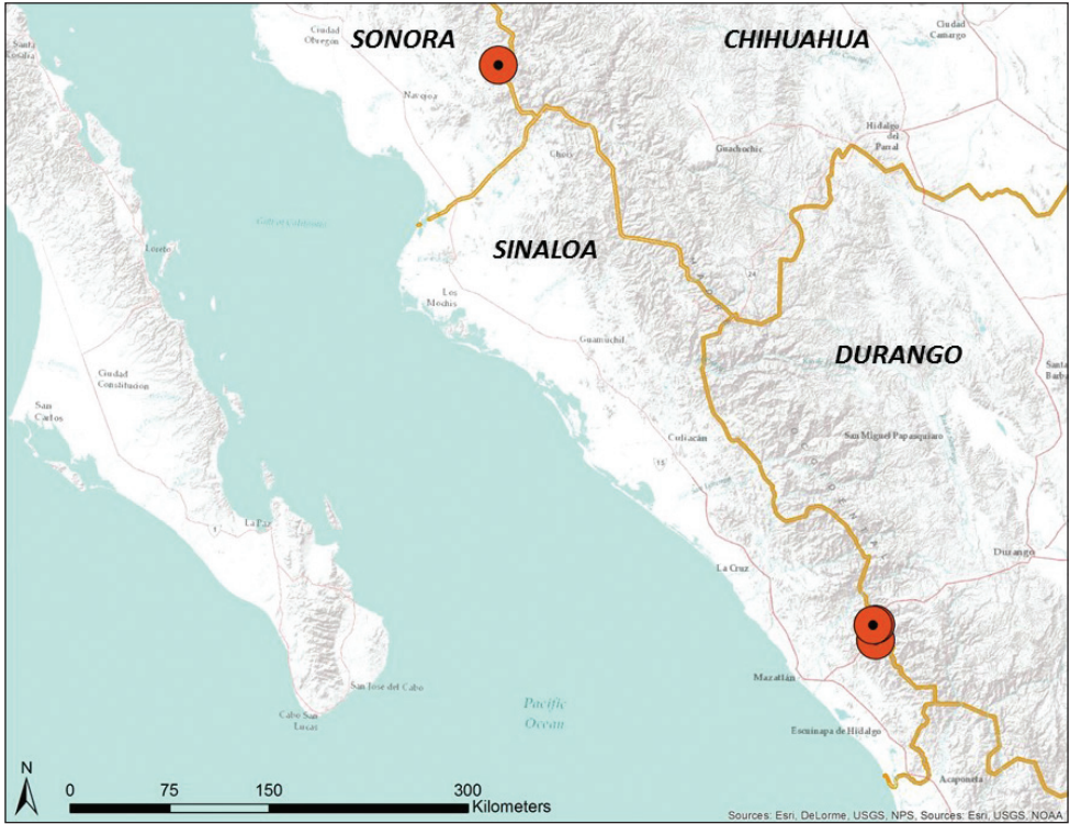
Figure 3. Distribution of Chiococca grandiflora in western Mexico.