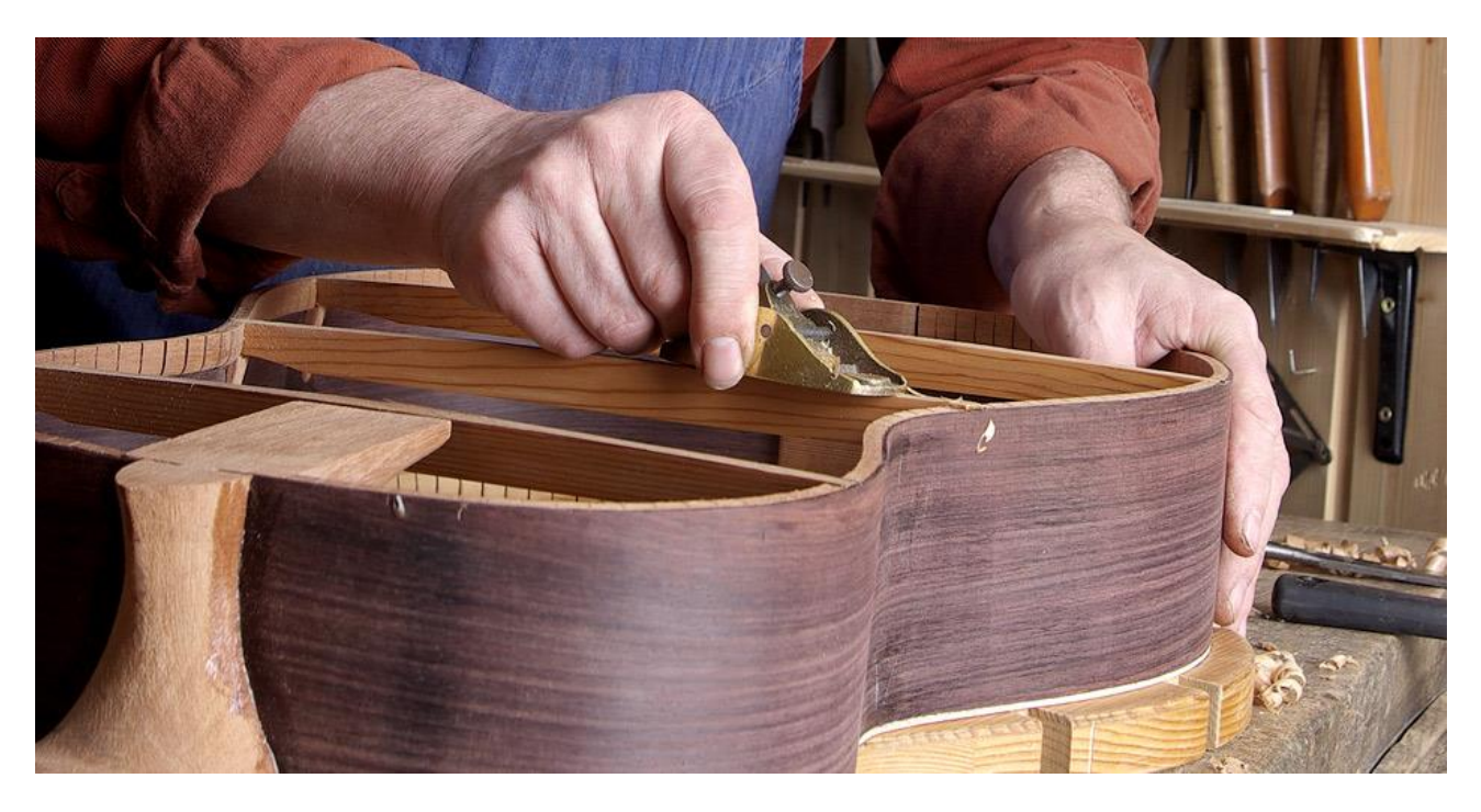
Figure 1: Guitar manufacturing, Source: (Voigt-Luthiers Gitarren, 2018).

Impacts of the Convention on International Trade in Endangered species of Wild Fauna and Flora (CITES) on various Stakeholders in the Music Industry