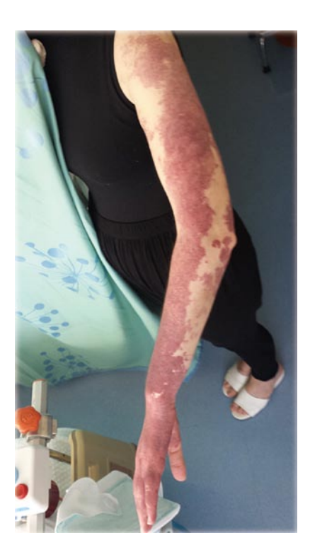
Figure 1 Vascular malformation, left upper extremity of mother.