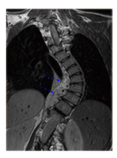
Figure 5 Coronal T2-weighted magnetic resonance imaging.