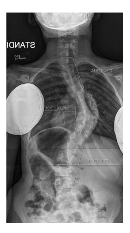
Figure 2 Pre-operative AP X-ray.