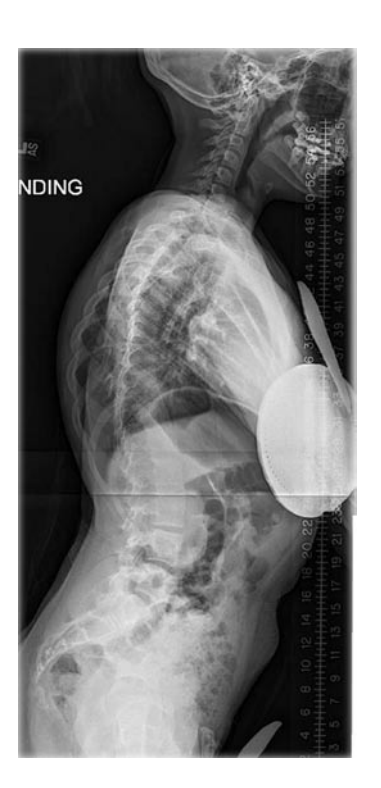
Figure 3 Pre-operative lateral X-ray.

Several tumors within the spine have been shown to be associated with scoliosis and spinal deformity, most commonly osteoid osteoma and osteoblastoma<sup>[14,15]</sup>, but also astrocytoma, ependymoma, epidermoid cyst<sup>[16]</sup>, and bone lymphangioma<sup>[11]</sup>. However, there have been no reports of spinal deformity associated with paraspinous hemolymphangioma. In the case