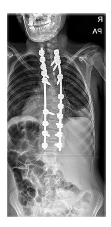
Figure 7 Post-operative AP X-ray.

This case also presents several interesting clinical dilemmas. The first dilemma is whether an MRI should have been obtained pre-operatively. Since this patient was healthy and lacked any neurological signs or atypical features, a pre-operative MRI did not appear to be indicated<sup>[13]</sup>. However, given the findings of this case report, it is reasonable to obtain a pre-operative MRI in patients with a strong family history of lymphatic tumors. Secondly, the unexpected intra-operative finding of a thin, whitish fluid from the pedicle raises an important dilemma regarding surgical decision-making. In this instance, a drain was placed and the etiology was further investigated. The staged procedure allowed the surgeon to review the patient's case with experts