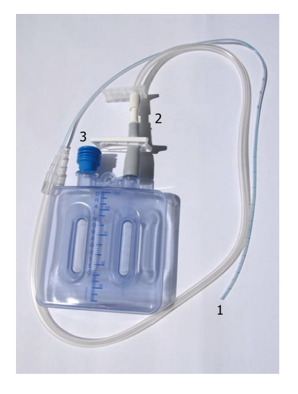
Figure 1 Redon's catheter. 1: Multiperforated polyvinyl tubing; 2: Luer-lock connector (with clamp above and under the connector) allowing safe disconnection of the plastic bottle; 3: Control of bottle vacuum (collapsible cap, when inflated the cap indicate the loss of vacuum).