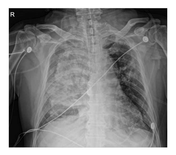
Figure 2 Postoperative chest radiograph at the intensive care unit. Immediate postoperative chest X-ray revealed diffuse haziness of the entire right lung field.