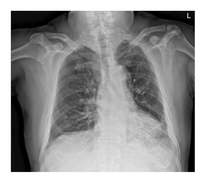
Figure 1 Preoperative chest radiograph. Chest radiographs showed subsegmental atelectasis in the left lower lobe and mild cardiomegaly.