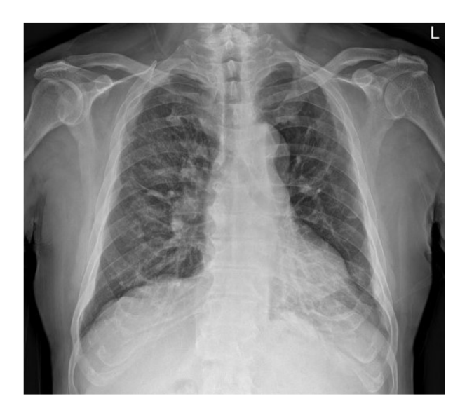
Figure 4 Postoperative chest radiographic examination on the eighth postoperative day. After recovery, most of the radiologic haziness of the right lung had disappeared in the chest radiograph.