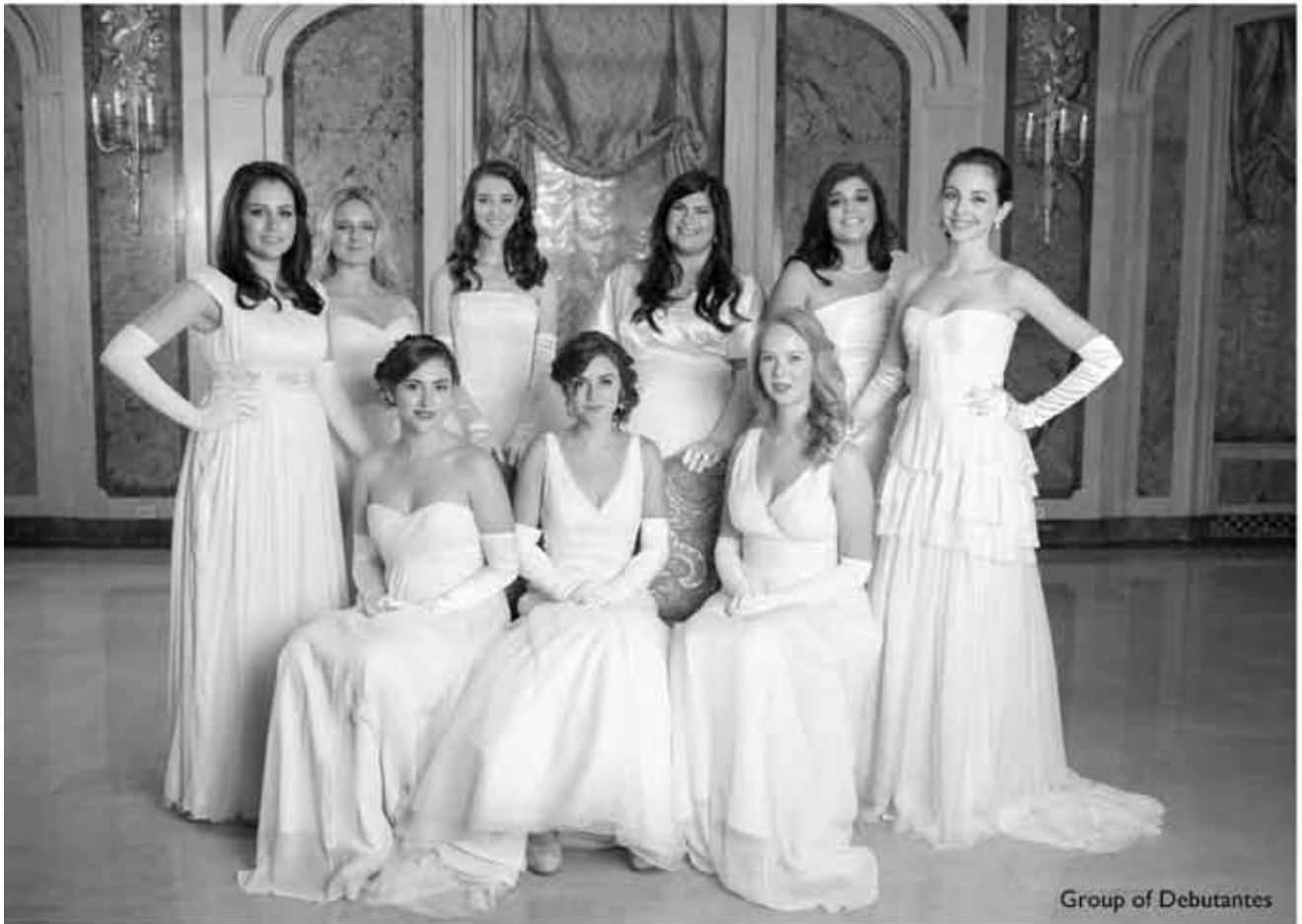
Group of Debutantes