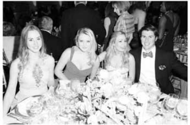
The future of French American Aid For Children