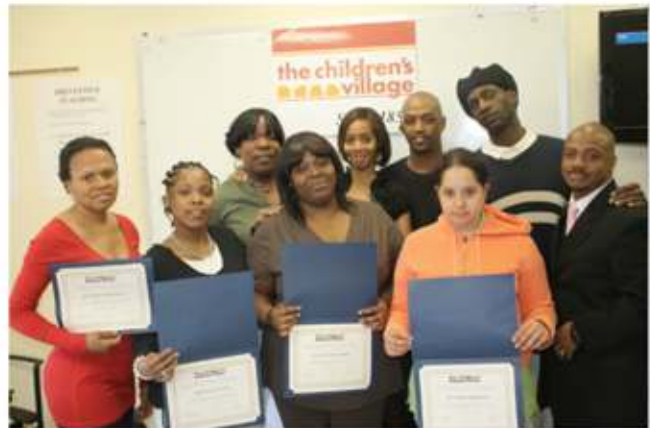
I.M.P.A.C.T. graduates with their diplomas