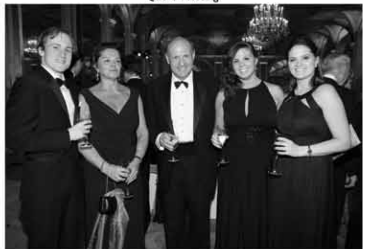
The Chater Family