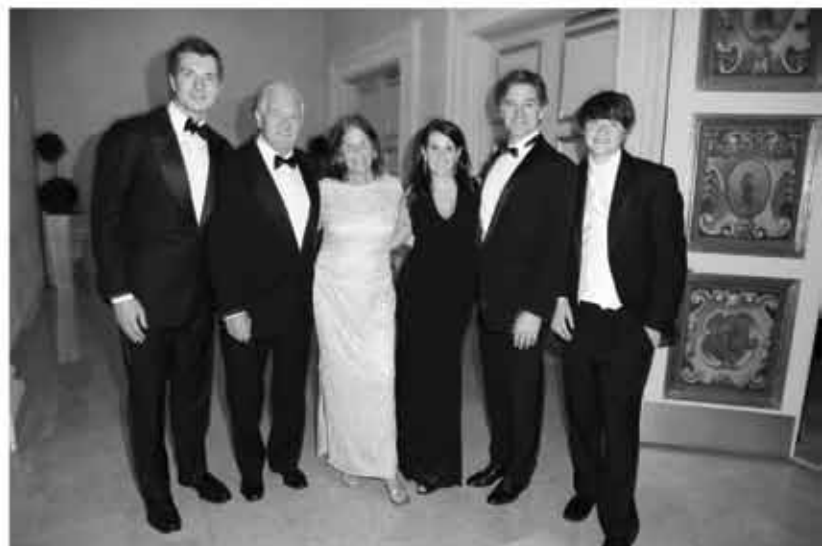
Dr. Mehmet Oz and Family