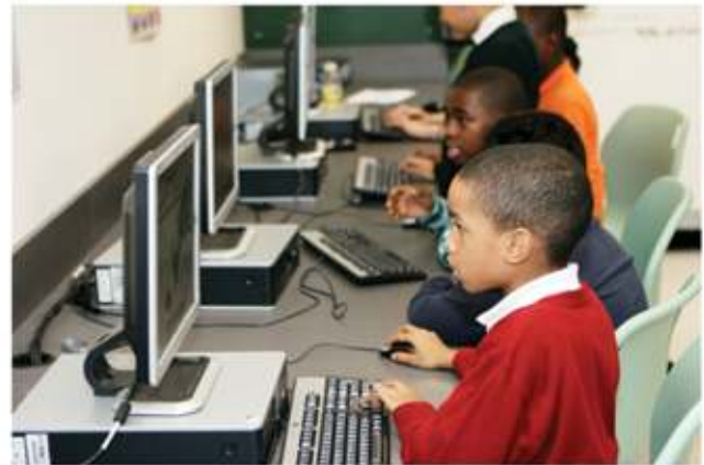
Computer Literacy Class at the Coudert Clubhouse