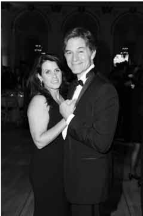
Lisa Oz and Dr. Mehmet Oz