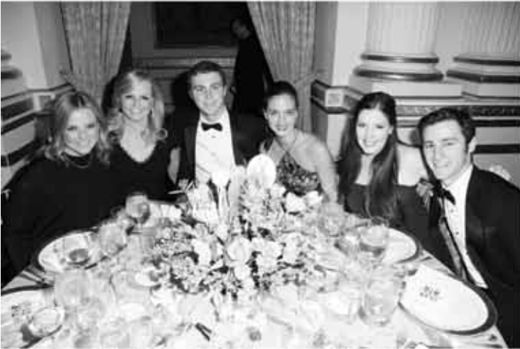
The future of French American Aid For Children