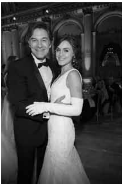
Dr. Mehmet Oz and his daughter