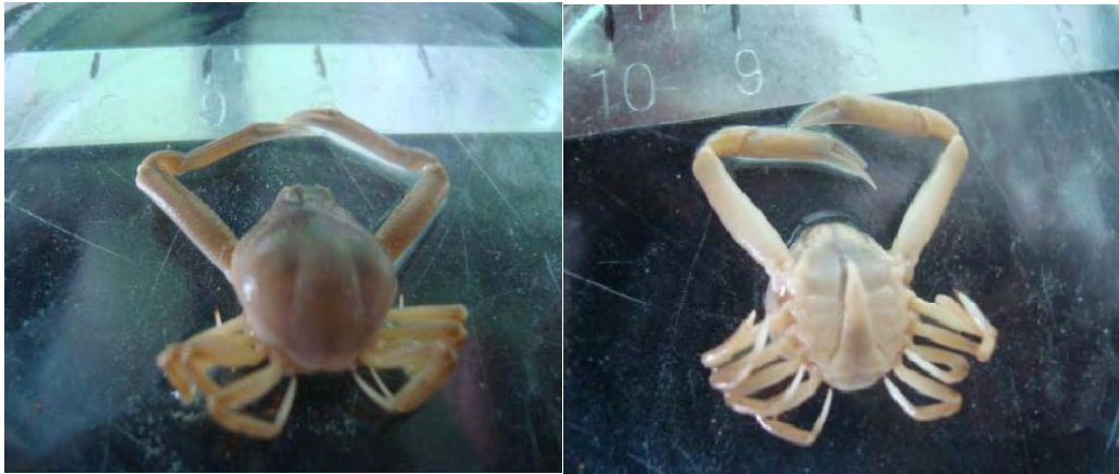
d. Hiplyra sagitta (Galil, 2009)