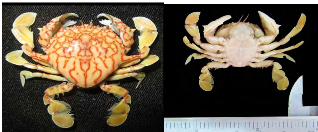
g. Matuta planipes (Fabricius, 1798)