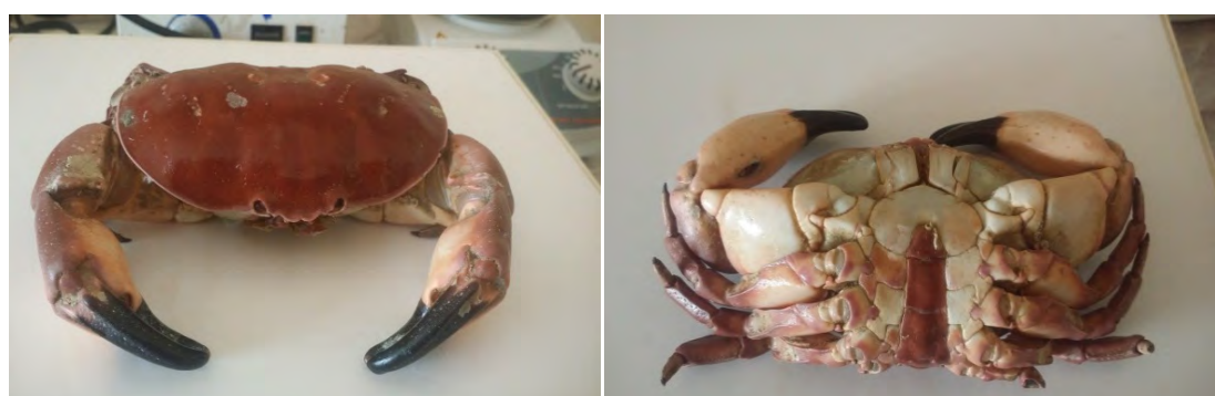
b. Atergatis roseus (Rüppell, 1830)