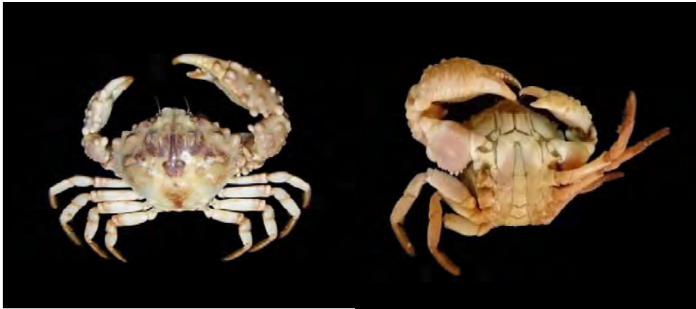
e. Halimedetyche (Herbst, 1801)