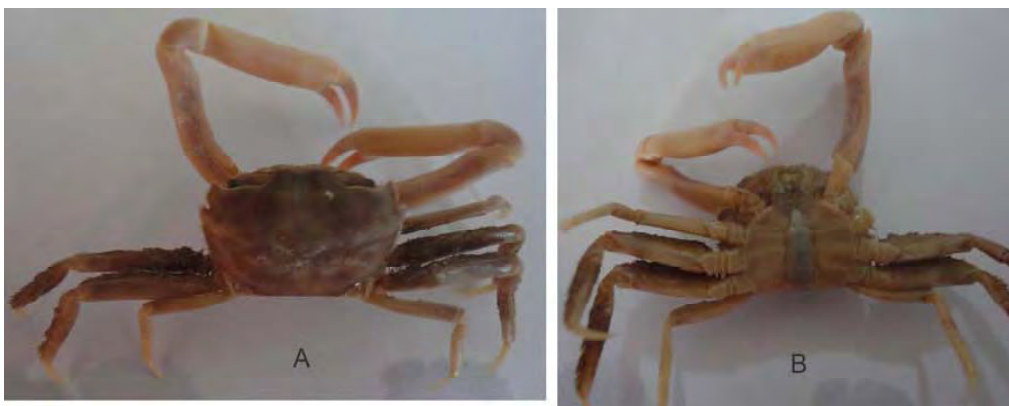
f. Metaplex indica (H. Milne Edwards, 1852)