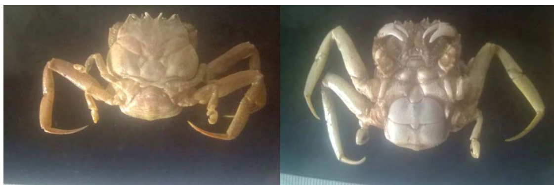
a. Dorippe quadridens (Fabricius, 1793)

Hyastenus hilgendorfi was absent only in site 1 in summer, while Halimedetyche was absent only in site 3, Atergatis roseus (Rüppell, 1830) was the least present species caught and recorded only in site 1.