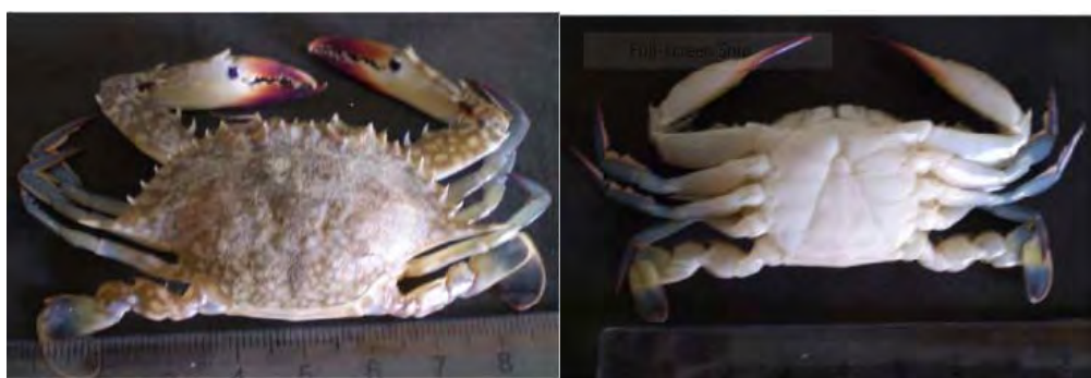
h. Portunus pelagicus (Linnaeus, 1758)

Fig. 2 a, b, c, d, e, f, g and h: (Left image -dorsal view, right image - ventral view). Crab species collected from the Iraqi coastal waters of the NW Arabian Gulf.