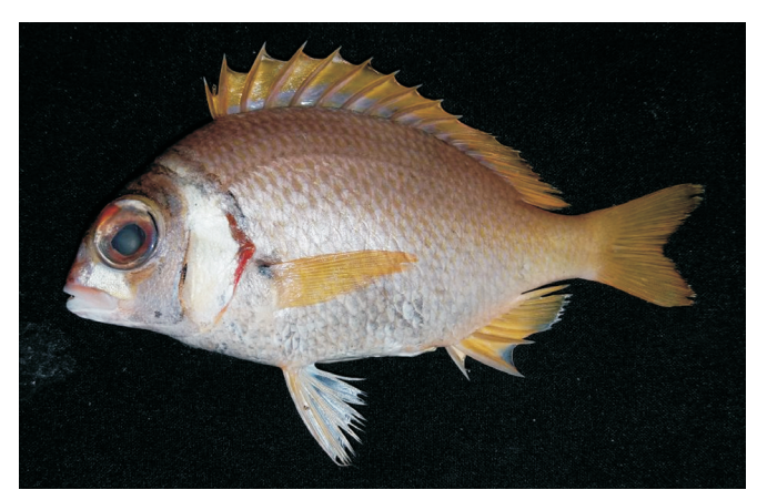
Figure 1. Scolopsis vosmeri, 173 mm TL, collected from Iraqi marine waters.