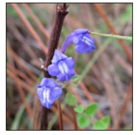
Havana skullcap (Scutellaria havanensis)