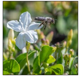
Pineland clustervine (Jacquemontia curtissii)