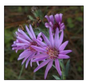
Eastern silver aster (Symphyotrichum concolor)