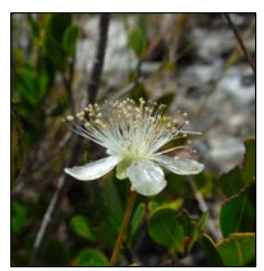
Long-stalked stopper (Mosiera longipes)