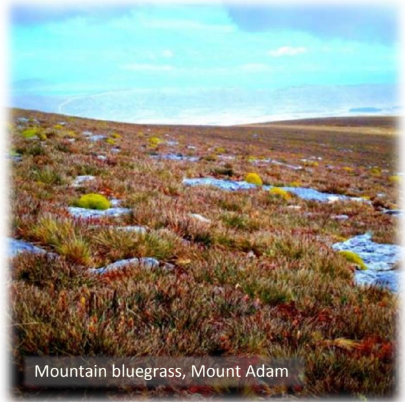
Mountain bluegrass, Mount Adam