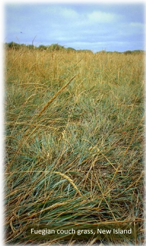
Fuegian couch grass, New Island