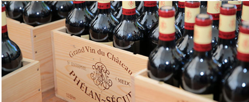
Domaine Legay - Bordeaux