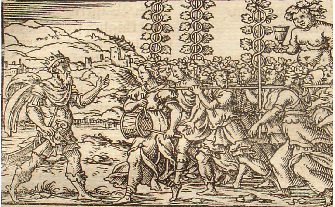
Pentheus meets Bacchus - Virgil Solis Edition, 1581

554-556. Another list of subjects: three in 554 with iuvant and four in 555-556 on the other side of