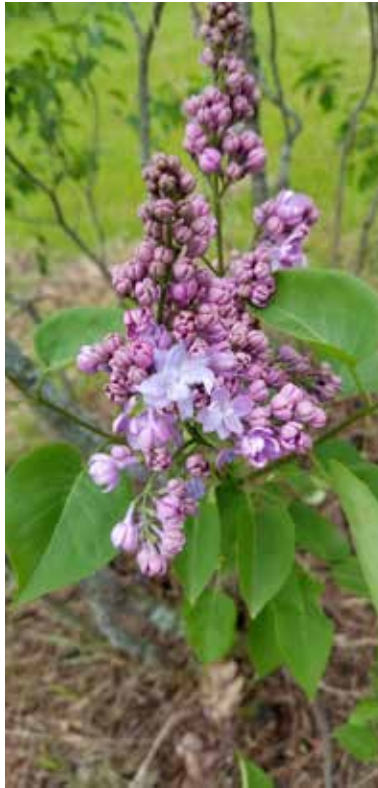
May 29, 2019