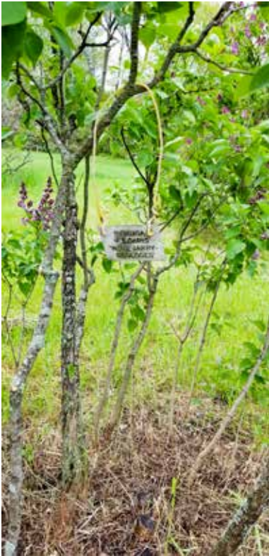
May 24, 2019