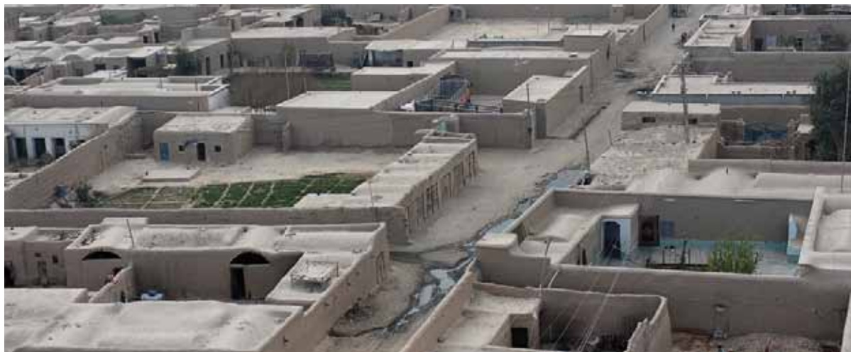
Aerial view of houses, Lashkar Gah