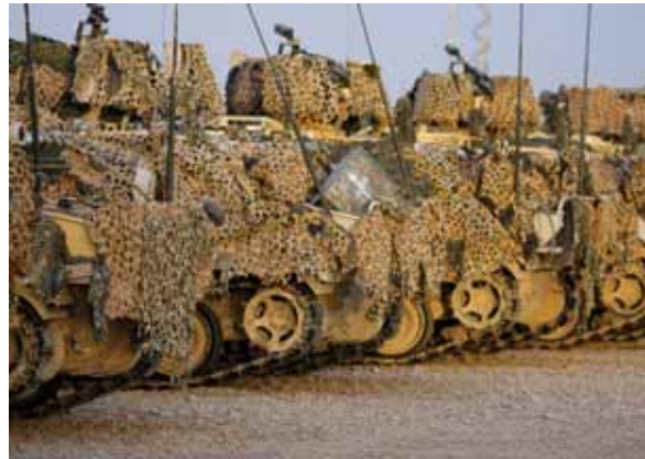
Camouflage tanks and soldiers in PRT compound

This section discusses the background to the international military presence in Helmand, and focuses on the stabilization model adopted by the UK in the province between 2006 and 2008.