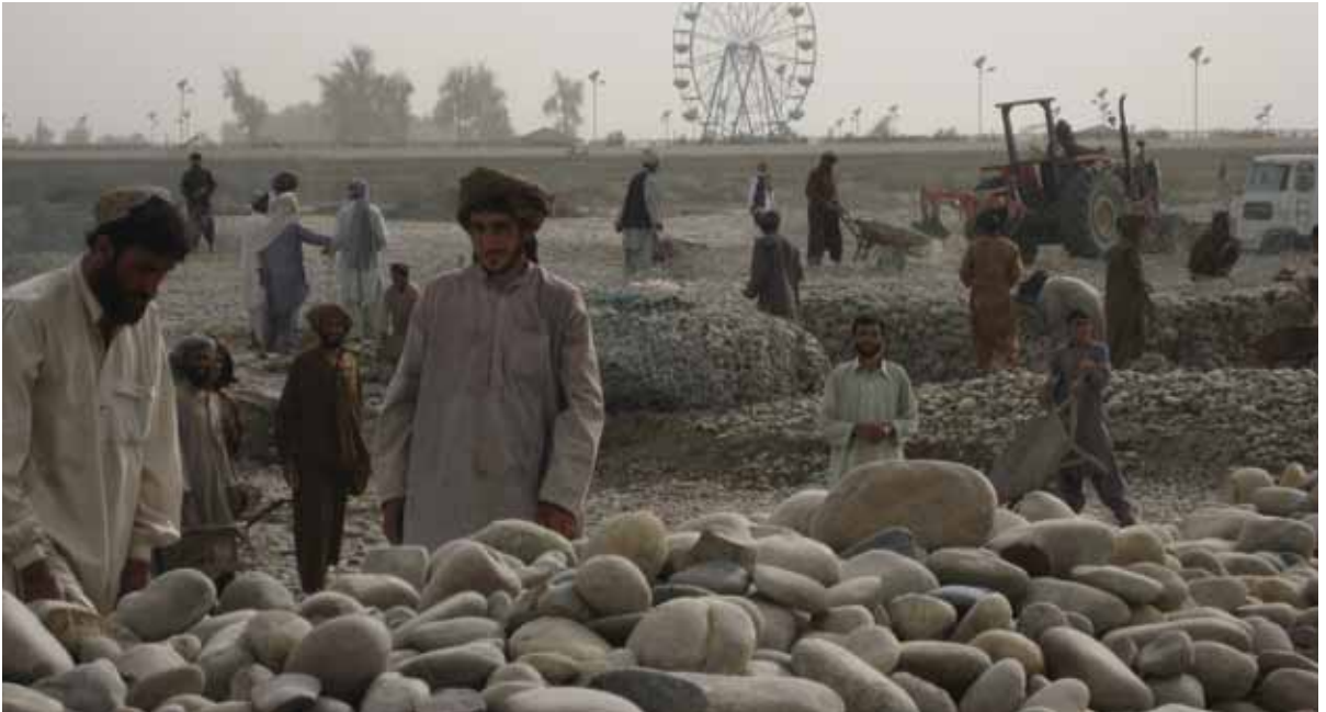
Laborers near Shamalan Canal and Bolan Park

was perhaps a good example of the consequences of this: while several groups of Babaji elders appeared content with the route, design, and construction contracts, several large communities contested all three and expressed severe discontent with the PRT and ISAF as a consequence.