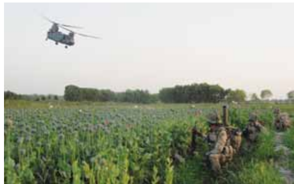
British soldiers in poppy field, Babaji

The Helmandi agricultural sector produces wheat, corn, maize, vegetables, orchard crops, and opium, and engages in animal husbandry. The region is also well known for producing