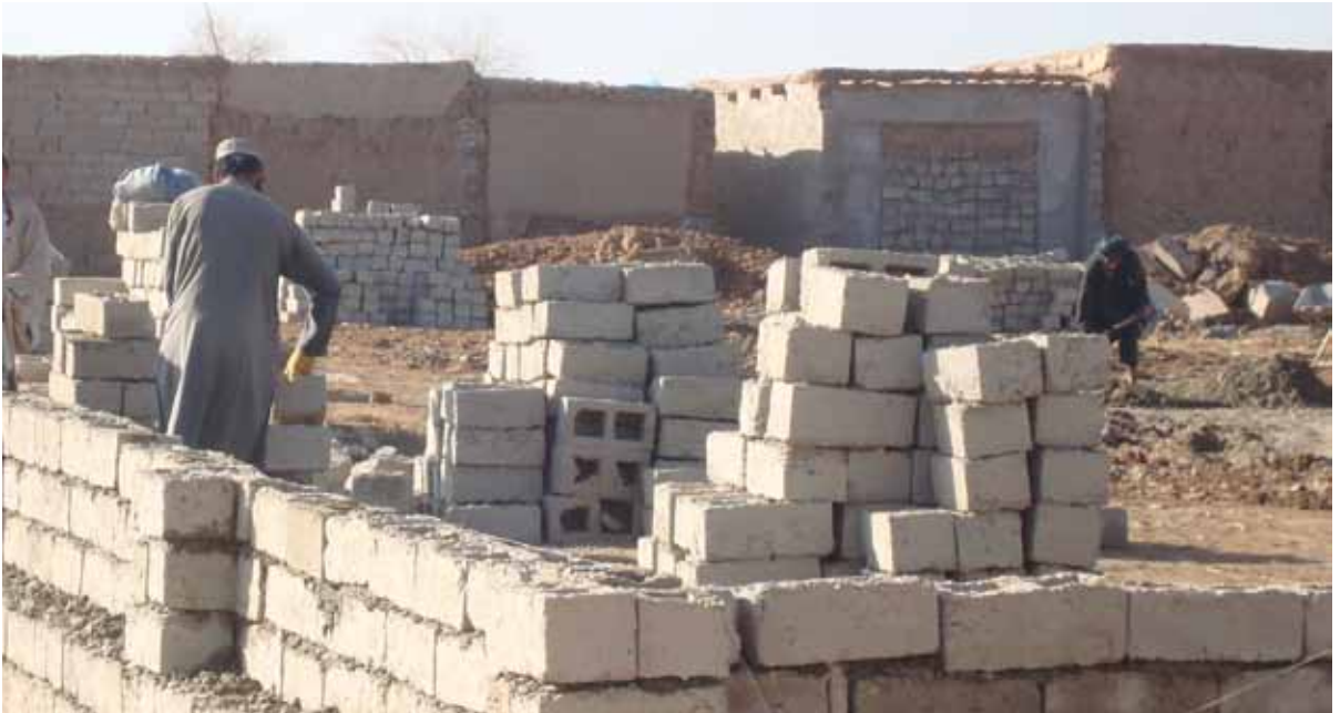
Construction of new mosque at Nad-e Ali

structures. This was intended to stimulate broader development processes as well as demonstrating that the UK and the government of Afghanistan could deliver against their various promises. In effect DFID staff tended to focus on the process of defining needs as well as project outputs , and were far less enamored of projects with outputs defined in terms of “visibility,” particularly where this could be interpreted as backing particular political figures in Helmand such as the provincial governor. Towards the end of 2008, DFID thinking tended to suggest that QIPs and the stabilization program generally should more closely align with ANDS and governmental priorities particularly as they related to the rollout of sub-national governance structures.