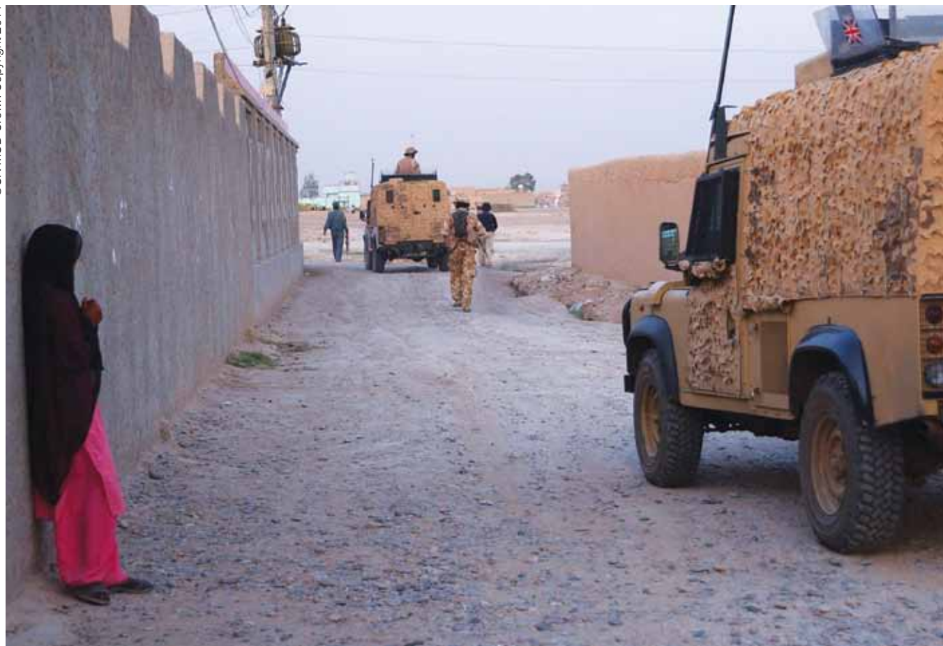
Joint PRT/Afghan National Police patrol, Lashkar Gah

The following section identifies the way in which QIPs were used as a component of the stabilization strategy, then, taking into consideration the models described in the previous section, unpacks local perceptions of “stability” and the legitimacy of the ISAF and government presence.