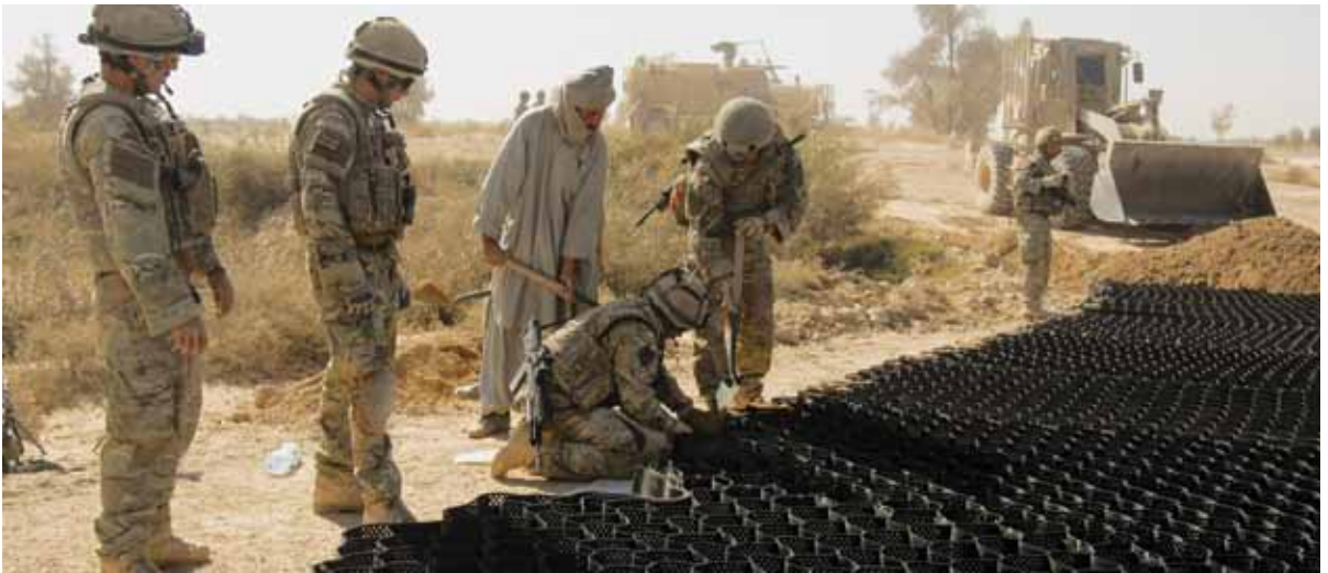
Road building between Lashkar Gah and Gereshk

the populations of outlying districts had not responded positively to improvements in public services in the two major urban centers (a key component of the original stabilization model) despite surprisingly high levels of confidence in government in those (focus) areas. Rather, the conflict drivers in the outlying areas remained sufficiently powerful that they were able to crowd out any broader strategic messages generated by the stabilization program. In effect, the “ink spot” strategy relied upon a stabilization program that appeared to have little or no traction in the outlying areas.