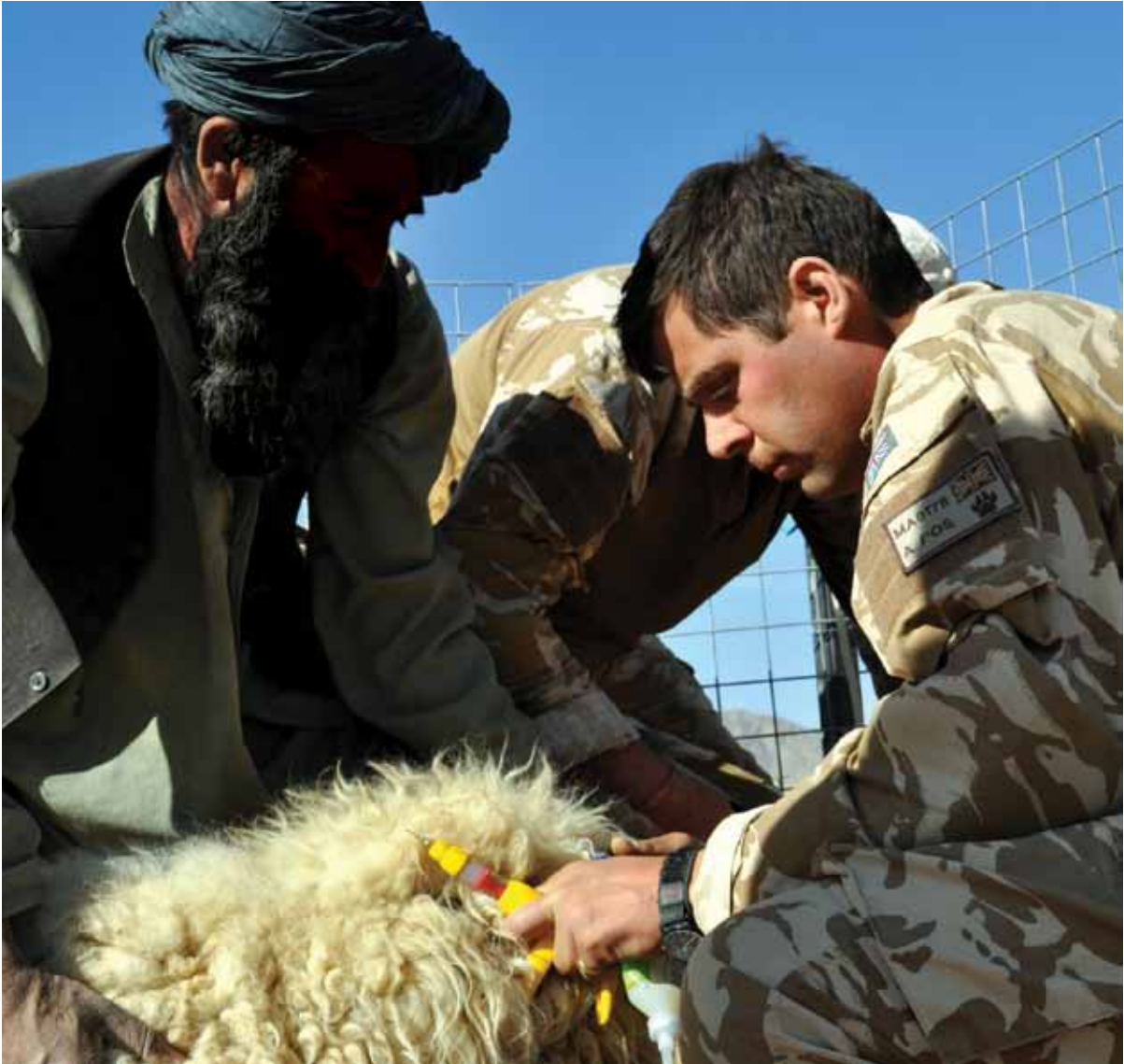
British Army Veterinary Officer treats sheep