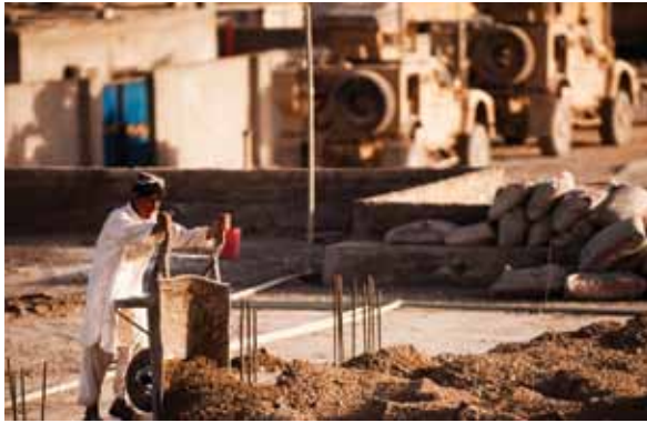
Construction work on district governor's center, Nawa District

a positively perceived state-building or peace-building function.