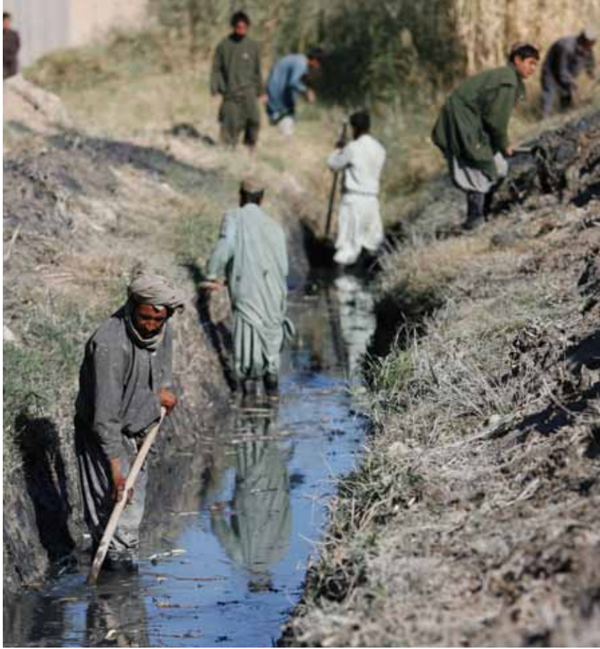
Cash for work project

and key leaders. However, many expenditures were united by their intended indirect effect of “community penetration.” The “tangible” objective in each case proved not to be intangible “consent” but the establishment of channels for dialogue to facilitate the flow of intelligence and for the military to use to signal their control of an area and communicate a range of positive messages. However, there is little evidence to suggest that the benefits of these programs were capitalized upon in any systematic way. Furthermore, the emotiveness created within the PRT by the debate over consent winning activity generally clouded judgments and slowed the identification of what worked and under what conditions. Perhaps surprisingly, the author was unable to collect any evidence from the PRT that demonstrated reasonable proof of a direct link between QIPs and consent generation.