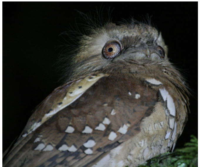
Philippine Frogmouth right next to our sleeping quarters on Mt. Kitanglad, Mindanao.

WHITE-EARED DOVE ( Phapitreron leucotis ) – A very common voice throughout the tour route, but we saw relatively few this year. [E]