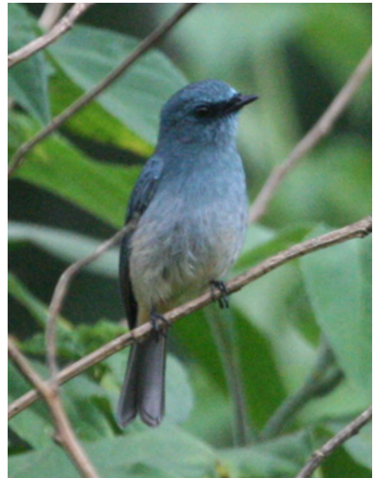
This is the buff-bellied race of Island Flycatcher ( E. p. nigriloris ) from the highlands of Mindanao.

PHILIPPINE NEEDLETAIL ( Mearnsia picina ) – One of the strangest of all the swifts, we enjoyed multiple looks at this