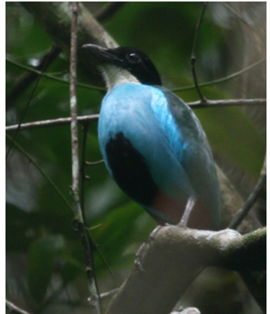
Azure-breasted Pitta...a beauty seen well at PICOP

We have more information about this itinerary and future departures on our web page for Philippines .