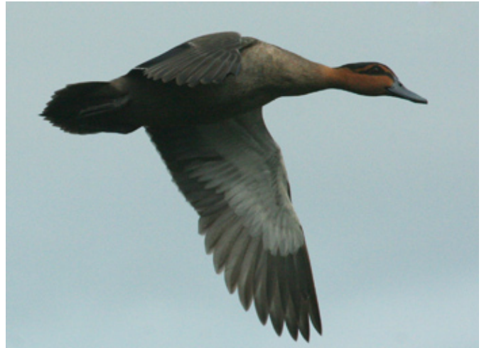
Philippine Duck

ASIAN DRONGO-CUCKOO ( Surniculus lugubris ) – Another widespread Asian bird, we had this one on Palawan only.