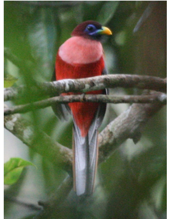
Philippine Trogon, a gorgeous endemic

PACIFIC GOLDEN-PLOVER ( Pluvialis fulva )