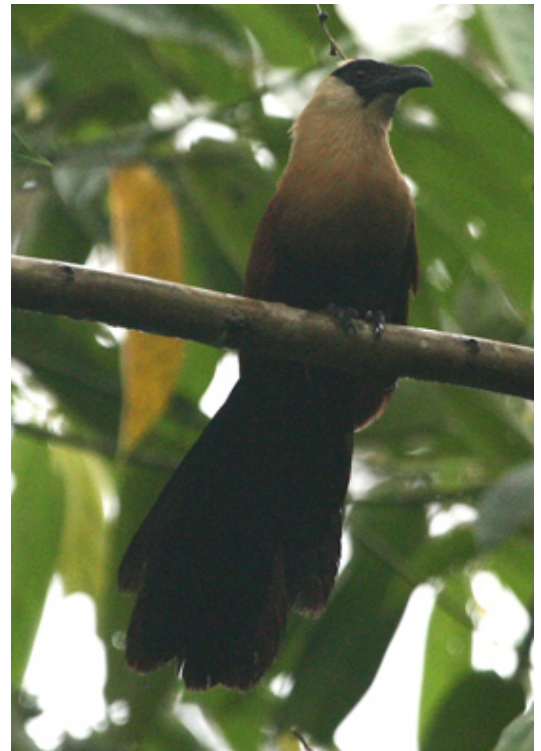
Black-faced Coucal