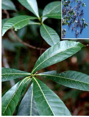
2 Alstonia spectabilis APOCYNACEAE