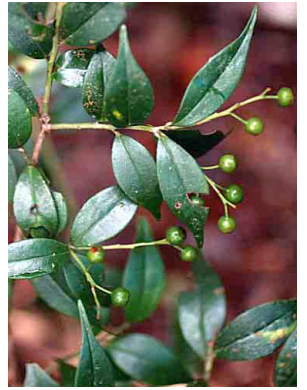
10 Vaccinium elegans ERICACEAE