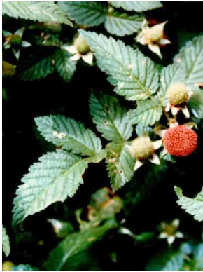
27 Rubus rosaefolius ROSACEAE