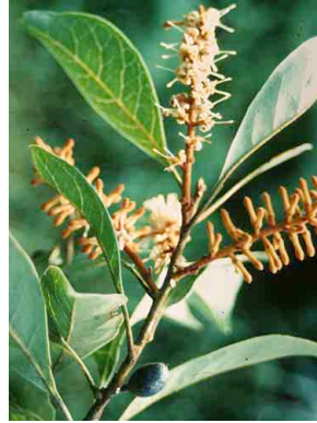
24 Helicia rigidiflora PROTEACEAE