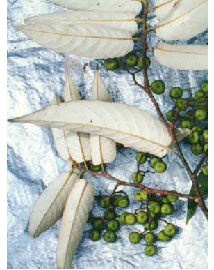
25 Alphitonia philippinensis RHAMNACEAE