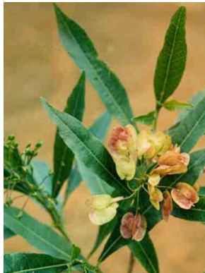
33 Dodonaea angustifolia SAPINDACEAE