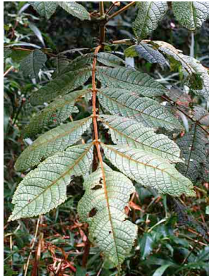
7 Weinmannia sp. CUNONIACEAE