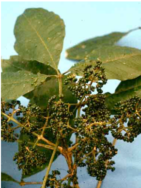
31 Euodia confusa RUTACEAE