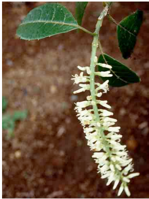
11 Polyosma cyanea GROSSULARIACEAE