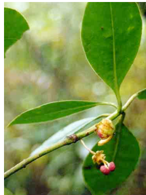
39 Ternstroemia urdanatensis THEACEAE