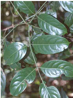
36 Turpinia sp. STAPHYLEACEAE