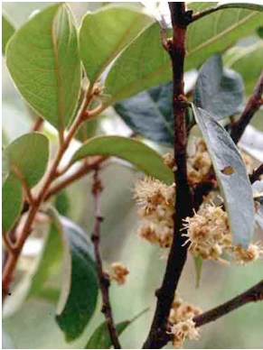
26 Prunus sp. ROSACEAE