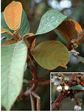
1 Saurauia avellana ACTINIDIACEAE

© Nina R. Ingle and Environmental & Conservation Programs, The Field Museum, Chicago, IL 60605, USA. [RRC@fmnh.org] Rapid Color Guide #48 version 1.1