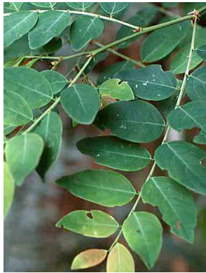
12 Breynia sp. EUPHORBIACEAE