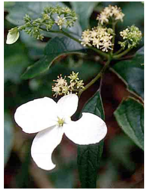
15 Hydrangea scandens HYDRANGEACEAE