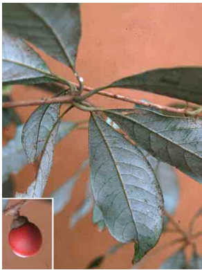
16 Actinodaphne diversifolia LAURACEAE