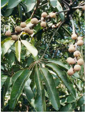
3 Schefflera sp. ARALIACEAE