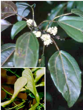
32 Acer laurinum SAPINDACEAE