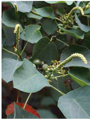
13 Homalanthus populneus EUPHORBIACEAE