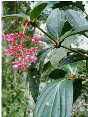
17 Medinilla cumingii MELASTOMATACEAE