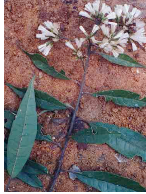
4 Vernonia arborea ASTERACEAE