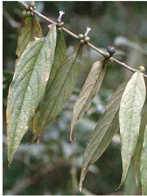
28 Lasianthus sp. RUBIACEAE