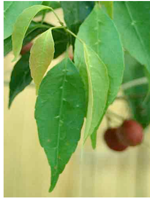
8 Elaeocarpus sp. ELAEOCARPACEAE