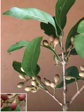
21 Chionanthus sp. OLEACEAE

[RRC@fmnh.org] Rapid Color Guide #48 version 1.1