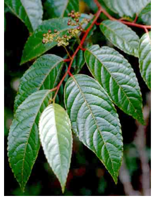
5 Perrottetia alpestris CELASTRACEAE