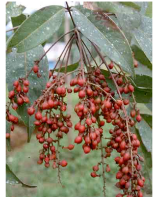
35 Mischocarpus sundaicus SAPINDACEAE