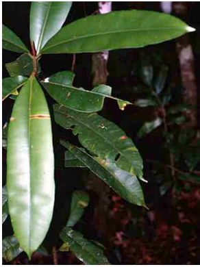
6 Calophyllum sp. CLUSIACEAE