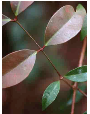
20 Syzygium sp. MYRTACEAE