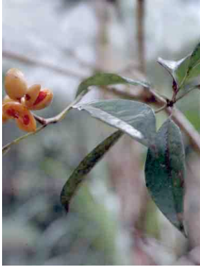
22 Pittosporum moluccanum PITTOSPORACEAE