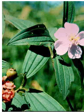
18 Melastoma malabathricum MELASTOMATACEAE