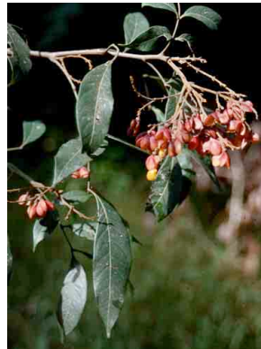
34 Guioa pleuropteris SAPINDACEAE