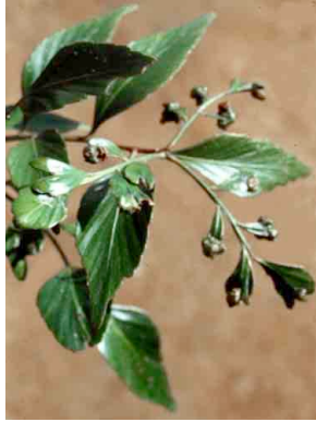
23 Phyllocladus hypophyllus PODOCARPACEAE