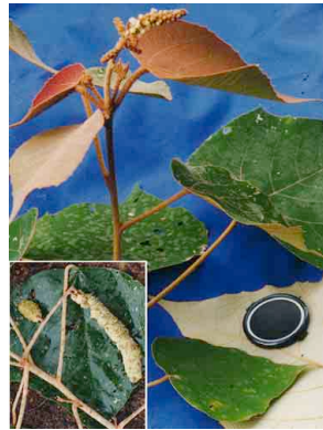
14 Mallotus mollissimus EUPHORBIACEAE