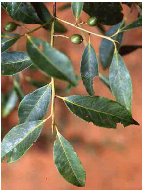
37 Symplocos lucida SYMPLOCACEAE