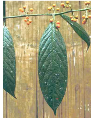
30 Urophyllum sp. RUBIACEAE