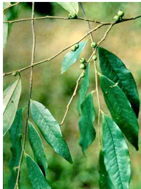
38 Eurya trichocarpa THEACEAE