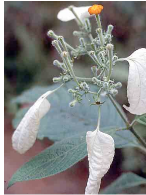
29 Mussaenda sp. RUBIACEAE