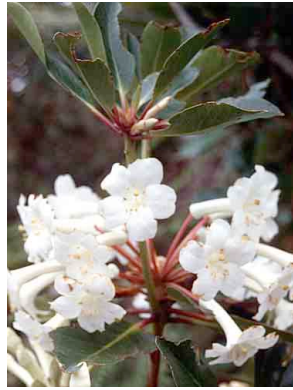
9 Rhododendron kochii ERICACEAE