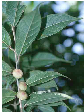
19 Ficus sp. MORACEAE