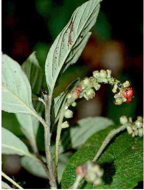
21 Cordia BORAGINACEAE

© Environmental &amp; Conservation Programs, The Field Museum, Chicago, IL 60605 USA. [RRC@fmnh.org] Rapid Color Guide # 61 version 1.2