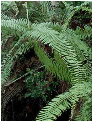
111 Diplazium bancroftii PTERIDOPHYTA