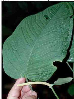
3 Anthurium ARACEAE