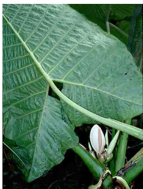
12 Xanthosoma ARACEAE