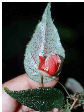
20 Begonia BEGONIACEAE