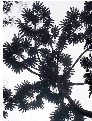
34 Cecropia CECROPIACEAE