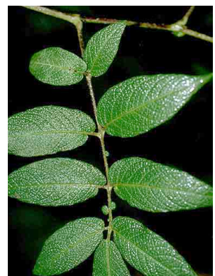
91 Solanum juglandifolium SOLANACEAE