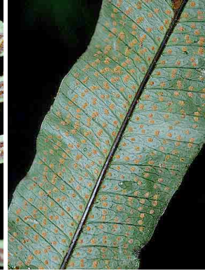
104 Campyloneurum phyllitidis PTERIDOPHYTA