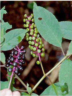
72 Phytolacca rivinoides PHYTOLACCACEAE