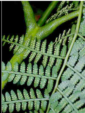
114 Marattia laevis PTERIDOPHYTA