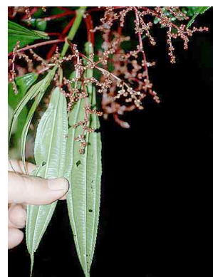
98 Pilea URTICACEAE