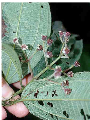
52 Miconia MELASTOMATACEAE