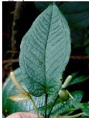
4 Anthurium ARACEAE