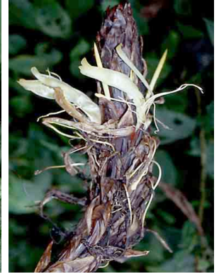
25 Pitcairnea fusca BROMELIACEAE