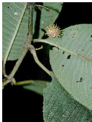
59 Siparuna MONIMIACEAE