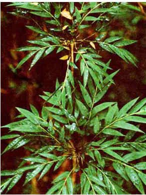
77 Chusquea POACEAE