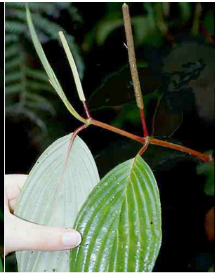
75 Piper PIPERACEAE