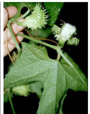
40 Rytidostylis CUCURBITACEAE