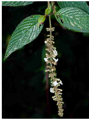
79 Gonzalagunia dependens RUBIACEAE