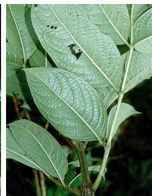
94 Turpinia megaphylla STAPHYLEACEAE