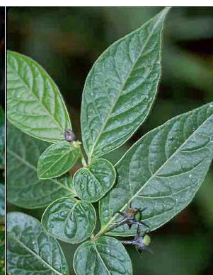
89 Lycianthes SOLANACEAE