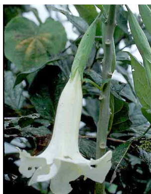
86 Brugmansia candida cf. SOLANACEAE