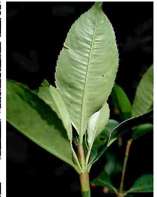
35 Hedyosmum CHLORANTHACEAE