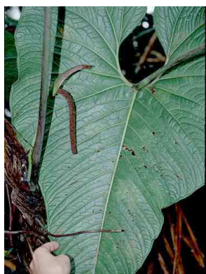
6 Anthurium ARACEAE