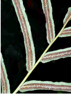
103 Blechnum PTERIDOPHYTA