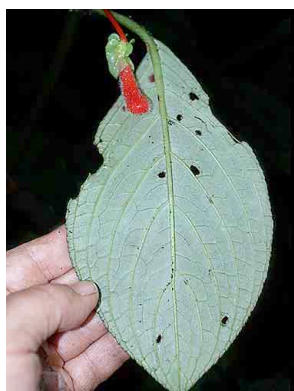
46 Alloplectus GESNERIACEAE