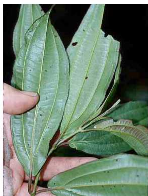
51 Miconia MELASTOMATACEAE