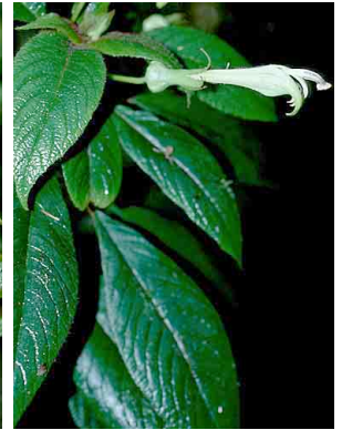
30 Centropogon nigricans CAMPANULACEAE