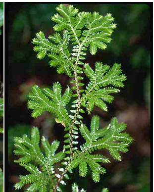
120 Selaginella PTERIDOPHYTA