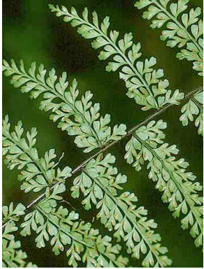
101 Asplenium flabellulatum PTERIDOPHYTA

© Environmental &amp; Conservation Programs, The Field Museum, Chicago, IL 60605 USA. [RRC@fmnh.org] Rapid Color Guide # 61 version 1.2