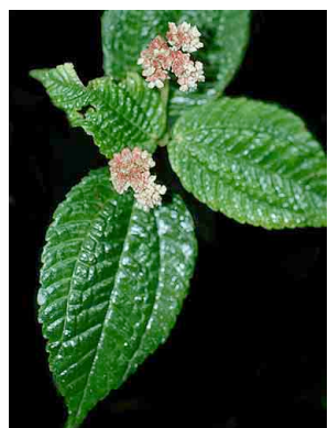
97 Pilea URTICACEAE