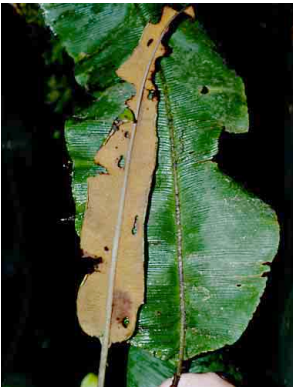
112 Elaphoglossum heliconiifolium PTERIDOPHYTA