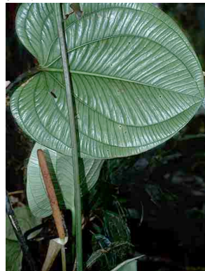
5 Anthurium ARACEAE