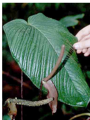
9 Anthurium ARACEAE