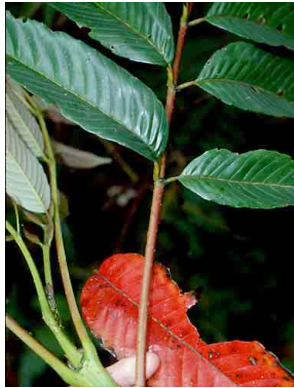
27 Brunellia BRUNELLIACEAE