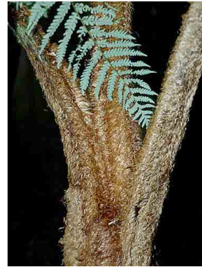
109 Sphaeropteris quindiuensis PTERIDOPHYTA