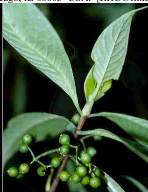
83 Psychotria rugulosa RUBIACEAE