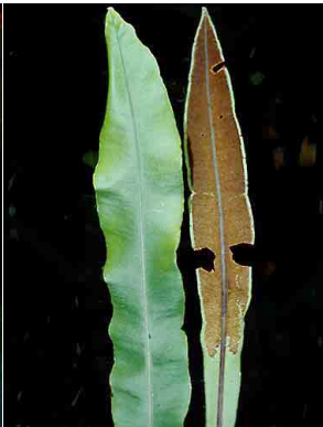
113 Elaphoglossum PTERIDOPHYTA