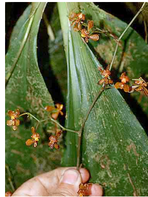
69 Cyrtochilium ORCHIDACEAE