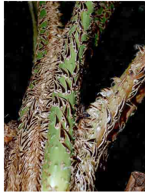
108 Cyathea poeppigii PTERIDOPHYTA