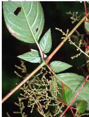
2 Iresine AMARANTHACEAE