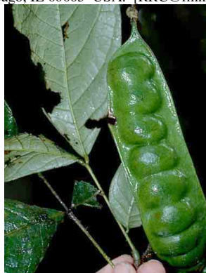
43 Inga lallensis FABACEAE