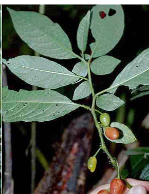
87 Capsicum SOLANACEAE