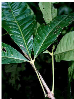
48 Bilia rosea HIPPOCASTANACEAE