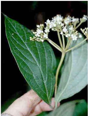
31 Viburnum pichinchense CAPRIFOLIACEAE