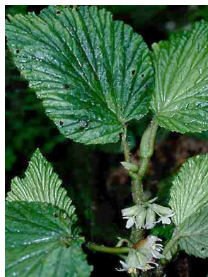
19 Begonia tiliifolia BEGONIACEAE