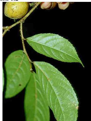
45 Casearia FLACOURTIACEAE