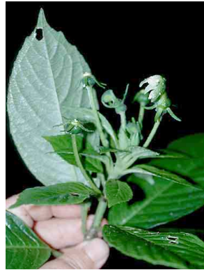
28 Burmeistera lutosa CAMPANULACEAE