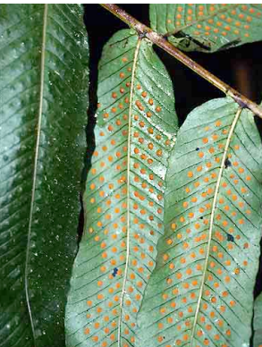
116 Polypodium PTERIDOPHYTA