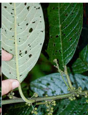
88 Cestrum SOLANACEAE