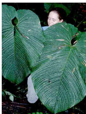
7 Anthurium ARACEAE