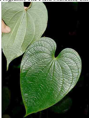
42 Dioscorea DIOSCOREACEAE