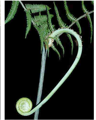
110 Diplazium bancroftii PTERIDOPHYTA