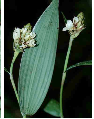
65 Elleanthus ORCHIDACEAE