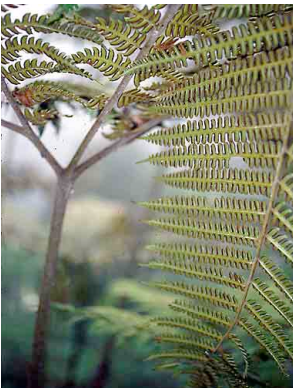
117 Pteris podophylla PTERIDOPHYTA