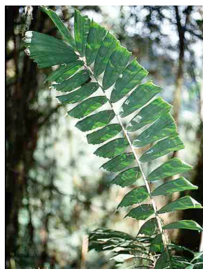
14 Aiphanes ARECACEAE