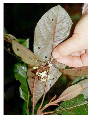
100 Aegiphila VERBENACEAE