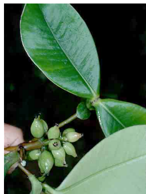
38 Clusia CLUSIACEAE