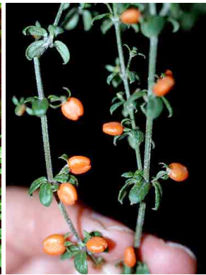
78 Galium hypocarpium RUBIACEAE