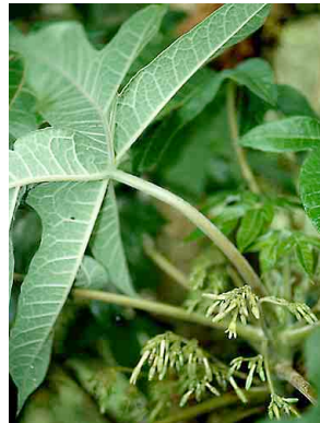
33 Vasconcella cundinamarcensis CARICACEAE