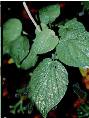
73 Peperomia PIPERACEAE