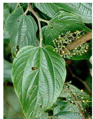
96 Trema micrantha ULMACEAE