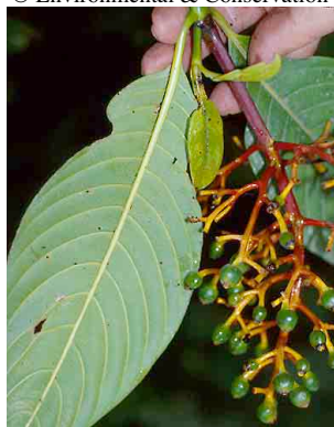
81 Palicourea demissa RUBIACEAE

[RRC@fmnh.org] Rapid Color Guide # 61 version 1.2