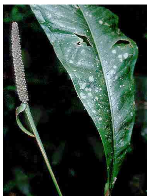
8 Anthurium ARACEAE