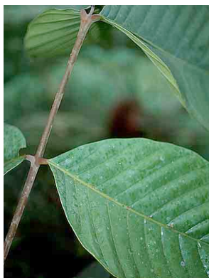
57 Guarea MELIACEAE