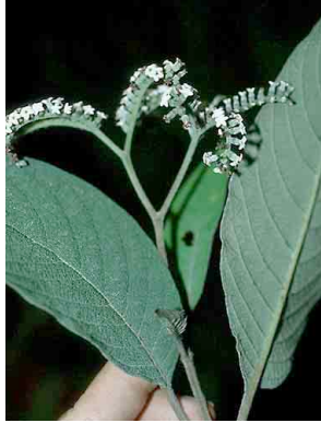
22 Tournefortia BORAGINACEAE