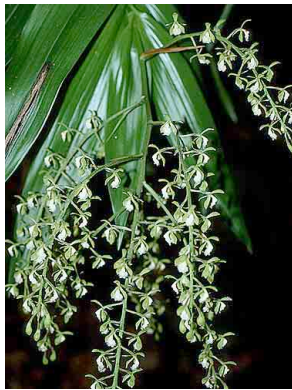
67 Epidendrum ORCHIDACEAE