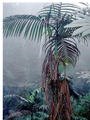
15 Wettinia ARECACEAE