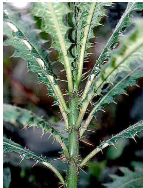
1 Aphelandra acanthus ACANTHACEAE

© Environmental & Conservation Programs, The Field Museum, Chicago, IL 60605 USA. [RRC@fmnh.org] Rapid Color Guide # 61 version 1.2