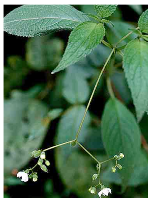
49 Klaprothia mentzelioides LOASACEAE