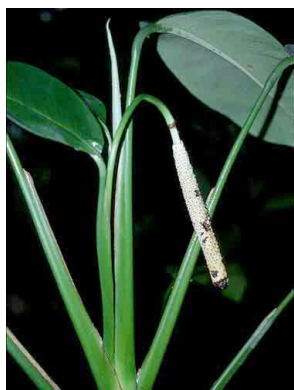
11 Stenospermation ARACEAE