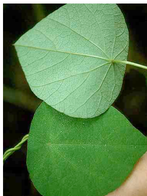
58 Cissampelos MENISPERMACEAE