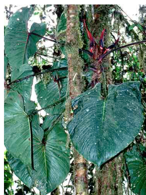
10 Philodendron ARACEAE