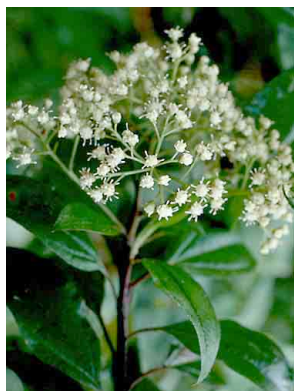
16 Baccharis trinervia ASTERACEAE