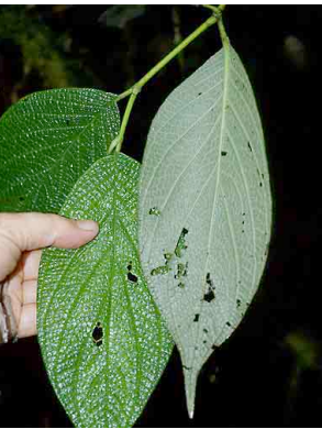
76 Piper PIPERACEAE