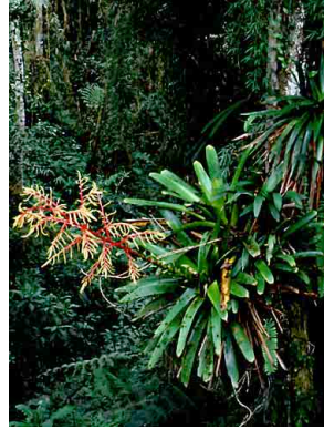
23 Mezobromelia lymansmithii BROMELIACEAE