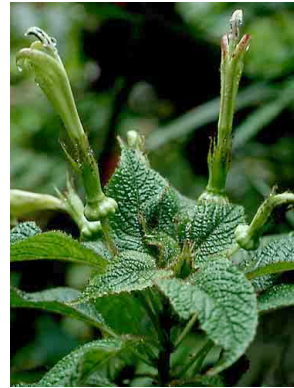
29 Centropogon nigricans CAMPANULACEAE