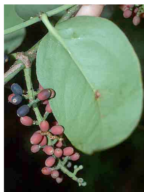
50 Struthanthus LORANTHACEAE