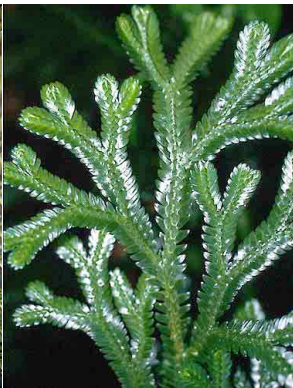
118 Selaginella PTERIDOPHYTA