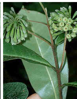
95 Daphnopsis THYMELEACEAE