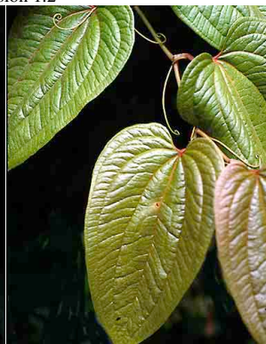
85 Smilax SMILACACEAE