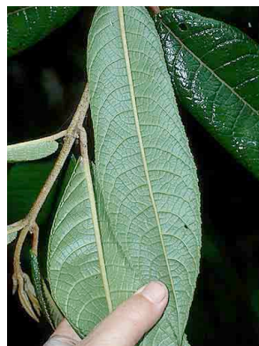
60 Siparuna MONIMIACEAE