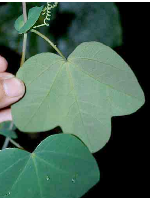
71 Passiflora reticulata PASSIFLORACEAE