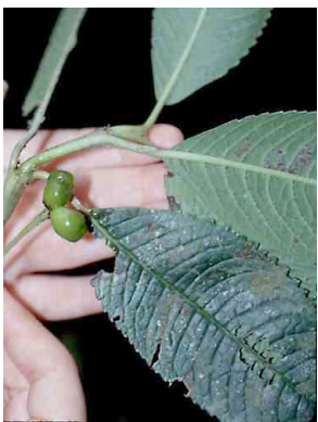
36 Hedyosmum CHLORANTHACEAE