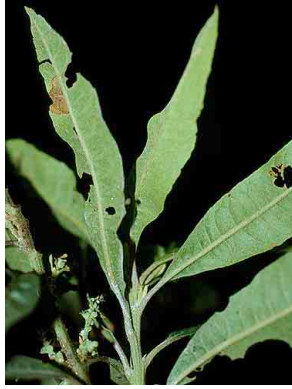
62 Myrica pubescens MYRICACEAE