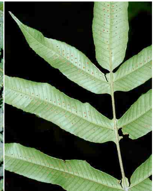
115 Polypodium adnatum PTERIDOPHYTA