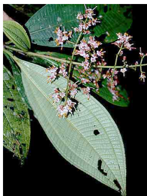
53 Miconia MELASTOMATACEAE