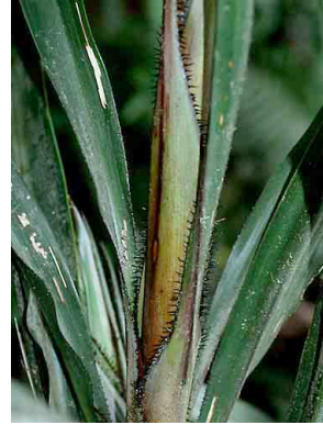
24 Pitcairnea fusca BROMELIACEAE