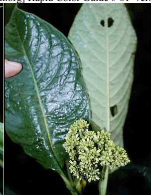
84 Psychotria sp.nov. RUBIACEAE