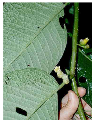
93 Solanum SOLANACEAE