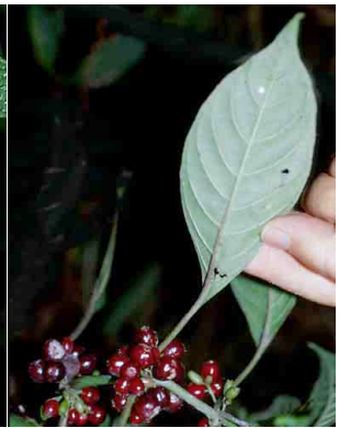
80 Hoffmannia RUBIACEAE