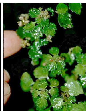
99 Pilea URTICACEAE