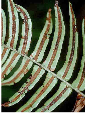
102 Blechnum occidentale PTERIDOPHYTA