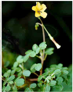
70 Oxalis OXALIDACEAE