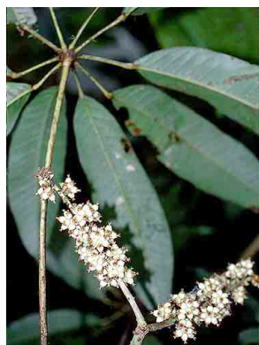
13 Schefflera ARALIACEAE