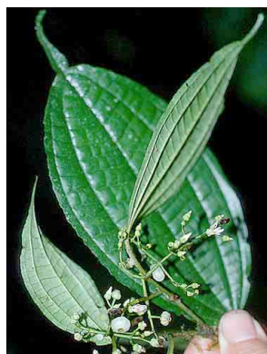
54 Ossaea MELASTOMATACEAE