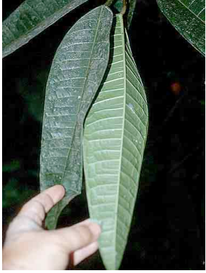
61 Ficus MORACEAE

© Environmental &amp; Conservation Programs, The Field Museum, Chicago, IL 60605 USA. [RRC@fmnh.org] Rapid Color Guide # 61 version 1.2