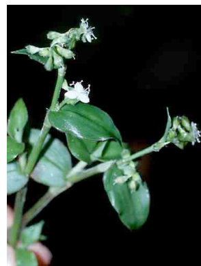
39 Commelina COMMELINACEAE