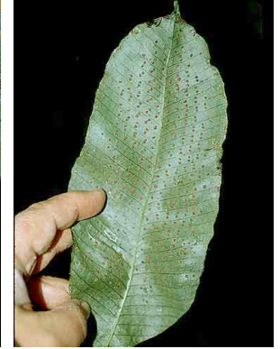
105 Campyloneurum sphenodes PTERIDOPHYTA