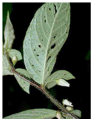
92 Solanum SOLANACEAE