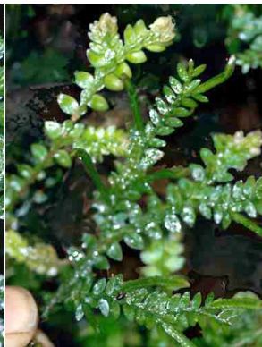
119 Selaginella PTERIDOPHYTA