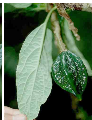
90 Solanum oblongifolium SOLANACEAE