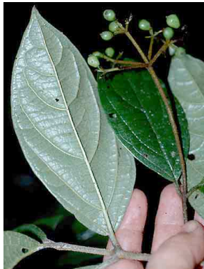
32 Viburnum pichinchense CAPRIFOLIACEAE