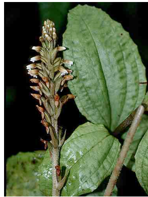
68 Erythrodes ORCHIDACEAE