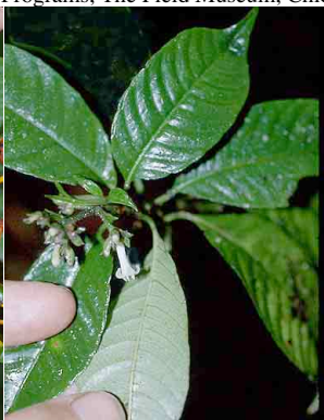
82 Psychotria hazenii RUBIACEAE