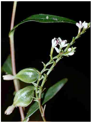
66 Epidendrum fimbriatum ORCHIDACEAE