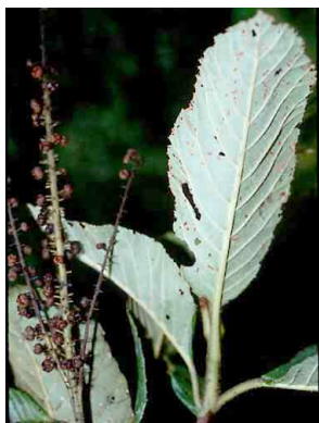
37 Clethra CLETHRACEAE