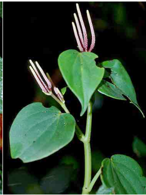
74 Peperomia PIPERACEAE