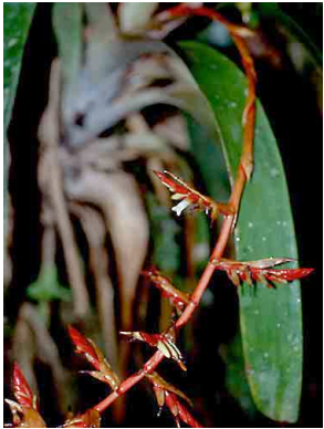
26 Tillandsia truncata BROMELIACEAE