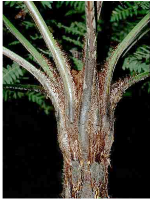
107 [CYATHEACEAE] PTERIDOPHYTA