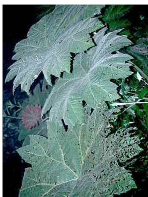
47 Gunnera brephogea GUNNERACEAE