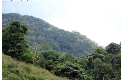
Panoramic view of the montane forest near the MBP (cleared agricultural area in the foreground).