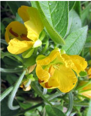
Senna hirsuta JMH 007