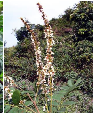
22 Derris robusta FABACEAE-PAPIL.