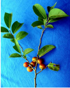
17 ກົກ ຄໍ ແຫບ, ໂກ ແອບ (Kok Khor Hep, Koh Aep)

[fieldguides.fieldmuseum.org] [1078] version 1 01/2019