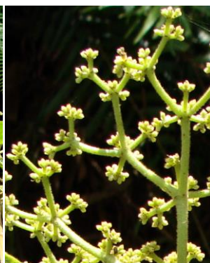
Viburnum sambucinum 14967