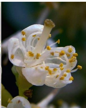
Symplocos lancifolia 14996