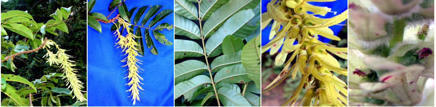
29 ພ່າວ ນາ ຊີ້, ພ່າວ ຮວງ (Phao Na Xee, Phao Huang)

[fieldguides.fieldmuseum.org] [1078] version 1 01/2019