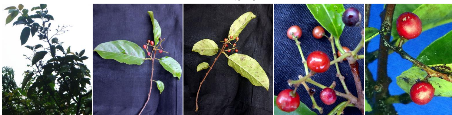
6 ໄຂ່ ມົດ, ນົມ ສາວ (Khai Mod, Nom Sao) Ilex rotunda 14918