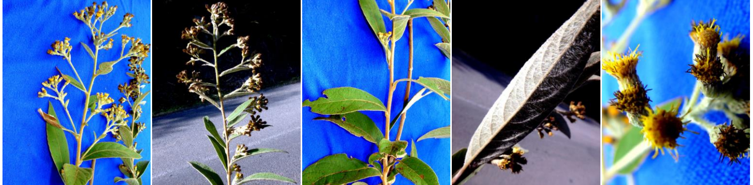
7 ຫາດ ເຫຼອງ, ໂກ ຍິດ ຕັງ (Nat Louang, Kor Yeud Tang)

[fieldguides.fieldmuseum.org] [1078] version 1 01/2019