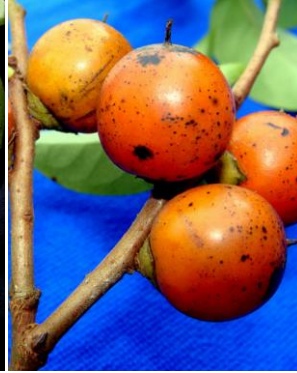
Diospyros hayatae JMH 055