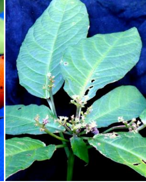
18 ກໍ່ ມ້າ ຕິດ (Kor Ma Did)