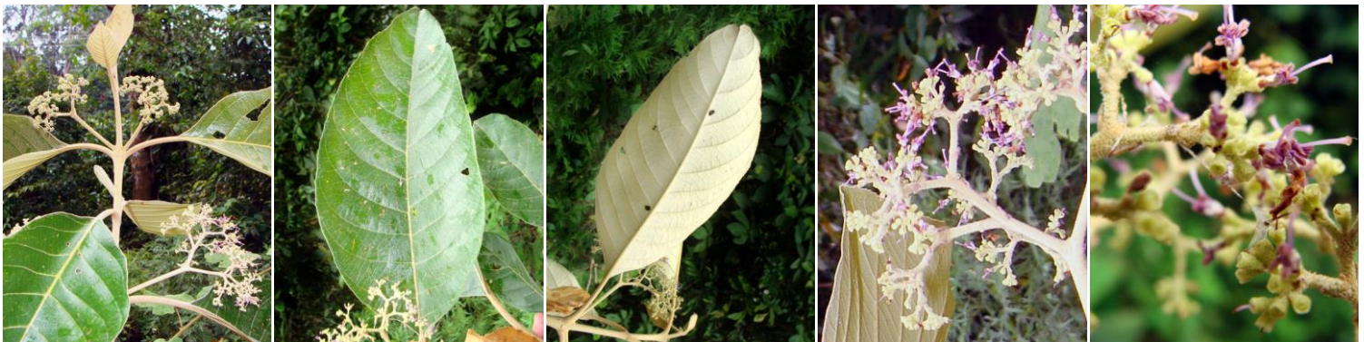
30 ຜ້າ ຮ້າຍ, ກົກ ເປືອກ ຜ້າ (Pha Hay, Kok Peuk Pha)