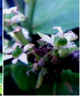
Baliospermum calycinum EUPHORBIACEAE