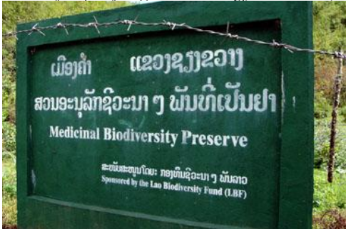
Road sign marking the Xieng Khoang Medicinal Biodiversity Preserve.

[fieldguides.fieldmuseum.org] [1078] version 1 01/2019