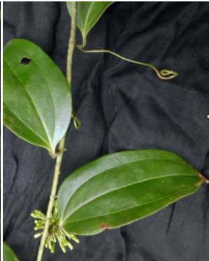
Smilax glabra JMH 033