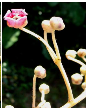
Saurauia napaulensis 14988