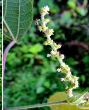
Mallotus macrostachyus 14980