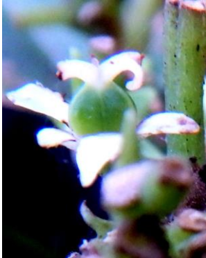
18 Baliospermum calycinum EUPHORBIACEAE