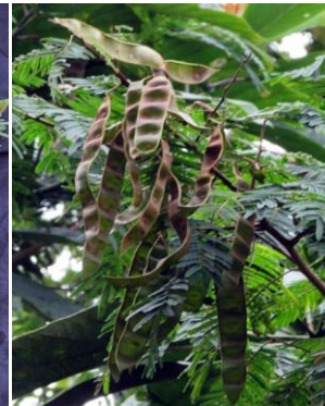
Acacia pennata FABACEAE-MIMOSOIDEAE