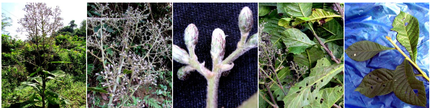
10 ຈ່າງ ຈິດ, ປິດ ເຍ້ຍ (Chang Chued, Pit Pey)