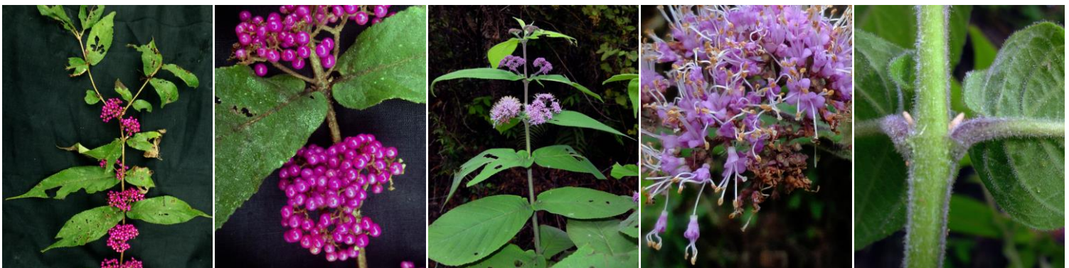
31 ຝາ ນົກ, ກົກ ໝາກ ປັດ, ກົກ ປິດ ເປຍ (Pha Nok, Kok Mak Pat, Kok Pit Pia)