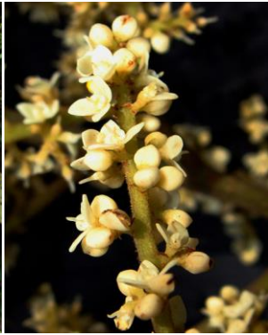
Guioa diplopetala 14975 SAPINDACEAE