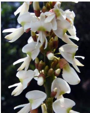
22 ເຄືອ ອອ້ຍ ສາມ ສວນ (Kheua Oy Sam Suan)

Derris robusta 14977 FABACEAE-PAPILIONOIDEAE