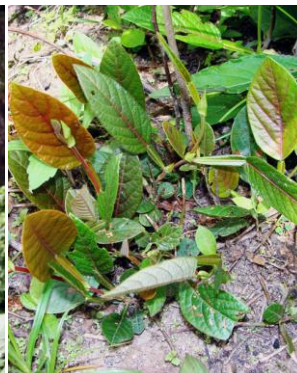
23 ຫໍ່ຍາ ຫນອນ ຫໍ່ຍາຍ (Nha Non Nay)