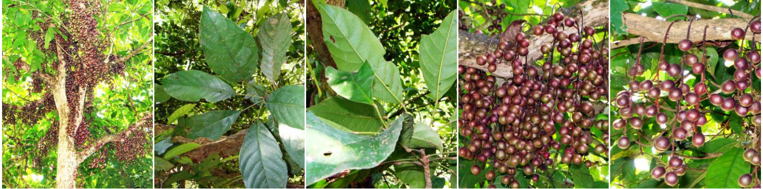
50 ໝາກ ໄໝ່ (Mak Fay)

[fieldguides.fieldmuseum.org] [1078] version 1 01/2019