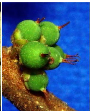
Eurya laotica JMH 039