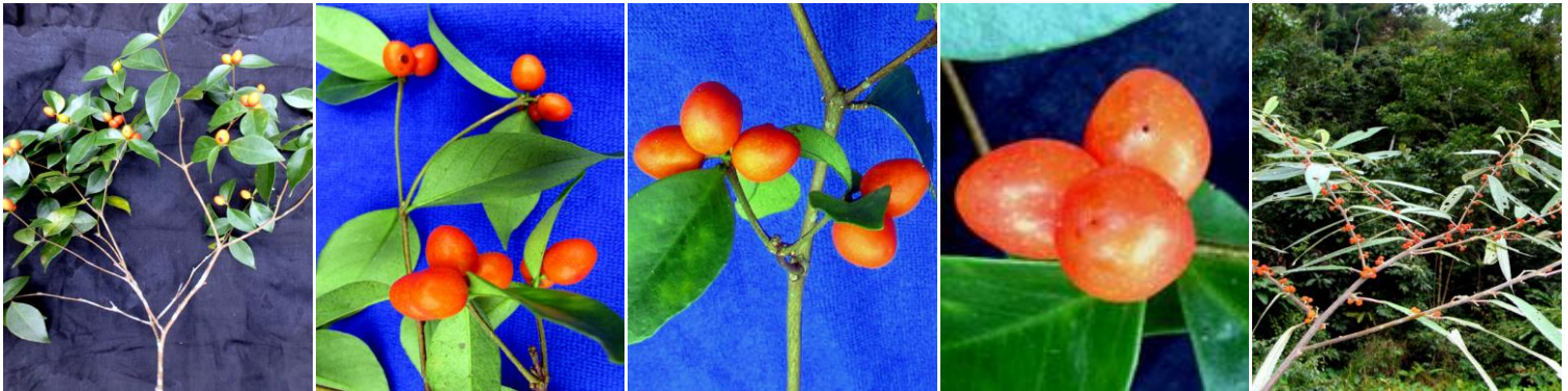
77 ກໍ່ ກໍ່າ ເຫຼືອງ (Kor Ka Leuang)