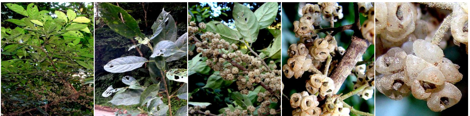
79 ຊ້າ ປານ ໄຫ່ຍ (Xa Pan Nhai)