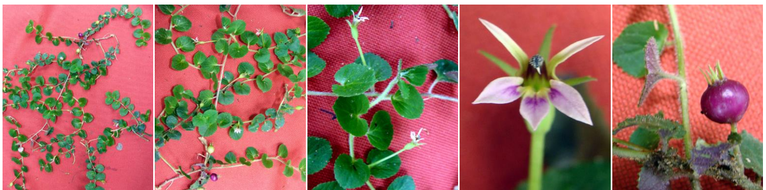
11 ຫ້າຍ ເກັດ ຫອຍ, ຜັກ ລົມ ຜົວ (Nha Ket Hoy, Phak Leum Phua)