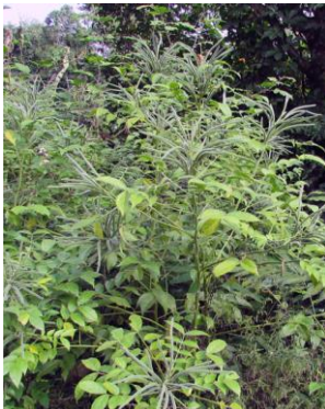
20 ໄລ້ ພິດ (Lai Phit)