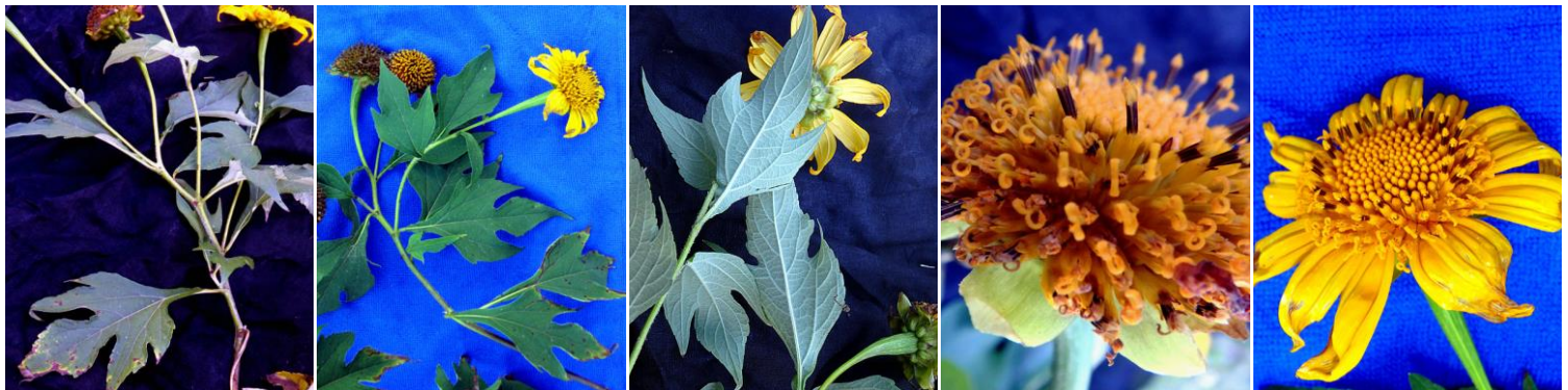
9 ດອກ ບົວ ຕອງ, ດອກ ຕາ ເວ້ນ ຫູ ດອກ ຕາ ເວ້ນ ນ້ອຍ (Dok Bua Tong, Dok Ta Ven Nou, Dok Ta Ven Noy)