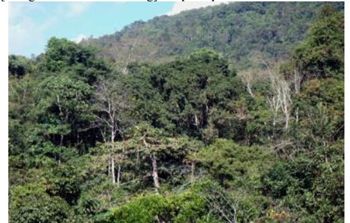
Closer view of the preserve's submontane forest.

The following images represent voucher herbarium specimens preserved at the Herbarium of the Institute of Traditional Medicine (ITM) in Vientiane, Laos, and at the J. D. Searle Herbarium of the Field Museum of Natural History (Chicago, USA). They were collected as part of a project in the discovery of anticancer agents from plants. Collections were made in the submontane forest of northeastern Laos (1000-1200 m above sea level; and a GPS reading of 19°43' N; 103°35' E) in the province of Xieng Khoang, about 65 km from Xieng Khoang capital city of Phonsavanh, specifically, within the protected forest designated by the Ministry of Health as “Medicinal Biodiversity Preserve” (MBP). Sporadic collections were also made along the roadsides in the protected area and in the edges of forest and in semi-open forest bordering the more intact forest cover. Part of the collections was made during the dry season (May), and part during the beginning of the dry season (December).