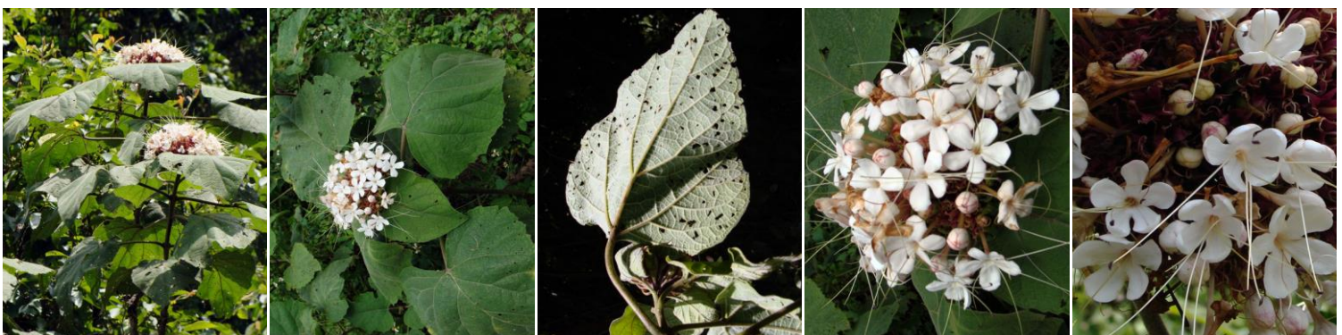
32 ພວງ ພີ່ ຂາວ (Phuong Phee Khao)