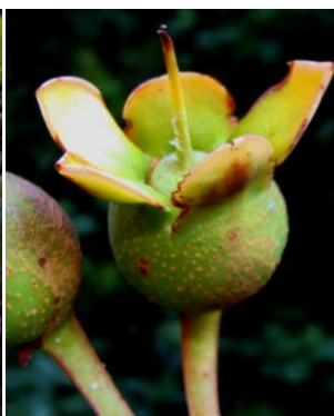
ແກ້ມ ອັນ (Kem Onh) Anneslea fragrans JMH 061 THEACEAE [=PENTAPHYLACACEAE]