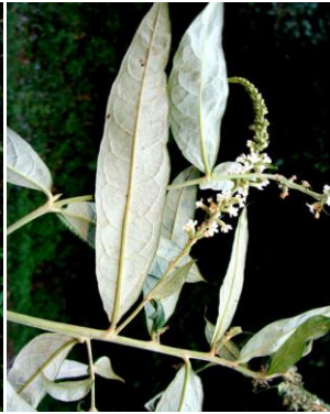
ດອກ ຟອນ, ໝາດ ນໍ້າ (Dok Fon, Nat Nam) SCROPHULARIACEAE