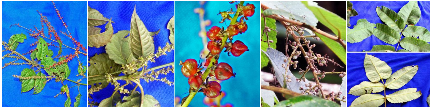
3 ເຄືອ ຫັນ ແດງ (Kheua Han Deng) Deeringia amaranthoides JMH 060 AMARANTHACEAE

[fieldguides.fieldmuseum.org] [1078] version 1 01/2019