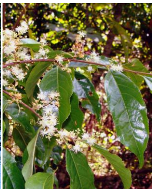
ກົກ ໜັງ ລອກ, ເໝືອດ ນ້ອຍ (Kok Nang Lok, Meuat Noy)