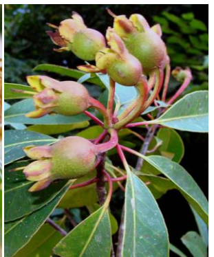
74 Anneslea fragrans THEACEAE [=PENTAPHYL.]