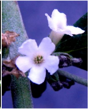
Buddleja asiatica JMH 055