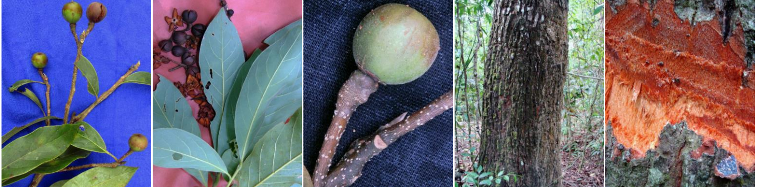
76 ຄາຍ ໄຊ້, ໝີ່ ຄາຍ (Khai Xo, Mee Khai)

[fieldguides.fieldmuseum.org] [1078] version 1 01/2019