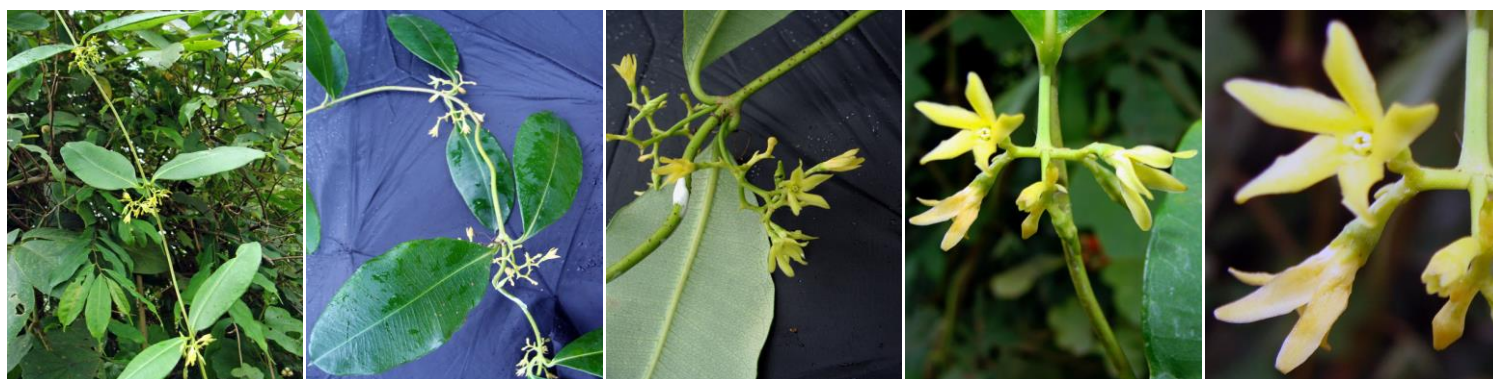
5 ເຄືອ ເອ້ນ ອ່ອນ (Kheua En Onh) Cryptolepis dubia 14971