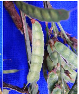
Tadehagi triquetrum 14992