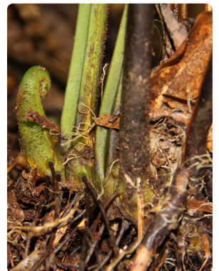
51 Dennstaedtia cicutaria DENNSTAEDTIACEAE