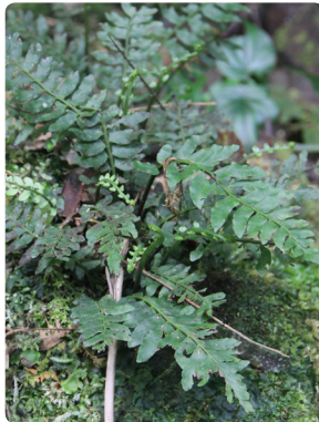
14 Hymenasplenium triquetrum ASPLENIACEAE