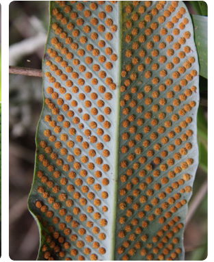
123 Niphidium crassifolium POLYPODIACEAE