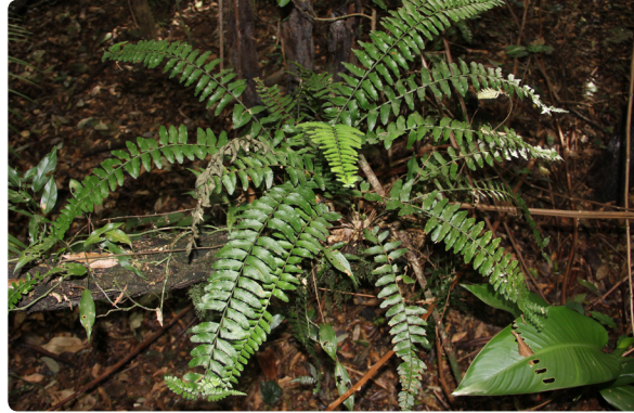
3 Asplenium kunzeanum ASPLENIACEAE