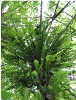
127 Pecluma truncorum POLYPODIACEAE