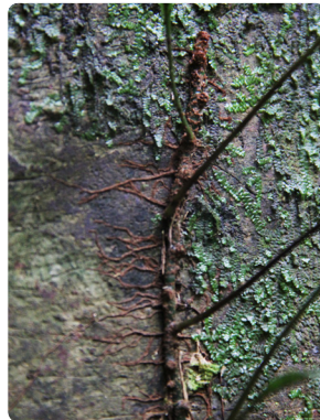
116 Campyloneurum minus POLYPODIACEAE