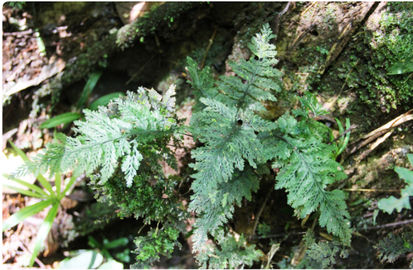
74 Abrodictyum rigidum HYMENOPHYLLACEAE