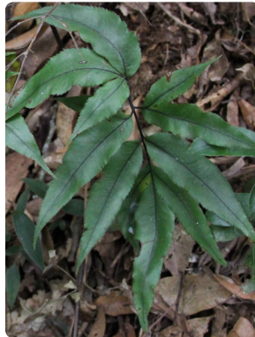
144 Pteris denticulata PTERIDACEAE