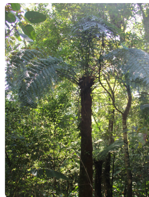
54 Dicksonia sellowiana DICKSONIACEAE