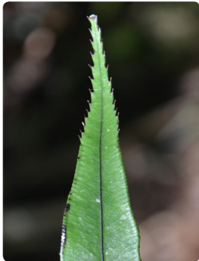
143 Pteris denticulata PTERIDACEAE