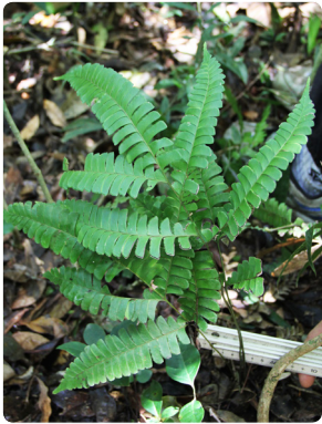
90 Lindsaea lancea LINDSAEACEAE