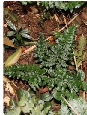
7 Asplenium martianum ASPLENIACEAE