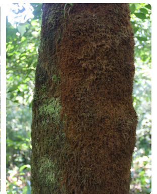
55 Dicksonia sellowiana DICKSONIACEAE