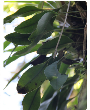
64 Elaphoglossum lingua DRYOPTERIDACEAE