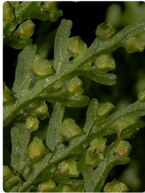
78 Hymenophyllum caudiculatum HYMENOPHYLLACEAE