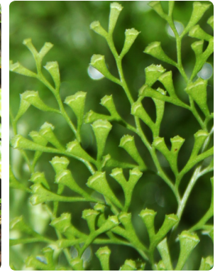
89 Lindsaea bifida LINDSAEACEAE