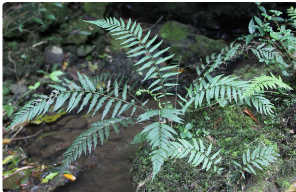
148 Amauropelta ptarmica THELYPTERIDACEAE