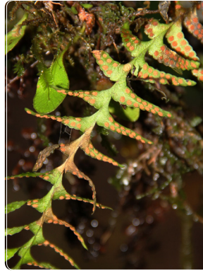
121 Lellingeria depressa POLYPODIACEAE