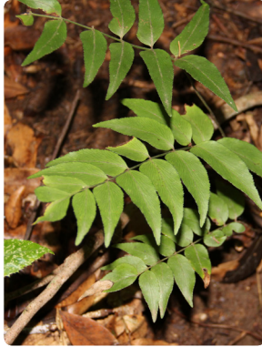
2 Anemia phyllitidis ANEMIAEAE