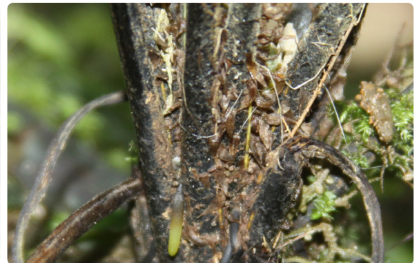
150 Amauropelta ptarmica THELYPTERIDACEAE