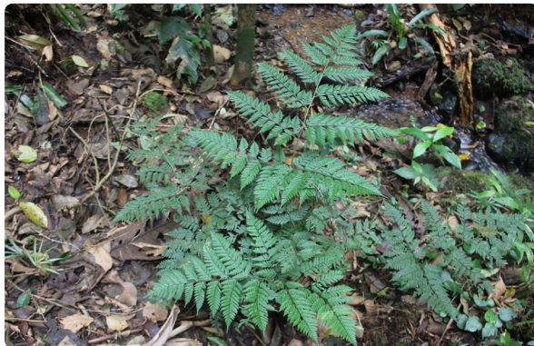
65 Lastreopsis amplissima DRYOPTERIDACEAE