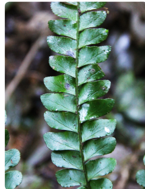
58 Didymochlaena truncatula DIDYMOCHLAENACEAE