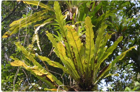
124 Niphidium crassifolium POLYPODIACEAE