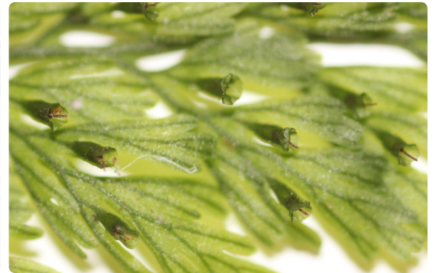
85 Vandenboschia radicans HYMENOPHYLLACEAE