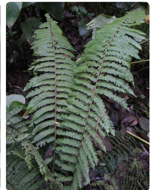
59 Ctenitis anniesii DRYOPTERIDACEAE