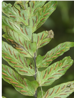
15 Hymenasplenium triquetrum ASPLENIACEAE