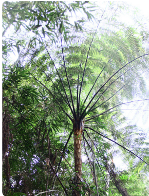
44 Cyathea delgadii CYATHEACEAE