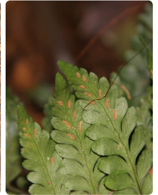
8 Asplenium martianum ASPLENIACEAE