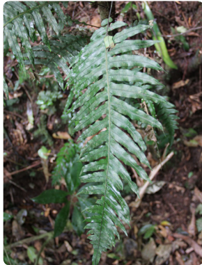
22 Lomaridium plumieri BLECHNACEAE