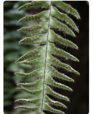
114 Alansmia reclinata POLYPODIACEAE