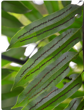
43 Cyathea corcovadensis CYATHEACEAE