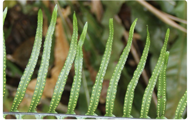
126 Pecluma pectinatiformis POLYPODIACEAE