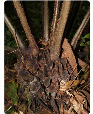
110 Marattia cicutifolia MARATTIACEAE