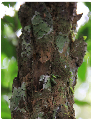
48 Cyathea phalerata CYATHEACEAE