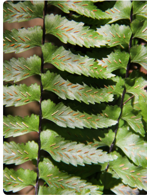
6 Asplenium barpeodes ASPLENIACEAE