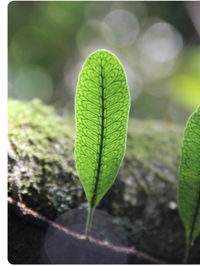
122 Microgramma squamulosa POLYPODIACEAE