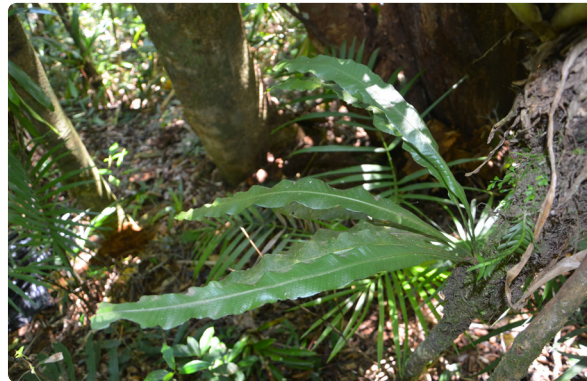
117 Campyloneurum nitidum POLYPODIACEAE