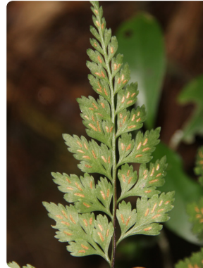
10 Asplenium pseudonitidum ASPLENIACEAE