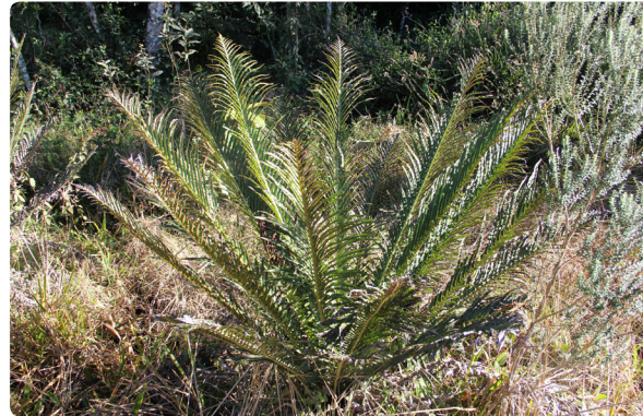
23 Neoblechnum brasiliense BLECHNACEAE