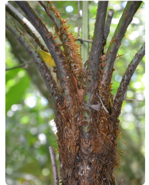
42 Cyathea corcovadensis CYATHEACEAE