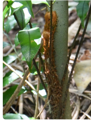
105 Lomariopsis marginata LOMARIOPSIDACEAE