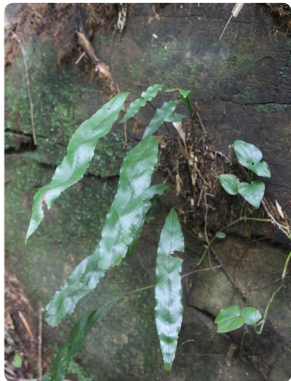
115 Campyloneurum minus POLYPODIACEAE