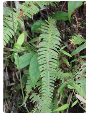
32 Blechnum occidentale BLECHNACEAE