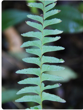
87 Lindsaea arcuata LINDSAEACEAE