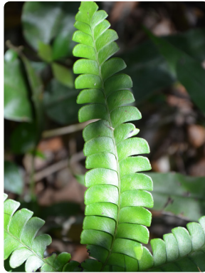
91 Lindsaea lancea LINDSAEACEAE