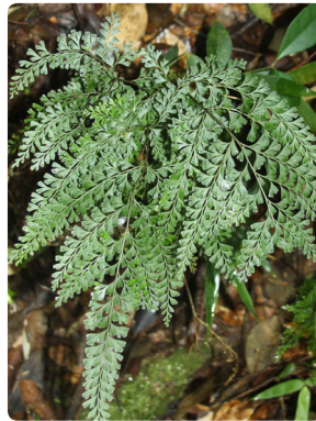
100 Lindsaea virescens var. catbarinae LINDSAEACEAE