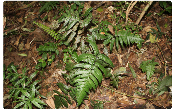
16 Diplazium cristatum ATHYRIACEAE