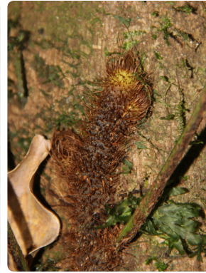
71 Polybotrya cilindrica DRYOPTERIDACEAE