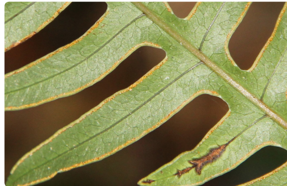
141 Pteris decurecens PTERIDACEAE