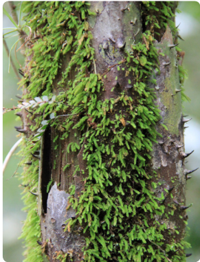
38 Alsophila setosa CYATHEACEAE