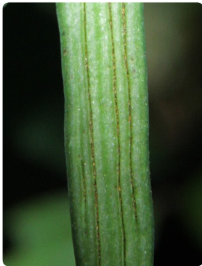
136 Polytaenium lineatum PTERIDACEAE