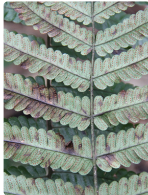
62 Ctenitis pedicellata DRYOPTERIDACEAE