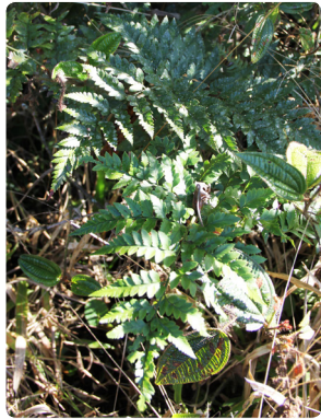
73 Rumohra adiantiformis DRYOPTERIDACEAE