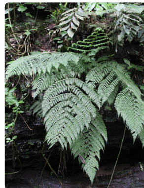
50 Dennstaedtia cicutaria DENNSTAEDTIACEAE