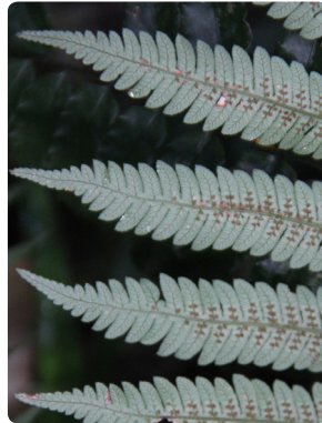
40 Alsophila setosa CYATHEACEAE