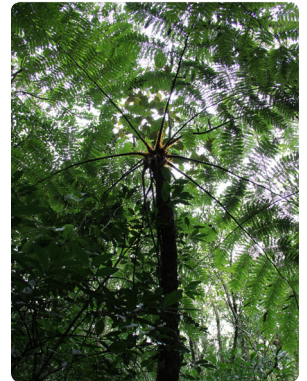
47 Cyathea phalerata CYATHEACEAE