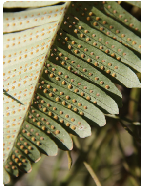
133 Serpocaulon catharinae POLYPODIACEAE