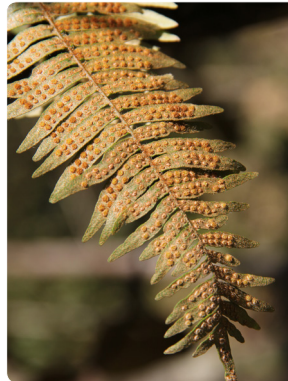
130 Pleopeltis hirsutissima POLYPODIACEAE