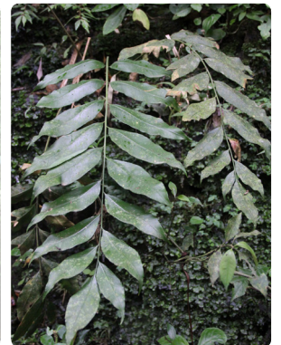
68 Olfersia cervina DRYOPTERIDACEAE