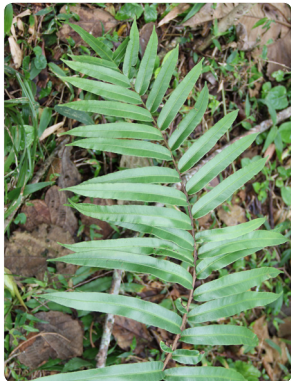
25 Parablechnum cordatum BLECHNACEAE