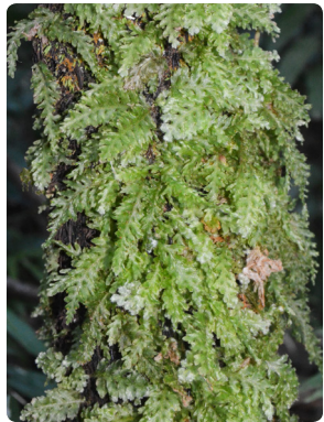
82 Trichomanes polypodioides HYMENOPHYLLACEAE