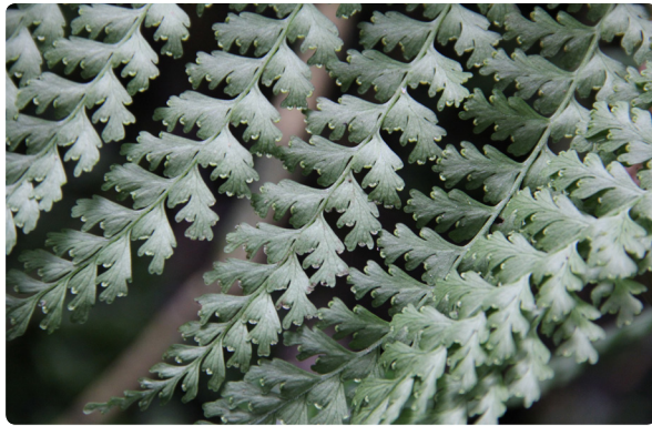
52 Dennstaedtia cicutaria DENNSTAEDTIACEAE