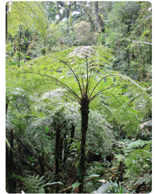
37 Alsophila setosa CYATHEACEAE