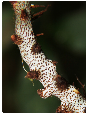
134 Serpocaulon catharinae POLYPODIACEAE