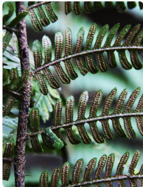
60 Ctenitis anniesii DRYOPTERIDACEAE