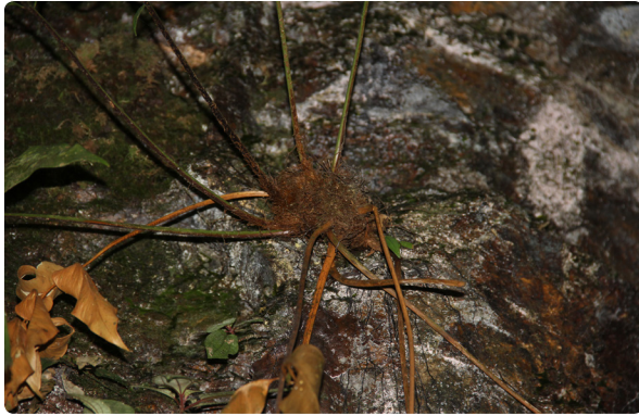
69 Olfersia cervina DRYOPTERIDACEAE