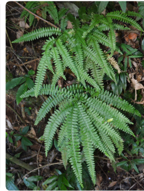
96 Lindsaea quadrangularis subsp. terminalis LINDSAEACEAE