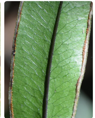
142 Pteris denticulata PTERIDACEAE