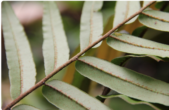
26 Parablechnum cordatum BLECHNACEAE