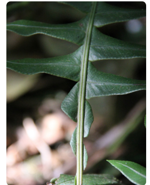
28 Austroblechnum divergens BLECHNACEAE