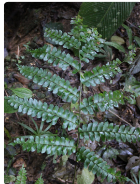
57 Didymochlaena truncatula DIDYMOCHLAENACEAE