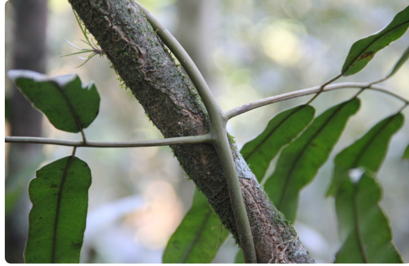
36 Salpichlaena volubilis BLECHNACEAE