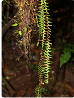
120 Lellingeria depressa POLYPODIACEAE