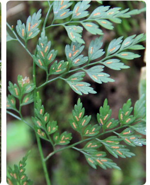
12 Asplenium scandicicum ASPLENIACEAE