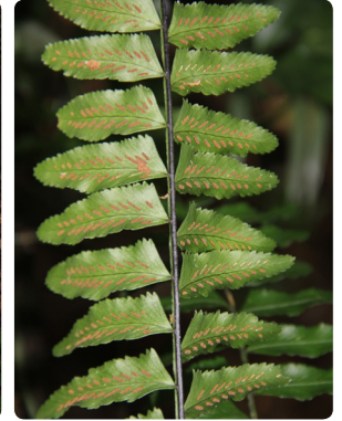
4 Asplenium kunzeanum ASPLENIACEAE