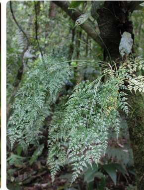
11 Asplenium scandicicum ASPLENIACEAE