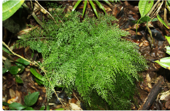
88 Lindsaea bifida LINDSAEACEAE