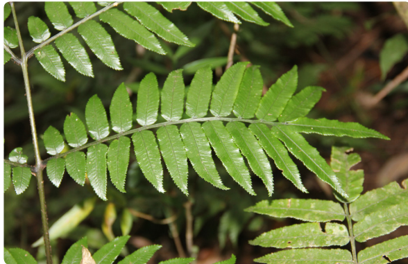
111 Marattia cicutifolia MARATTIACEAE