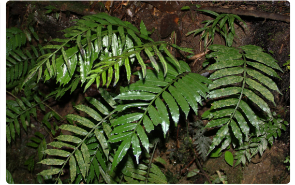
106 Danaea moritziana MARATTIACEAE