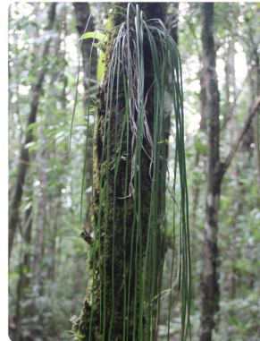
145 Vittaria lineata PTERIDACEAE