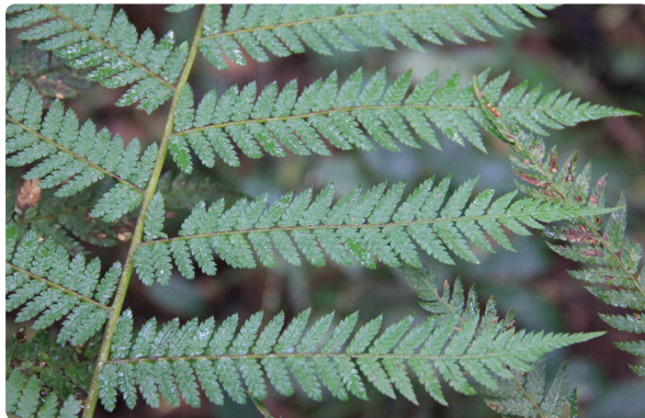
56 Dicksonia sellowiana DICKSONIACEAE