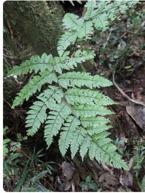
70 Polybotrya cilindrica DRYOPTERIDACEAE