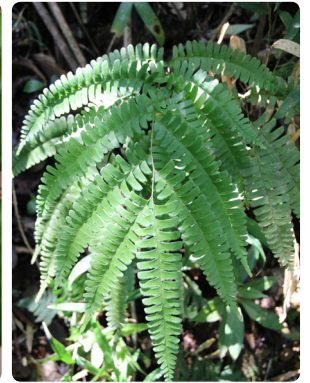
93 Lindsaea quadrangularis subsp. quadrangularis LINDSAEACEAE