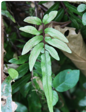
29 Blechnum gracile BLECHNACEAE