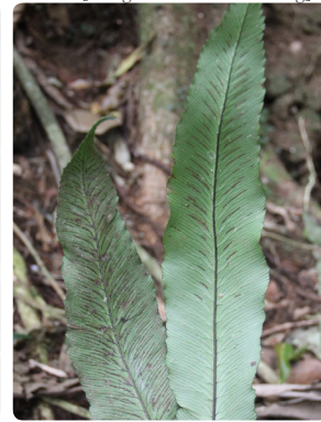
19 Diplazium plantaginifolium ATHYRIACEAE