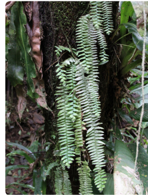
113 Alansmia reclinata POLYPODIACEAE