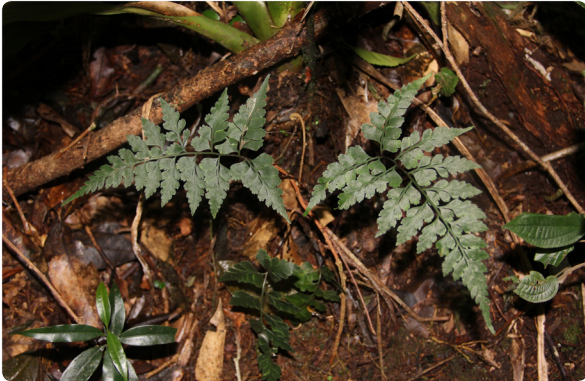
9 Asplenium pseudonitidum ASPLENIACEAE