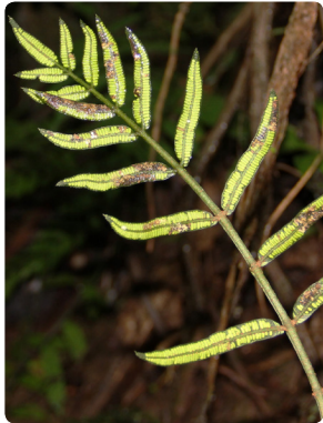
107 Danaea moritziana MARATTIACEAE