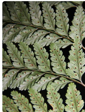
66 Lastreopsis amplissima DRYOPTERIDACEAE