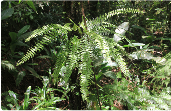
5 Asplenium barpeodes ASPLENIACEAE