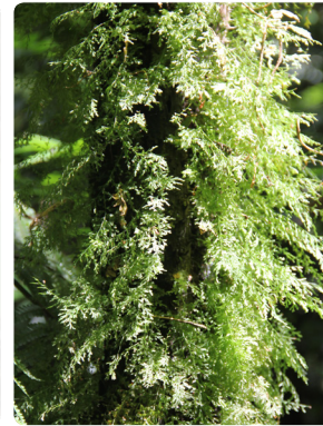
80 Polyplebium angustatum HYMENOPHYLLACEAE