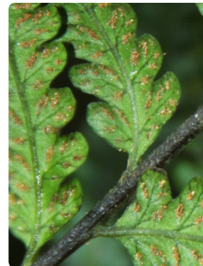
149 Amauropelta ptarmica THELYPTERIDACEAE