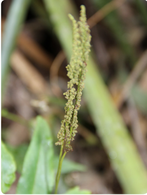
1 Anemia phyllitidis ANEMIAEAE