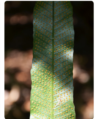
118 Campyloneurum nitidum POLYPODIACEAE