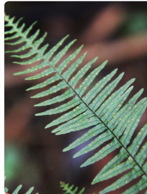
128 Pecluma truncorum POLYPODIACEAE