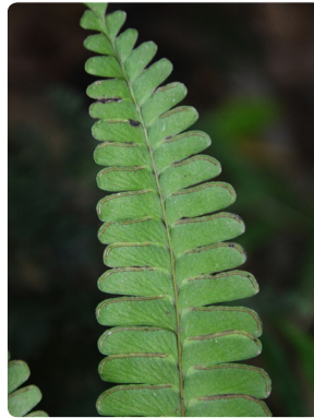
95 Lindsaea quadrangularis subsp. quadrangularis LINDSAEACEAE