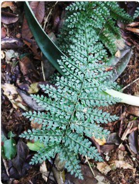
13 Asplenium uniseriale ASPLENIACEAE