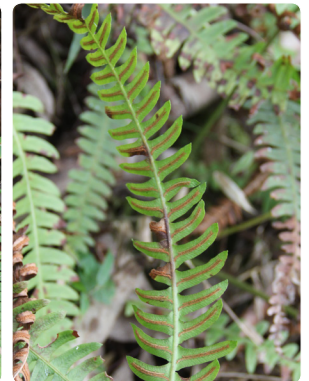
33 Blechnum occidentale BLECHNACEAE