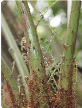
39 Alsophila setosa CYATHEACEAE