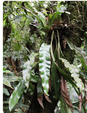
63 Elaphoglossum glaziovii DRYOPTERIDACEAE