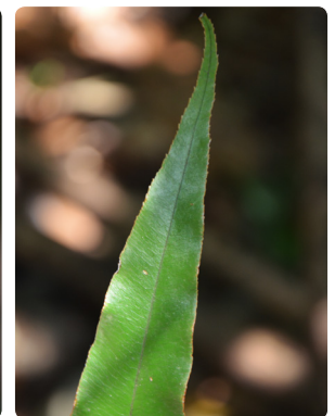
139 Pteris brasiliensis PTERIDACEAE