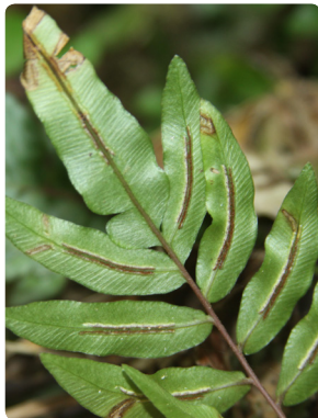
30 Blechnum gracile BLECHNACEAE