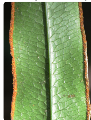
138 Pteris brasiliensis PTERIDACEAE