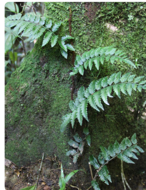
67 Mickelia scandens DRYOPTERIDACEAE