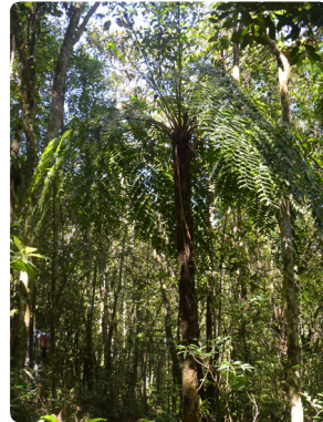
41 Cyathea corcovadensis CYATHEACEAE