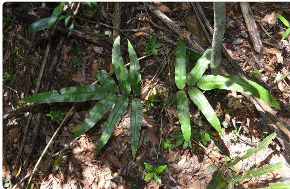
137 Pteris brasiliensis PTERIDACEAE