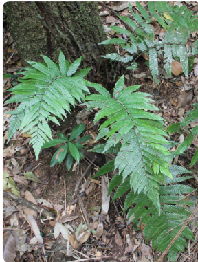
61 Ctenitis pedicellata DRYOPTERIDACEAE