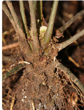
108 Danaea moritziana MARATTIACEAE