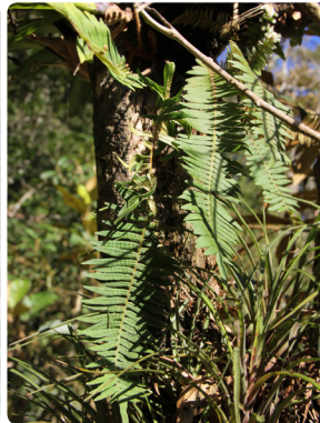
129 Pleopeltis hirsutissima POLYPODIACEAE