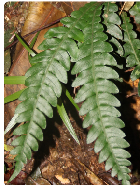
31 Austroblechnum lehmannii BLECHNACEAE