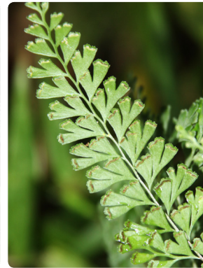
101 Lindsaea virescens var. catbarinae LINDSAEACEAE