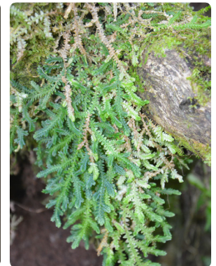
147 Selaginella flexuosa SELAGINELLACEAE