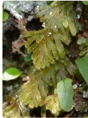
79 Hymenophyllum fragile HYMENOPHYLLACEAE