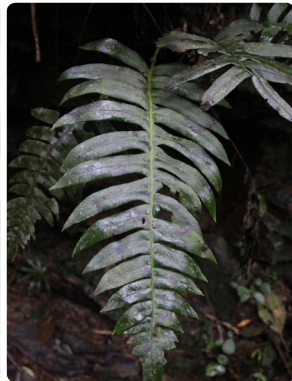
27 Austroblechnum divergens BLECHNACEAE