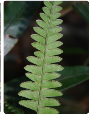
97 Lindsaea quadrangularis subsp. terminalis LINDSAEACEAE