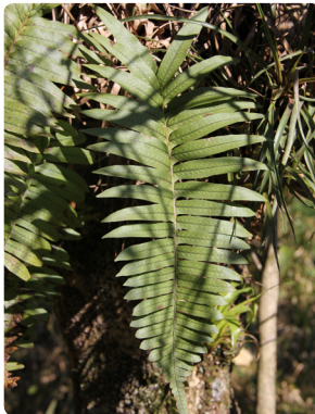
132 Serpocaulon catharinae POLYPODIACEAE