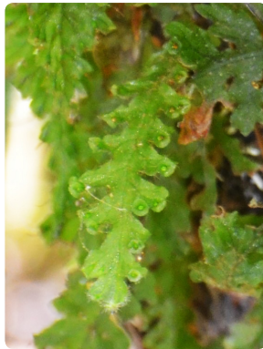
83 Trichomanes polypodioides HYMENOPHYLLACEAE