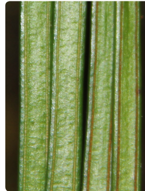
146 Vittaria lineata PTERIDACEAE