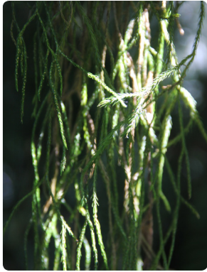
103 Phlegmariurus comans LYCOPODIACEAE