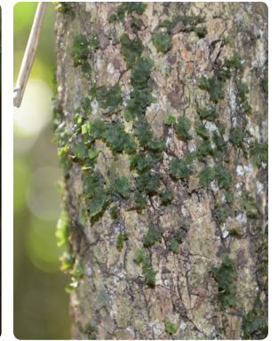
76 Didymoglossum hymenoides HYMENOPHYLLACEAE