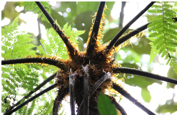
49 Cyathea phalerata CYATHEACEAE