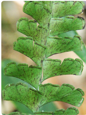
99 Lindsaea virescens var. virescens LINDSAEACEAE