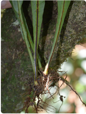
119 Campyloneurum nitidum POLYPODIACEAE