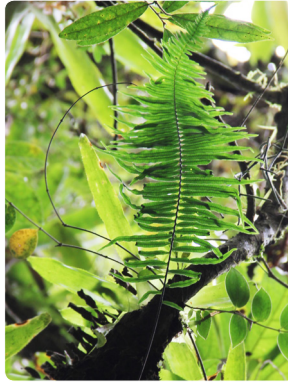
125 Pecluma pectinatiformis POLYPODIACEAE