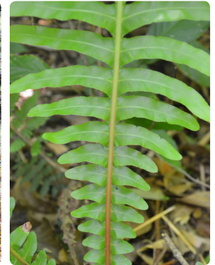
24 Neoblechnum brasiliense BLECHNACEAE