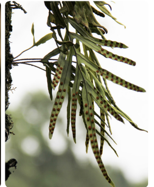
131 Pleopeltis pleopeltifolia POLYPODIACEAE