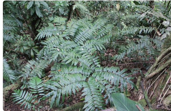
109 Marattia cicutifolia MARATTIACEAE