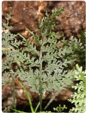
77 Hymenophyllum caudiculatum HYMENOPHYLLACEAE