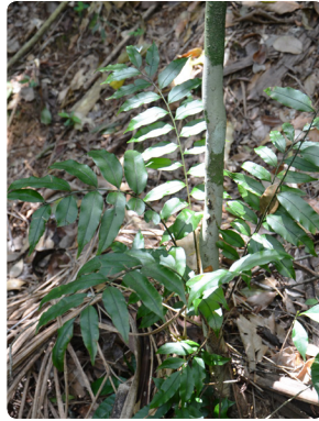
104 Lomariopsis marginata LOMARIOPSIDACEAE