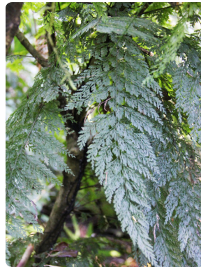
84 Vandenboschia radicans HYMENOPHYLLACEAE