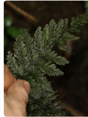
75 Abrodictyum rigidum HYMENOPHYLLACEAE