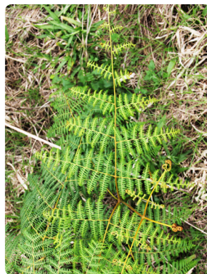
53 Pteridium arachnoideum DENNSTAEDTIACEAE