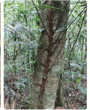
72 Polybotrya cilindrica DRYOPTERIDACEAE