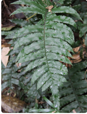
34 Cranfillia mucronata BLECHNACEAE