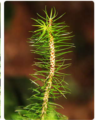
102 Phlegmariurus mandiocanus LYCOPODIACEAE