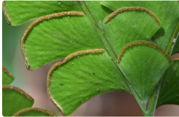
92 Lindsaea lancea LINDSAEACEAE