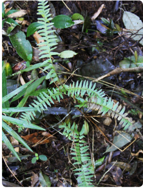
86 Lindsaea arcuata LINDSAEACEAE