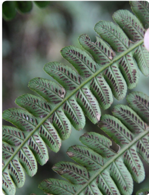
21 Diplazium rostratum ATHYRIACEAE