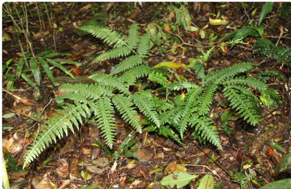
140 Pteris decurecens PTERIDACEAE