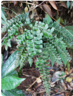
98 Lindsaea virescens var. virescens LINDSAEACEAE