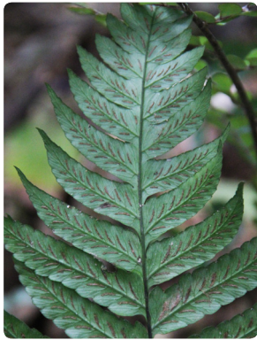
17 Diplazium cristatum ATHYRIACEAE