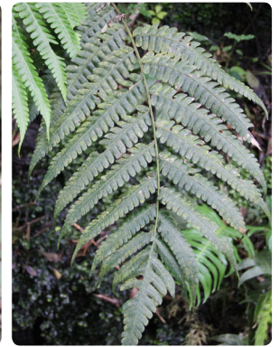
20 Diplazium rostratum ATHYRIACEAE