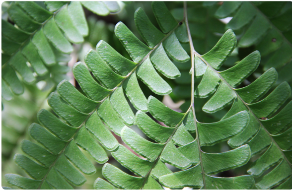
94 Lindsaea quadrangularis subsp. quadrangularis LINDSAEACEAE