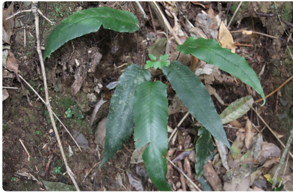
18 Diplazium plantaginifolium ATHYRIACEAE