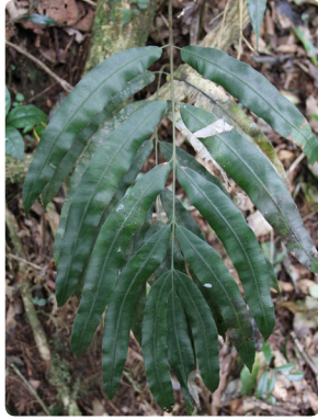
35 Salpichlaena volubilis BLECHNACEAE