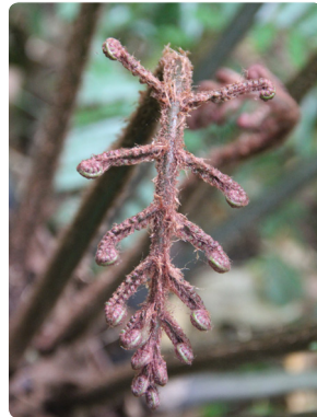
112 Marattia cicutifolia MARATTIACEAE