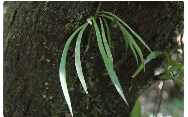
135 Polytaenium lineatum PTERIDACEAE