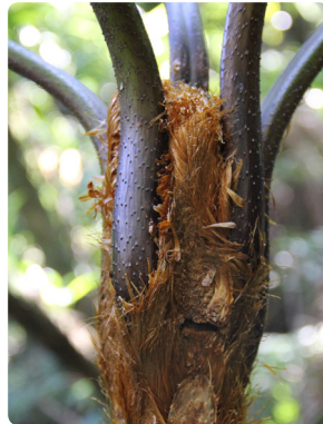
45 Cyathea delgadii CYATHEACEAE