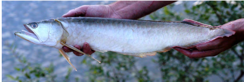
Osteoglossum bicirrhosum Arawana