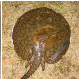
Potamotrygon cf. orbignyi