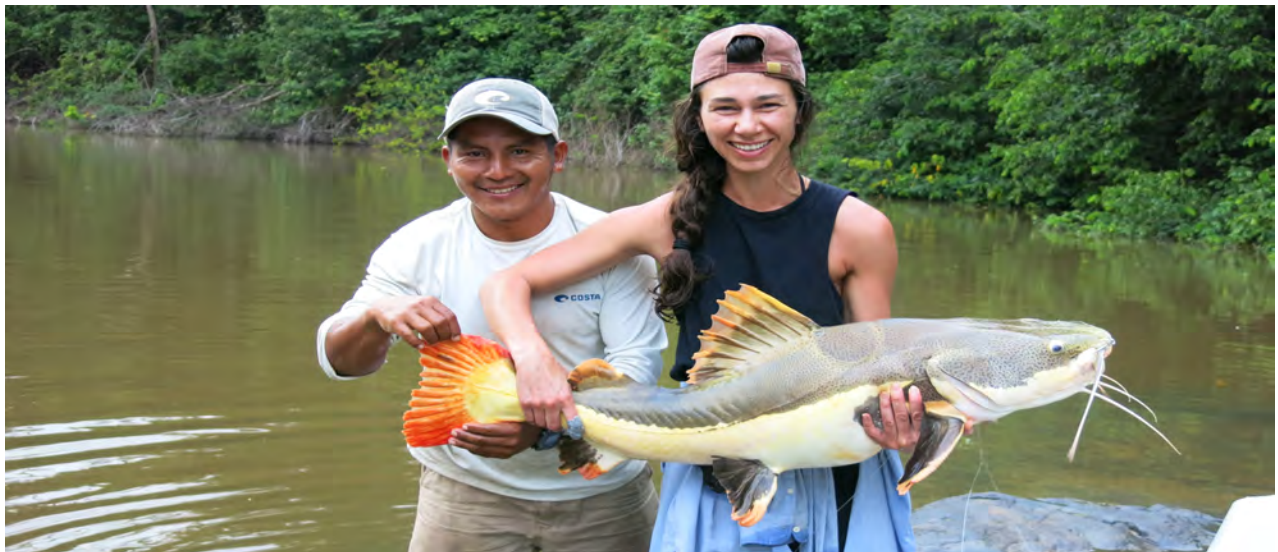
Phractocephalus hemiliopterus Banana Catfish