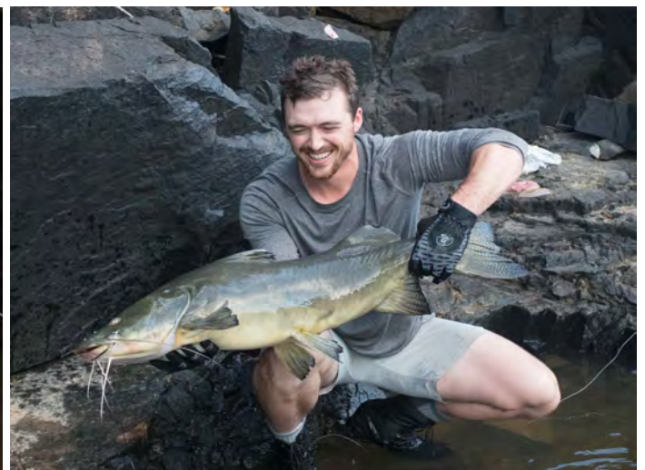
Zungaro zungaro Lau Lau