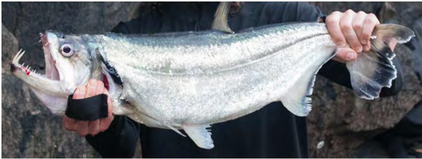
Hydrolycus armatus Payara, Vampire Fish