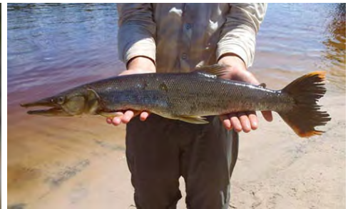
Boulengerella cuvieri Swordfish