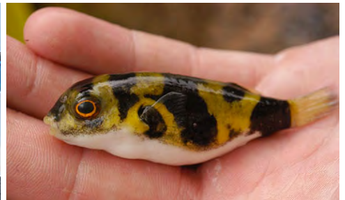
Colomesus asellus Puffer fish