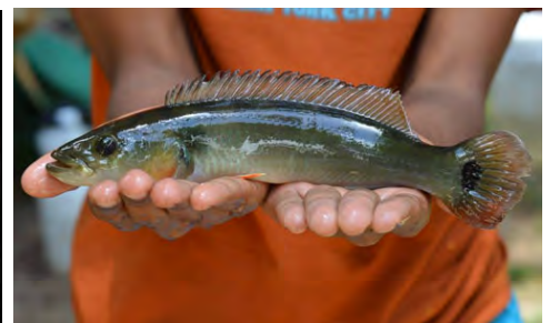
Crenicichla lugubris Sun fish