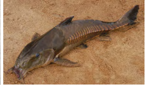
Oxydoras niger Zipper Catfish