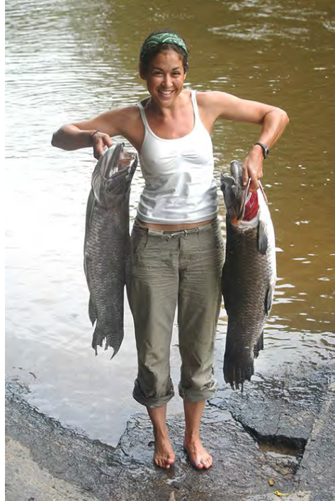
Hoplias aimara Wolfish