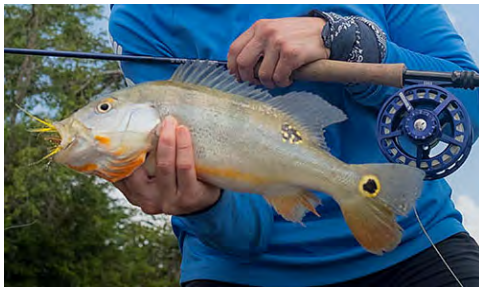
Cichla ocellaris Peacock bass