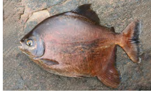
Myleus sp. Pacu