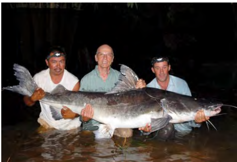
Zungaro zungaro Lau Lau