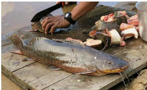
Leiarius marmoratus Leopard catfish