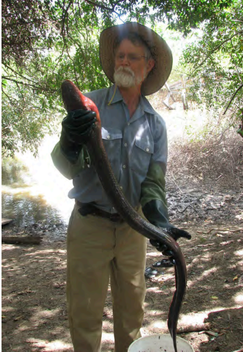
Electrophorus electricus Electric Eel

[fieldguides.fieldmuseum.org] version 1 9/2019